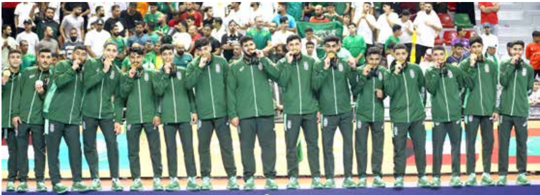
Saudi Arabia's squad present their handball gold medals