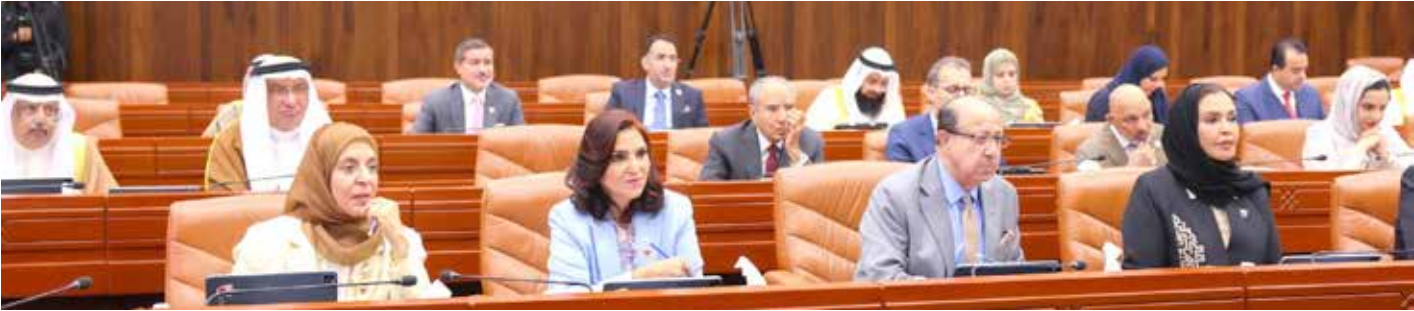
Shura Council session in progress

Shura committee backs investor dispute court with Singapore appeal route