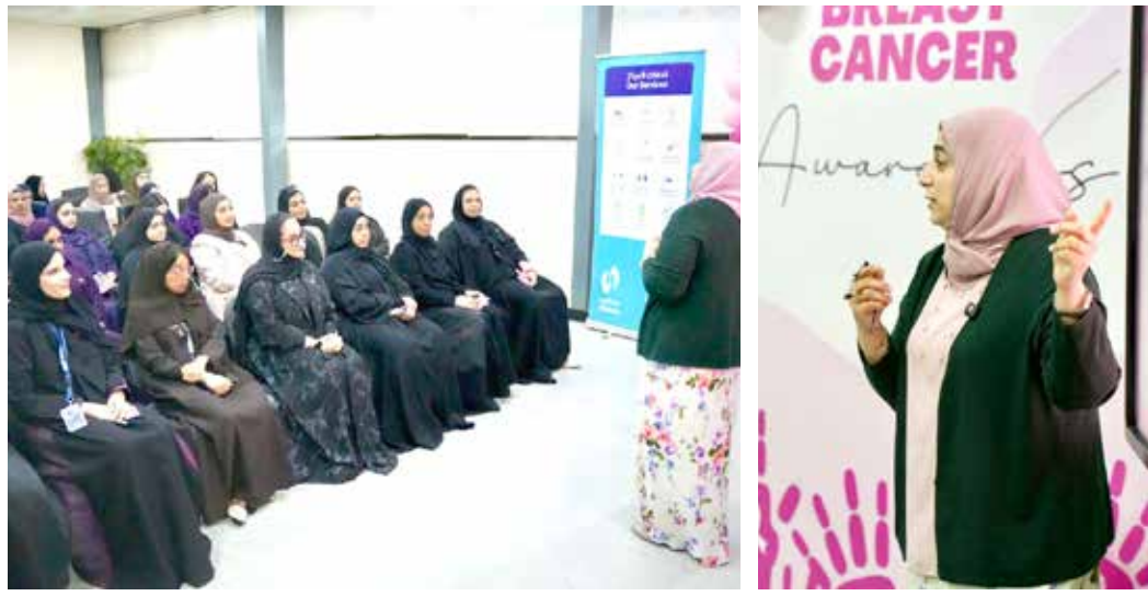
ASRY, in collaboration with Hicare Medical Center, organized a Breast Cancer Awareness event at its Al-Hidd headquarters as part of its ongoing health awareness initiatives. The program featured a lecture by a specialist medical team on early screening, prevention methods, and self-examination techniques, while also addressing common misconceptions about the disease. Free on-site health checks were provided to encourage early detection and improve recovery outcomes. The event also included an exhibition by local pharmacies, offering participants health and beauty products in support of the awareness drive