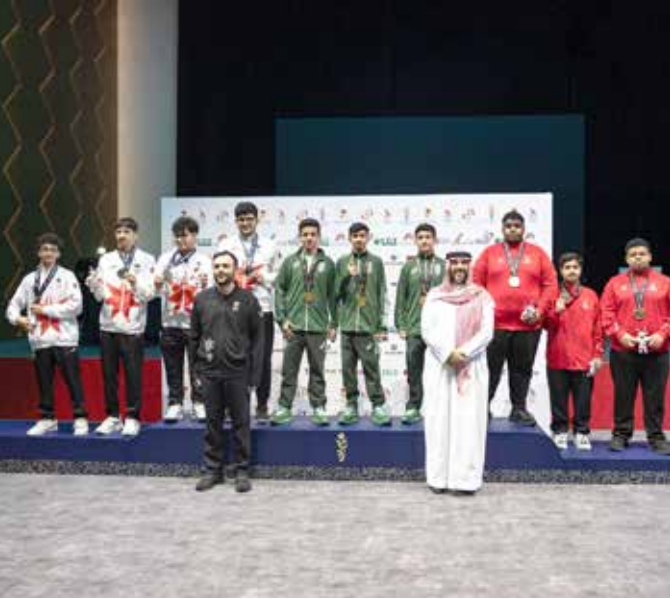
Saudi Arabia top the Rocket League podium ahead of Jordan and Oman