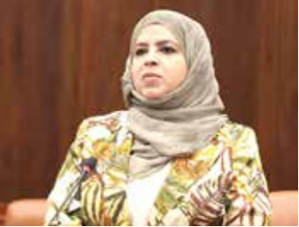
Dalal Al Zayed, Head of Shura Council's Legislative and Legal Affairs Committee

the Constitution. The measure is presented as strengthening Bahrain's role as a venue chosen by parties to resolve cross-border commercial cases, working with well-regarded international commercial courts and encouraging recognised methods of dispute resolution in trade across borders. Urgency was cited on three grounds. The government wants to act on the 20 March 2024 agreement with Singapore on appeals from the new court. It also pointed to a consultancy services agreement signed in March 2024 for one year, extendable by three months, to support legislation, promotion, business growth and staff train-