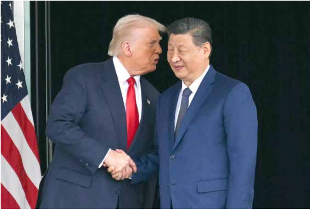
US President Donald Trump (L) and China's President Xi Jinping shake hands as they leave after their talks at the Gimhae Air Base, located next to the Gimhae International Airport in Busan, South Korea

Donald Trump and Xi Jinping agreed yesterday to calm the trade war between China and the United States that has roiled global markets, with Washington cutting some tariffs and Beijing committing to keep supplies of critical rare earths flowing. Trump called his first meeting with Xi in six years a "great success", while the Chinese leader said the two reached an "important consensus" towards solving the fight between the world's two top economies. "I thought it was an amazing meeting," Trump said after the talks in Busan, South Korea, praising Xi as a "tremendous leader of a very powerful country" and saying he would visit China in April. Trump added that the deal included China immediately buying "tremendous amounts of soybeans and other farm products", a key issue for Trump's support in farm country and a point of leverage for Beijing. The US leader said the talks yielded an extendable one-year deal on China's supply of crucial rare earths, materials that are essential for sophisticated electronic components across a range of industries. Beijing's commerce ministry also confirmed it would suspend for one year certain export restrictions, including on rare earth materials, a sector where China is hugely dominant. "All the rare earths has been