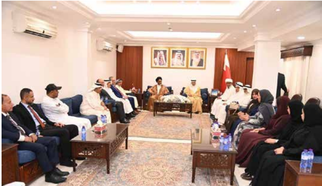
Northern Governorate Governor Hassan bin Abdullah Al Madani emphasized that communication is a key societal value that strengthens national cohesion. During the weekly majlis, he highlighted the importance of preserving the Kingdom's achievements under His Majesty King Hamad bin Isa Al Khalifa and the leadership of His Royal Highness Prince Salman bin Hamad Al Khalifa, Crown Prince and Prime Minister. He praised the community's cooperation and participation in governorate initiatives, reaffirming commitment to strong community partnerships. Residents, in turn, expressed appreciation for the governorate's support and responsiveness to their needs