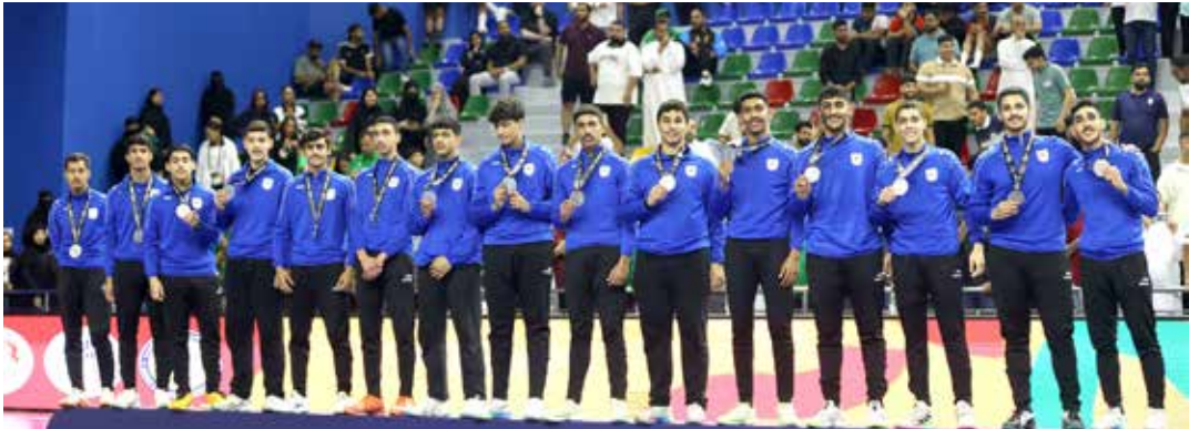
Runners up Kuwait stand on 2nd on the podium