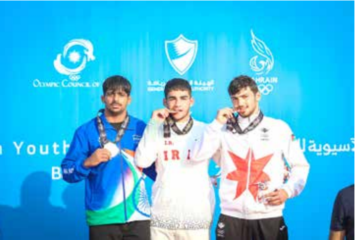
Winners celebrate on the podium