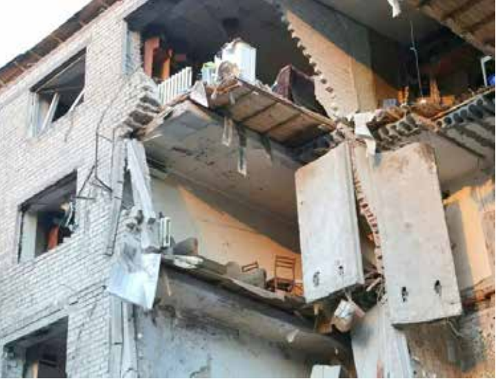
A heavily damaged building following an air attack in Zaporizhzhia

Russia battered Ukrainian energy facilities with hundreds of drones and missiles, Kyiv said yesterday, killing two people, wounding children, and piling more pressure on Ukraine's fragile energy grid. The attack came as Russian forces said they had captured two more villages in eastern and southern Ukraine, where Kyiv's outnumbered forces have steadily lost ground to Moscow. President Volodymyr Zelensky announced the toll in a social media statement and said Russian forces had targeted civilians and energy facilities in nine regions and the capital Kyiv.