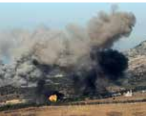
Smoke rises following an Israeli airstrike on the outskirts of the southern Lebanese village of Ej Jarmaq