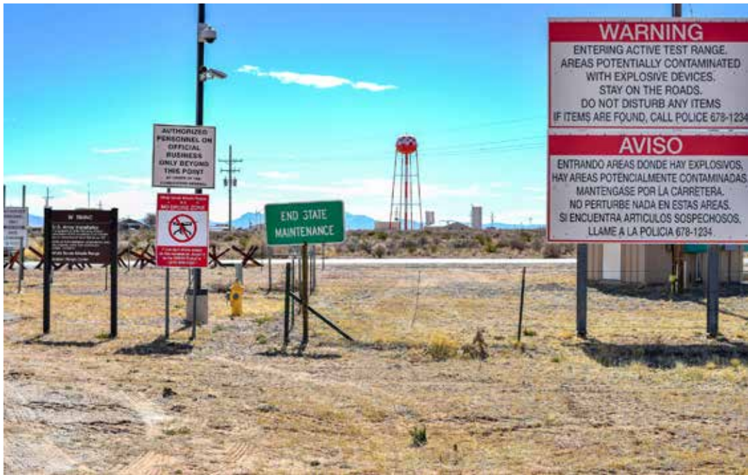
A view of the entrance of White Sands Missile Range where Trinity test site is located, near White Sands, New Mexico

The Stockholm International Peace Research Institute (SIPRI) says in its latest annual report that Russia possesses 5,489 nuclear warheads, compared to