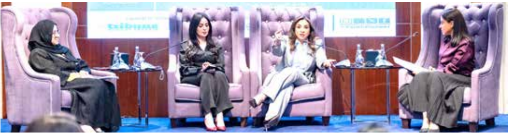
A panel of media experts shares insights

The opening chapter defines key terms and sets the aims of the law. The first chapter sets up the court, confirms its independence and separate legal personality, and places supervision with the Minister of Justice or another minister named by decree. The court works through a President, a Dispute Resolution Panel, an Appellate Panel, panel members and a Registrar-General. A Court Council made up of the President, the Vice-President and all panel members manages the court's affairs, issues by-laws and decisions, and appoints the Registrar-General, a chief executive and an external auditor.