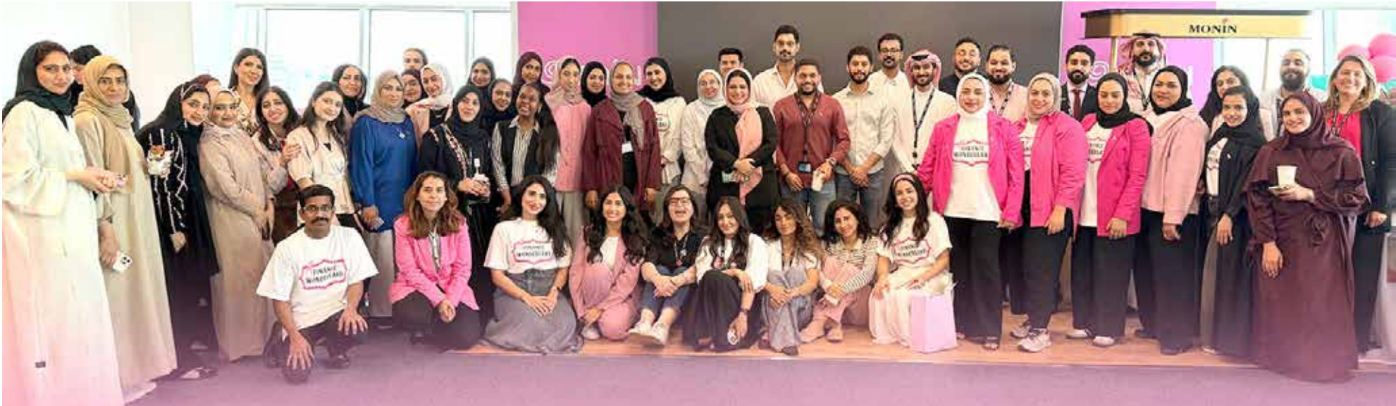
Zain Bahrain held a charity bake sale for employees in support of Breast Cancer Awareness Month, raising funds and awareness for the cause. The event was part of the company's BE WELL wellbeing program promoting health and community care