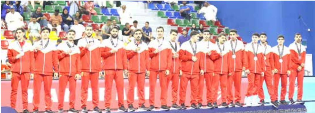
Bahrain's squad present their bronze medals

wait 29-28 in the final to claim gold. Earlier in girls' Group A, Uzbekistan beat Thailand 32-24, Iran overcame Hong Kong 37-21, and China defeated India 39-22.