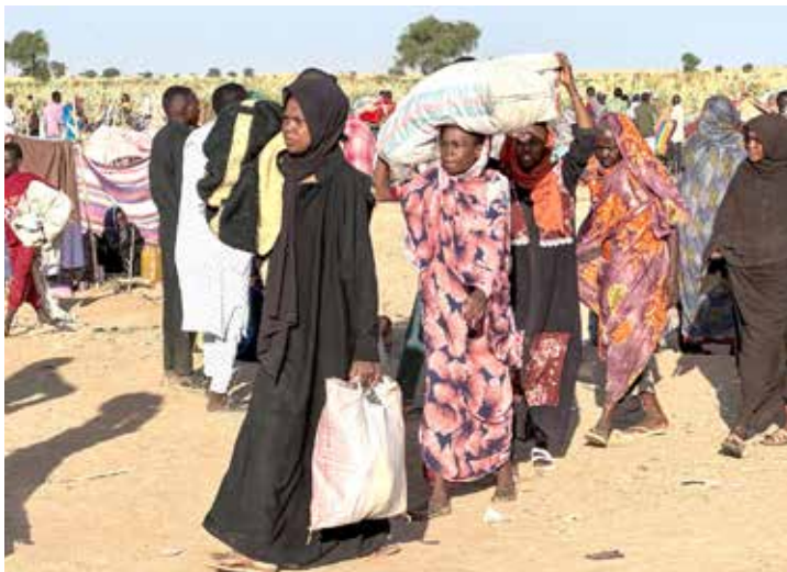
Displaced Sudanese who fled El-Fasher after the city fell to the Rapid Support Forces (RSF), arrive in the town of Tawila

The capture of El-Fasher, the last army holdout in the vast western region of Darfur, comes after more than 18 months of brutal siege, sparking fears of a return to the ethnically targeted atrocities of 20 years ago.