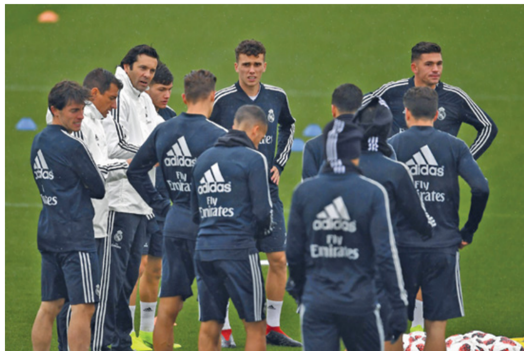
Temporary coach of Real Madrid CF, Argentinian former player Santiago Solari (3L), talks to players during a training session

"I will do everything I can. It's a great opportunity and it's a great club. I don't just say that now as coach of the first team. I've been here with other teams, I've played and sweated in the shirt of this club"