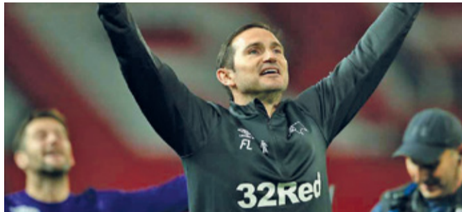
Frank Lampard of Derby County celebrates victory after the Carabao Cup Third Round match between Manchester United and Derby County