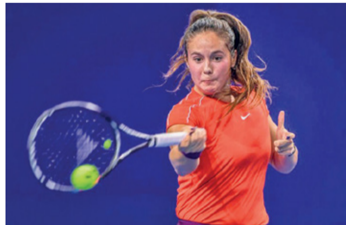
Kasatkina hits a return against Wang Qiang of China in their first-round match of the Zhuhai Elite Trophy tournament

Finally, after almost two hours on court, it was Kasatkina who held on to her serve at the crucial time to take the third and final set 7-5.