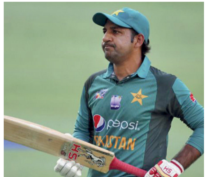
Sarfraz Ahmed reacts during a match (file photo)