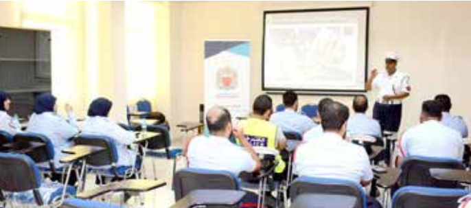
Bahrain's school guards and community police take part in the training and refresher courses