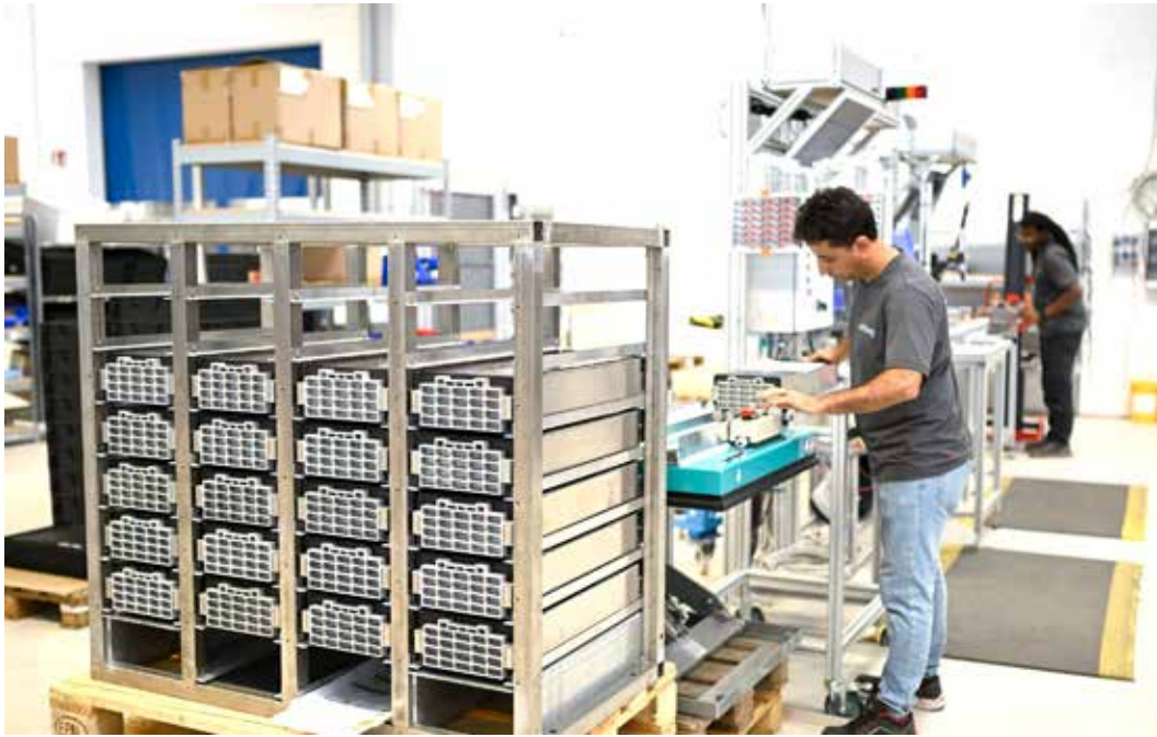
A worker assembles battery units at the production site of Voltfang, a developing and manufacturing battery storage producer, in Aachen, western Germany

Its CEO David Oudsandji hopes it will help Europe's biggest economy ween itself off fossil fuels and increasingly rely on climate-friendly renewables. While wind turbines now dot Germany's countryside and photovoltaic panels are found on many rooftops, he says the country still needs to build up battery storage capacity. "We want to ensure European sovereignty in energy supply by enabling renewable energy production through storage," Oudsandji, 29, told AFP. "We can generate enormous amounts of electricity from solar