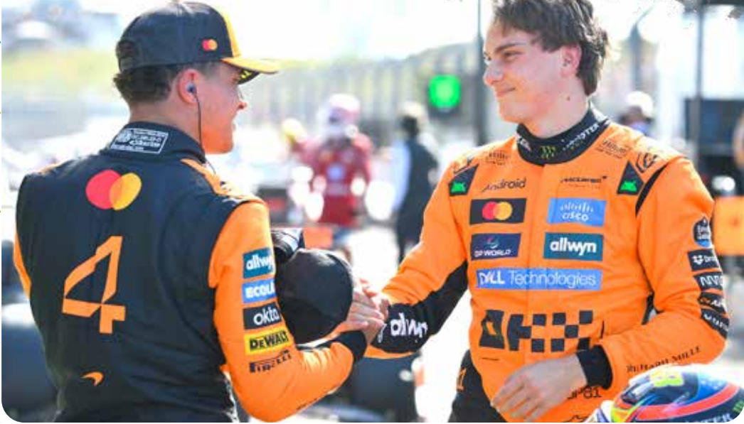
McLaren's Australian driver Oscar Piastri (R) is congratulated by McLaren's British driver Lando Norris after winning the pole position during the qualifying session of the Formula One Dutch Grand Prix at The Circuit Zandvoort, western Netherlands

the Australian in all three practice sessions so far, but Piastri hit back when it counted to give himself an advantage for the race.