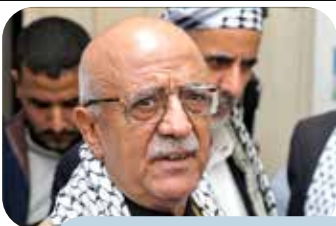
Yemen's Huthis say PM killed in Israeli strike

◆ The prime minister of Yemen's Huthis was killed in an Israeli airstrike along with other officials earlier this week, the Iran-backed rebels announced yesterday. Ahmed Ghaleb Nasser Al-Rahawi, who was appointed last year, is the most senior official known to have been killed in a series of Israeli strikes during the war in Gaza. "We announce the martyrdom of the fighter Ahmed Ghaleb Nasser Al-Rahawi... along with several of his ministerial colleagues, as they were targeted by the treacherous Israeli criminal enemy," a Huthi statement said. "Others among their companions were injured with moderate to serious wounds and are receiving medical care since Thursday afternoon," it added. The Israeli military struck in the area of Sanaa, the Huthi-held capital, on Thursday. The Huthis, claiming solidarity with the Palestinians, have frequently fired missiles and drones at Israel during the Gaza war.