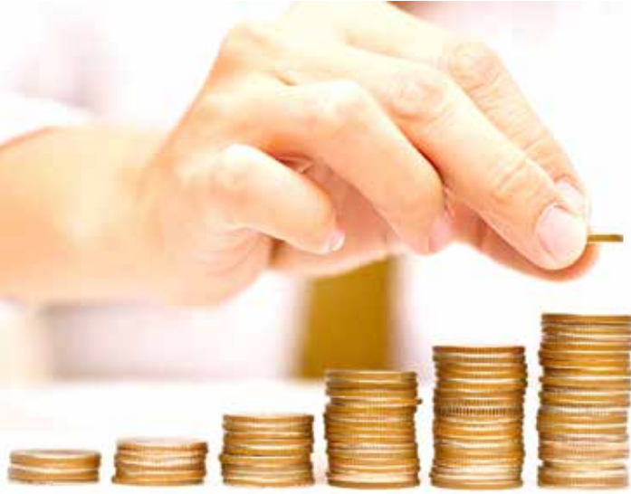
Image used for illustrative purposes only up once they reach six months.

Where service falls short of the qualifying period, a lump-sum payment is made instead. Fractions of a service year are rounded