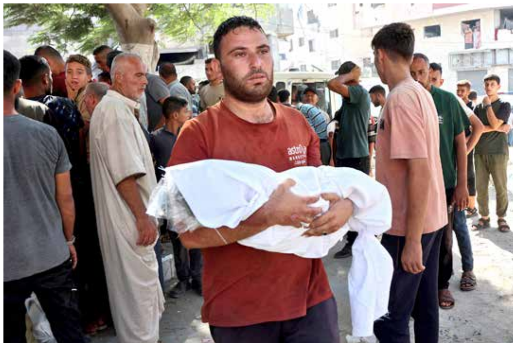
A Palestinian man carries the shrouded body of a baby killed in an Israeli strike on a makeshift bakery housed in a tent on Al-Nassr Street in Gaza City