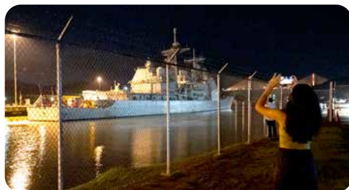
A woman takes pictures as the US Navy warship USS Lake Erie (CG 70) crosses the Pedro Miguel Locks of the Panama Canal amid an US naval deployment near the coast of Venezuela in Panama City

The United States has, however, made no public threat to invade Venezuela.