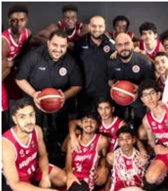
Bahrain's U16 players during their official photo shoot ahead of the Asia Cup

The squad, under Tunisian head coach Rassem Marzooqi, come into the tournament with momentum. In July, they captured the Fiba U16 Asia Cup GBA