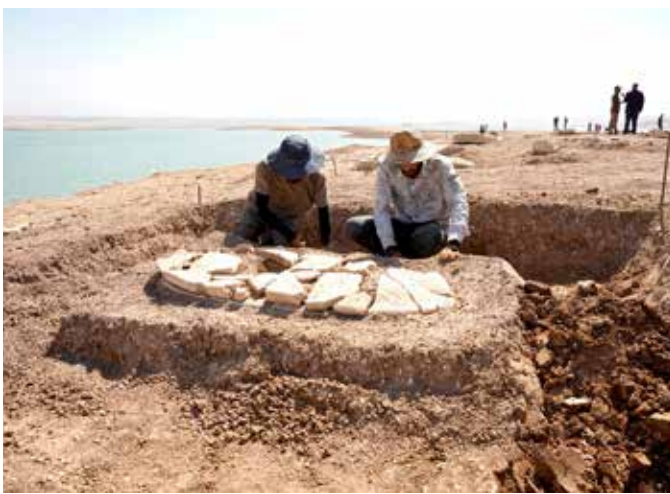
Kurdish members of the Dohuk Antiquities Department work on a grave unearthed on the banks of Mosul Dam on an archaeological site in the Khanke sub-district of Dohuk Governorate