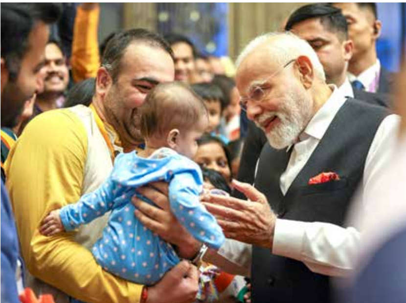
China's Indian community accorded a very special welcome in Tianjin

The SCO comprises China, India, Russia, Pakistan, Iran, Kazakhstan, Kyrgyzstan, Tajikistan, Uzbekistan and Belarus. Another 16 countries are affiliated as observers or "dialogue partners".