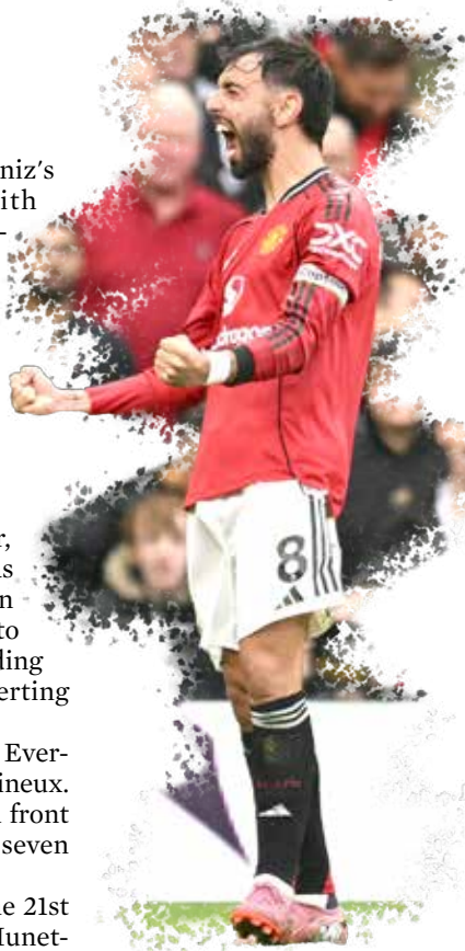
Manchester United's Portuguese midfielder #08 Bruno Fernandes

chan and he lashed into the roof of the net for his first goal since December.