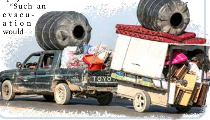
A vehicle towing a cart, both carrying cisterns and other belongings of displaced Palestinians fleeing south

"It is impossible that a mass evacuation of Gaza City could ever be done in a way that is safe and dignified under the current conditions," International Committee of the Red Cross president Mirjana Spoljaric said in a statement.