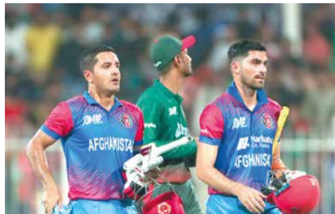
Najibullah Zadran and Ibrahim Zadran produced a stunning display with the bat and helped Afghanistan beat Bangladesh in the Asia Cup 2022 Group B match in Sharjah.

But with Afghanistan needing 66 from 42 balls, Ibrahim Zadran (42, 41b, 4x4) and Najibullah Zadran (43, 17b, 1x4, 6x6) brought out the big hits in an enterprising 69-run stand.