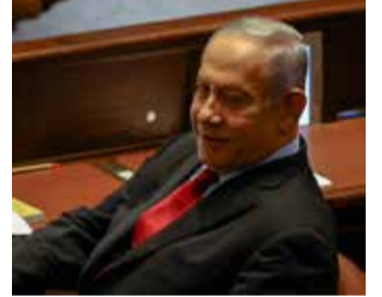
Former Israeli Prime minister Benjamin Netanyahu

As well as the 45 dead, at least 100 people were injured at the festival on the slopes of Mount Meron, which was