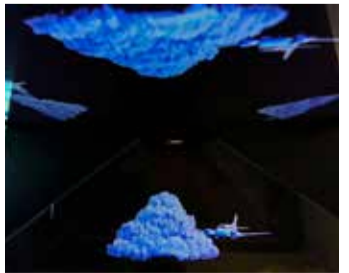
An explanatory hologram of the cloud seeding process is seen inside the control room

to our calculations, cloud seeding operations cost much less than the desalination process," Hammadi said.