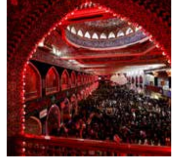
Pilgrims take part in a mourning ceremony, ahead of the holy Shi'ite ritual of Arbäeen, in Kerbala, Iraq. Mohammad, Imam Hussein. Arbäeen falls on Sept. 16-17 this year. "As security and calm have been restored in Iraq, all borders are open now," state TV quoted an Iranian official as saying.

Millions of Iranians travel to the Iraqi city of Kerbala every year for the ritual of Arbäeen, which marks the end of a 40-day mourning period for the grandson of the Prophet