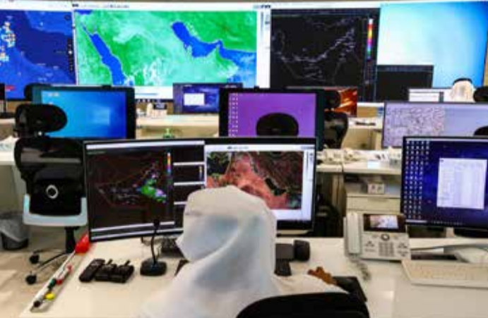
An inside view of the control room at the National Center of Meteorology in Abu Dhabi, United Arab Emirates

erate the condensation process and hopefully produce droplets big enough to then fall as rain.