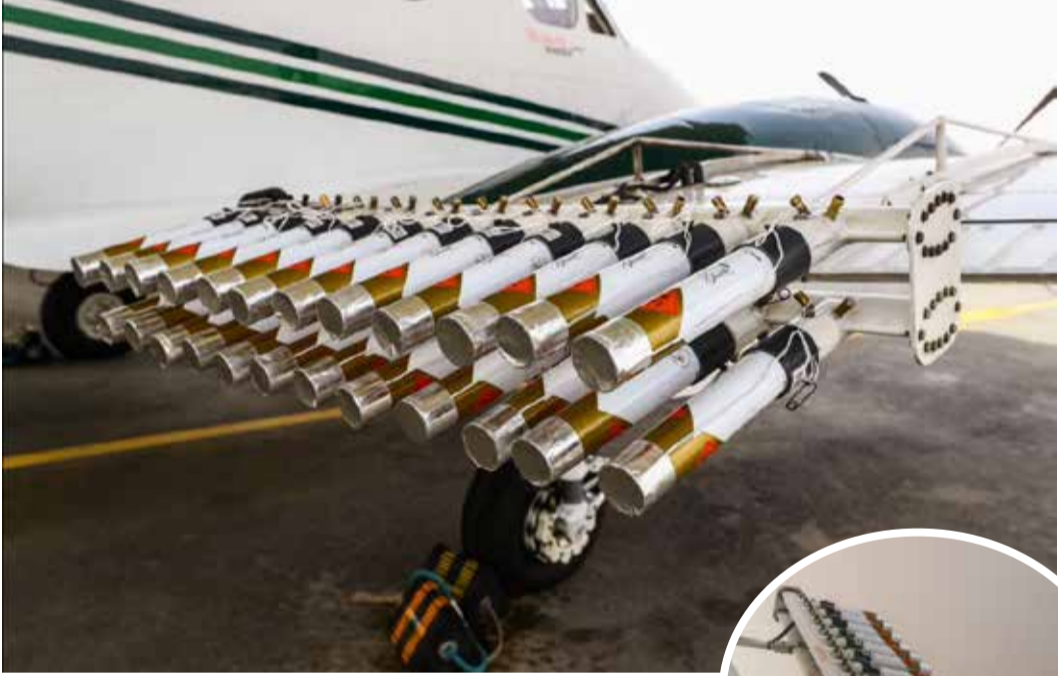
Hygroscopic flares are attached to an aircraft ahead a cloud seeding flight operated by the National Center of Meteorology, at Al Ain International Airport in Al Ain, in United Arab Emirates

Officials say they believe cloud seeding can help. Scientists in Abu Dhabi combine shooting hygroscopic, or water-attracting, salt flares with releasing salt nanoparticles, into the clouds to stimulate and accel-