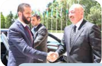
Syrian, Israeli ministers to hold meeting in Baku today: diplomat

◆ A Syrian-Israeli ministerial meeting is set to take place Thursday in Baku to discuss security matters in southern Syria, a diplomat told AFP. The meeting between Syrian Foreign Minister Asaad al-Shaibani and Israeli Minister of Strategic Affairs Ron Dermer follows a similar meeting between the two ministers in Paris last week. It will take place after an unprecedented visit by Shaibani to Moscow on Thursday, added the diplomat, who requested anonymity due to the sensitivity of the matter. Israel and Syria have technically been at war since 1948. The meeting in Baku will focus on “the security situation, particularly in southern Syria”. The Paris meeting focused mainly on “recent security developments and attempts to contain the escalation in southern Syria”, according to Syrian state television.