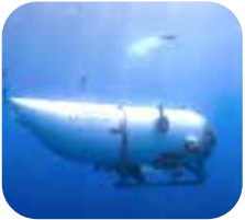
Chinese sub discovers deepest-ever creatures 10 km undersea

◆ A Chinese submersible has discovered thousands of worms and molluscs nearly 10 kilometres (six miles) below sea level in the Mariana Trench, the deepest colony of creatures ever observed, a study revealed yesterday. The discovery in Earth's deepest underwater valley suggests that there could be much more life thriving in the hostile conditions at the bottom of our planet's largely unexplored oceans than previously thought, the China-led team of scientists said. Almost all life on Earth is supported by light from the Sun. However in the total darkness at the bottom of the world, these creatures live off of chemicals such as methane seeping through cracks in the seafloor, a process called chemosynthesis. Last year, the Chinese submersible “Fendouzhe” -- or “Striver” -- dove 23 times into the depths of the Mariana Trench in the western Pacific Ocean with researchers on board, according to the study in the journal Nature.