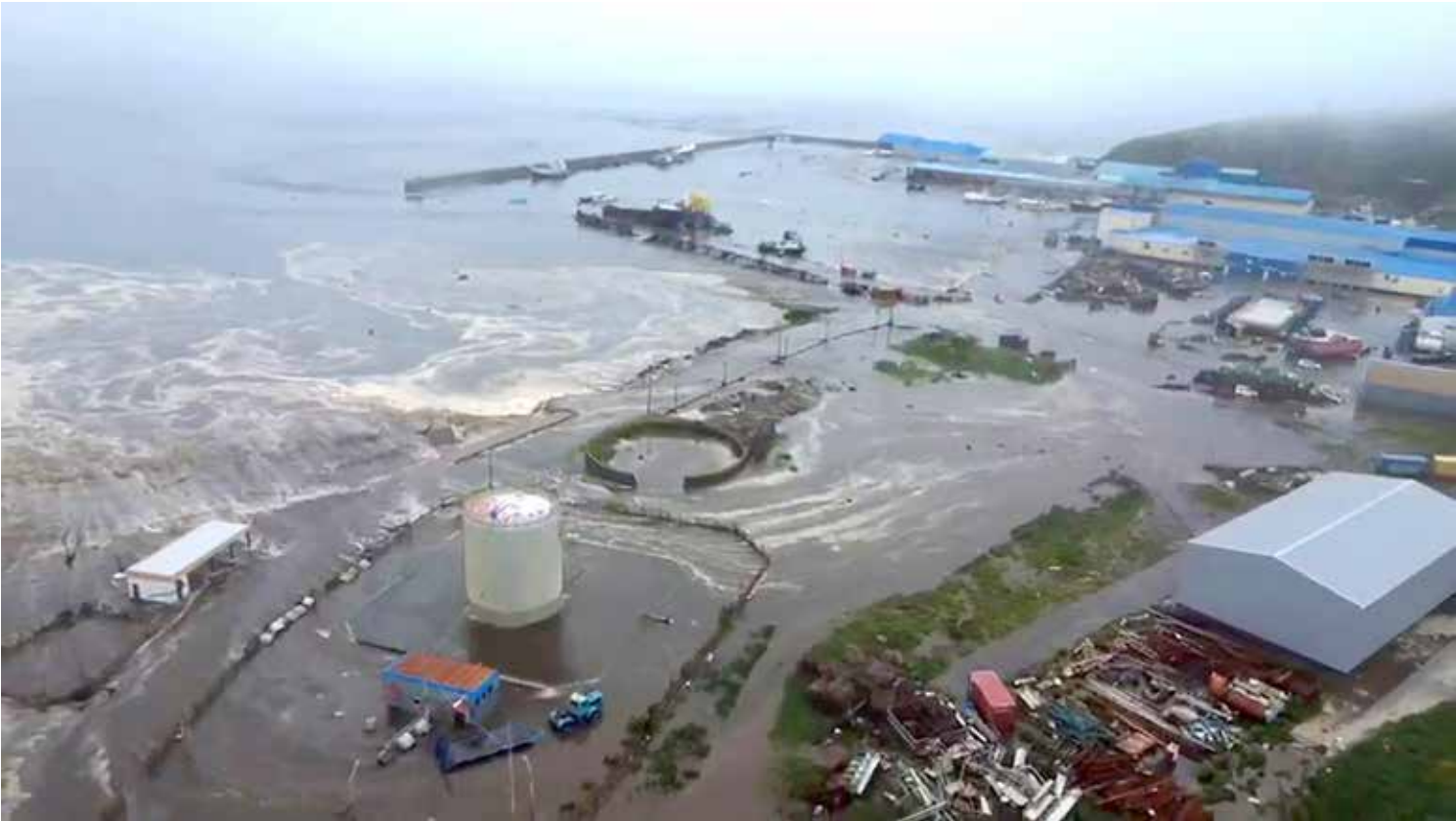
The tsunami-hit Severo-Kurilsk on Paramushir island of Russia's northern Kuril islands.

year it was drafting laws that will ban children from social media sites such as Facebook, TikTok and Instagram until they turn 16. The government had previously indicated YouTube would be exempt, given its widespread use in classrooms. “Young people under the age of 16 will not be able to have accounts on YouTube,” Prime Minister Anthony Albanese told reporters on Wednesday. “They will also not be able to have accounts on Facebook, Instagram, Snapchat, TikTok, and X among other platforms. “We want Australian parents and families to know that we have got their back.” Albanese said the age limit may not be implemented perfectly -- much like existing restrictions on alcohol -- but it was still the right thing to do.