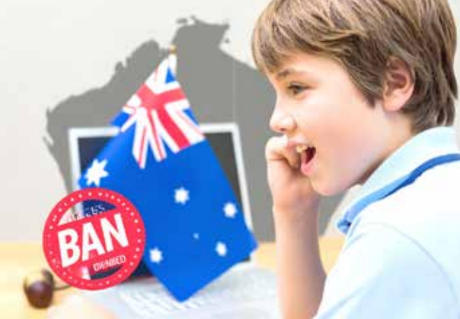
Sydney, Australia

Australia will use landmark social media laws to ban children under 16 from video-streaming site YouTube, a top minister said Wednesday stressing the need to shield them from “predatory algorithms”. Communications Minister Anika Wells said four-in-ten Australian children had reported viewing harmful content on YouTube, one of the most visited websites in the world. “We want kids to know who they are before platforms assume who they are,” Wells said in a statement. “There’s a place for social media, but there’s not a place for predatory algorithms targeting children.” Australia announced last