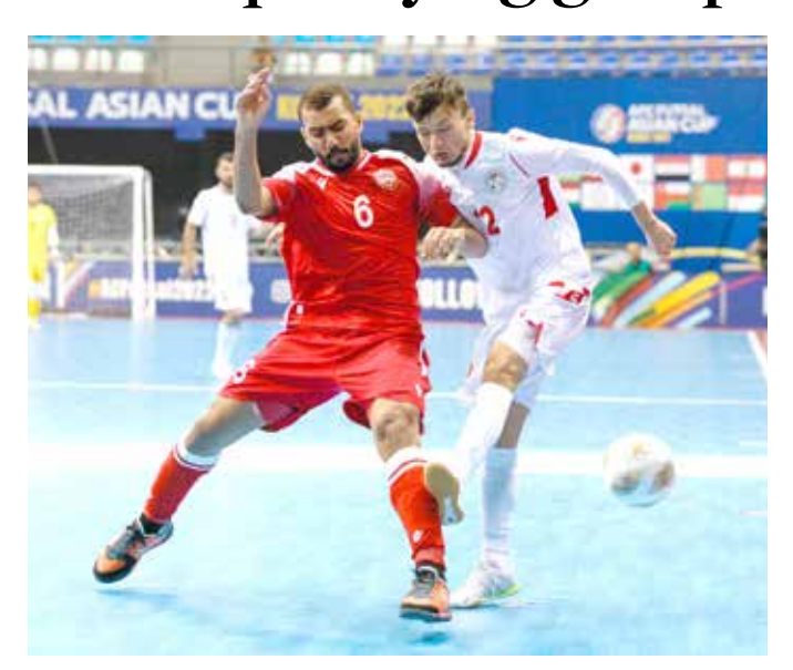
Bahrain in action at last year's AFC Futsal Asian Cup (File photo)

Bahrainis down 0-2 on aggregate heading into second leg against Tunisia's Union Sportive Monastirienne (USM) in second qualification round for 2023 King Salman Club Cup