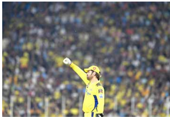
CSK's captain Mahendra Singh Dhoni adjusts the field during the match

He has now equalled Rohit Sharma's record of five titles