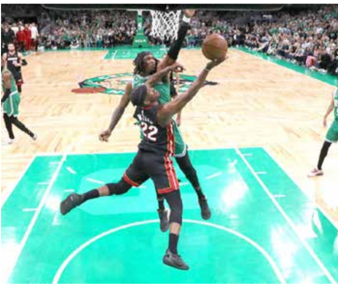
Jimmy Butler #22 of the Miami Heat shoots the ball against Robert Williams III #44 of the Boston Celtics