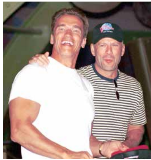
Arnold Schwarzenegger and Bruce Willis