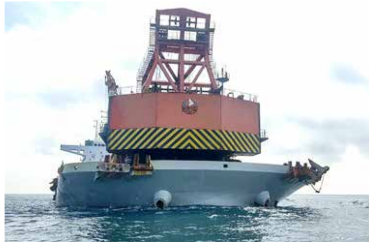
A Chinese vessel after anchoring near Tanjung Siang on the waters of the Malaysia's Johor state