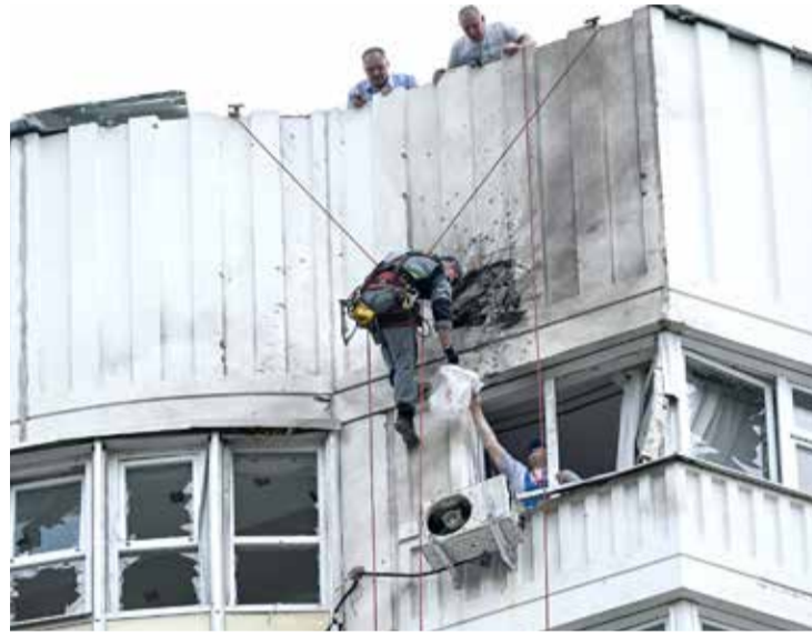
A specialist inspects the damaged facade of a multi-storey apartment building after a reported drone attack in Moscow

The other drones fell outside Moscow. Some of the debris was found around 15 kilometres from President Vladimir Putin's Novo-Ogaryovo residence.