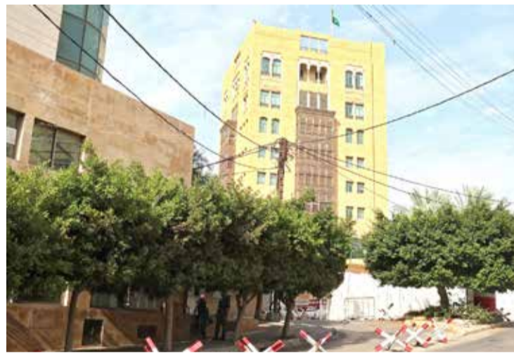
The Embassy of Saudi Arabia in Beirut

A senior Lebanese security source had said on Monday that, based on preliminary informa-