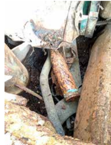
Malaysian Maritime Enforcement Agency shows an old cannon shell

official told AFP on condition of anonymity that the pieces of metal and shells could have originated from two sunken British warships. More than 800 Brit-