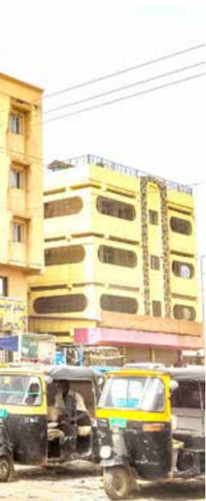
South of Khartoum

requiring "urgent" action from the international community. The rainy season is set to start, threatening to make parts of the vast northeast African country inaccessible and raising risks of malaria, cholera and other-borne diseases.