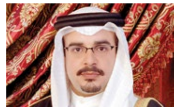
HRH the Crown Prince

The NHRA granted the Middle East Hospital (MEH) a licence to