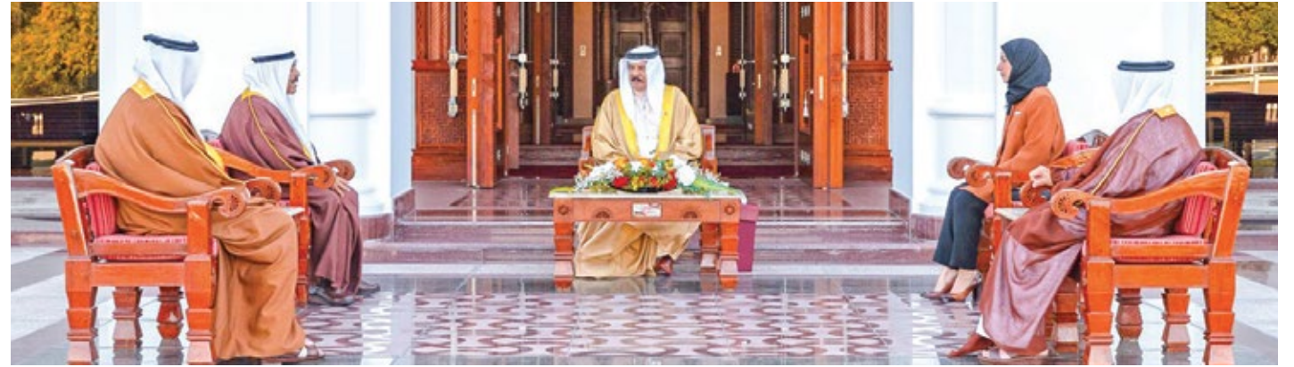
HM the King speaks with officials at Safriya Palace

HM the King also voiced his appreciation for the unrelenting national efforts taken to serve the nation and its citizens in safe-