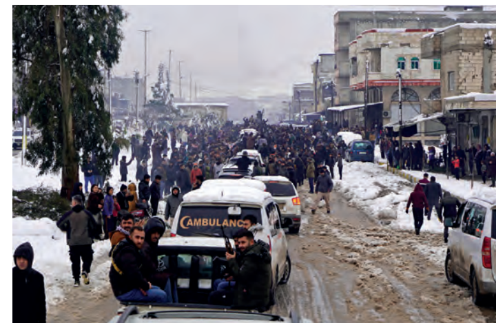
Members of Kurdish-led Syrian Democratic Forces (SDF) arrive at the Kurdish-held city of Ain al-Arab (file photo)