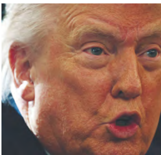
Trump Oslo, Norway

North Korean leader Kim Jong Un laid out ambitious plans Thursday for major construction projects across the country in the coming year, including public health facilities, leisure complexes and industrial plants to be built in 20 regions. "We are now standing on the starting line of our gigantic struggle for another year, aimed at transforming the regions," Kim said in a speech cited by the official KCNA news agency.