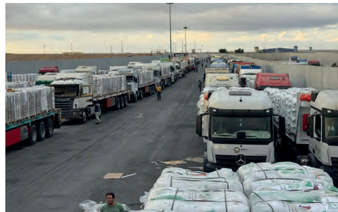
Trucks loaded with humanitarian aid are parked on the Egyptian side of the Rafah crossing, waiting to get access to the Gaza Strip (file photo)

“The Rafah Crossing will open this coming Sunday (February 1st) in both directions, for limited movement of people only,” COGAT, an Israeli defence ministry body overseeing civil