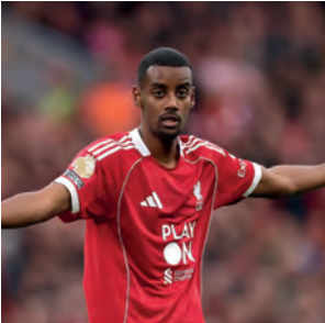
Alexander Isak AFP | London

Newcastle still coping with fallout from Isak exit, says Howe