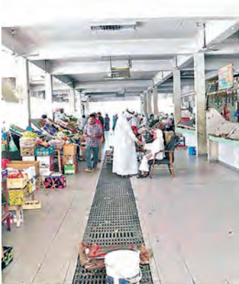
sitra central market

Lawmakers are also addressing issues related to vendors. Some proposals seek the removal of street vendors and