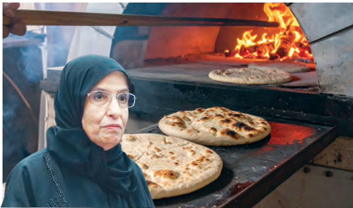
MP Lulwa Al Rumaihi

The ministry said direct price controls apply only to government-subsidised flour and bread produced from it, stressing that there is no wider price-setting for food or consumer goods under the free-market approach.