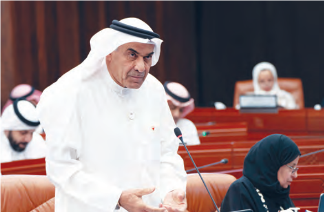
Hassan Eid Bukhammas, Chairman of Parliament's Foreign Affairs, Defence and National Security Committee