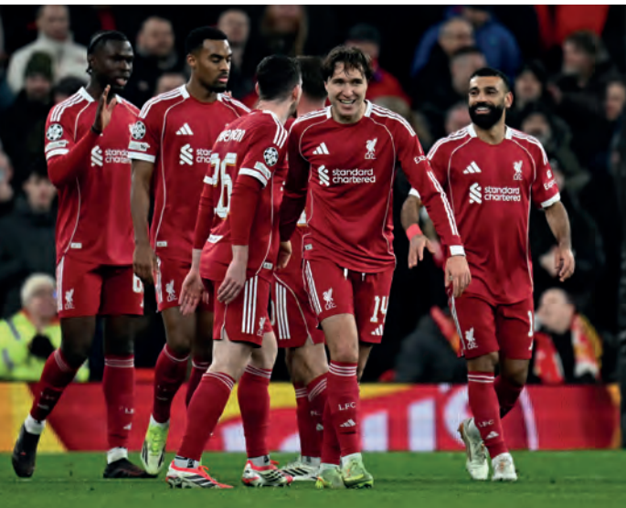
Liverpool's Italian striker #14 Federico Chiesa celebrates scoring

The Reds conceded in the 95th minute to lose 3-2 to