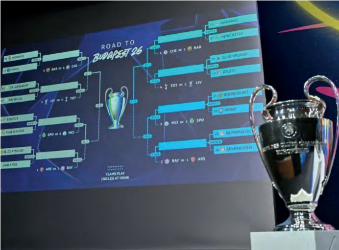
UEFA Champions League Cup is displayed next to the results appearing on a giant screen

Real Madrid were handed a quick rematch with Jose Mourinho's Benfica in the draw for the Champions League play-off round yesterday, while reigning European champions Paris Saint-Germain will face domestic rivals Monaco. Benfica beat Real 4-2 in their final game of the league phase on Wednesday, with a 98th-minute goal by goalkeeper Anatoli Trubin proving decisive in allowing the Portuguese side to snatch the last play-off spot ahead of Marseille, who were eliminated altogether. The defeat also nudged Madrid out of the top eight places in the league standings, which give direct access to the last 16, forcing them into this extra round. Benfica staged a remarkable recovery to take a play-off place -- they finished 24th in the 36-team league phase, the last qualifying spot -- by winning three of their last four matches after losing their opening four games. Mourinho, 63, returned to the Lisbon giants for a second spell as coach in September. He was in charge of Real from 2010 to 2013 and won one La Liga title