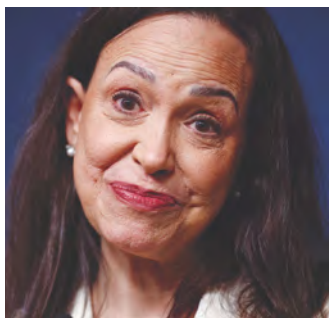
Nobel Peace Prize winner Maria Corina Machado

The Norwegian Nobel Institute yesterday confirmed that the name of the winner of the 2025 peace prize had been "illegally" leaked before the announcement, without ruling out that a state actor may have been involved.