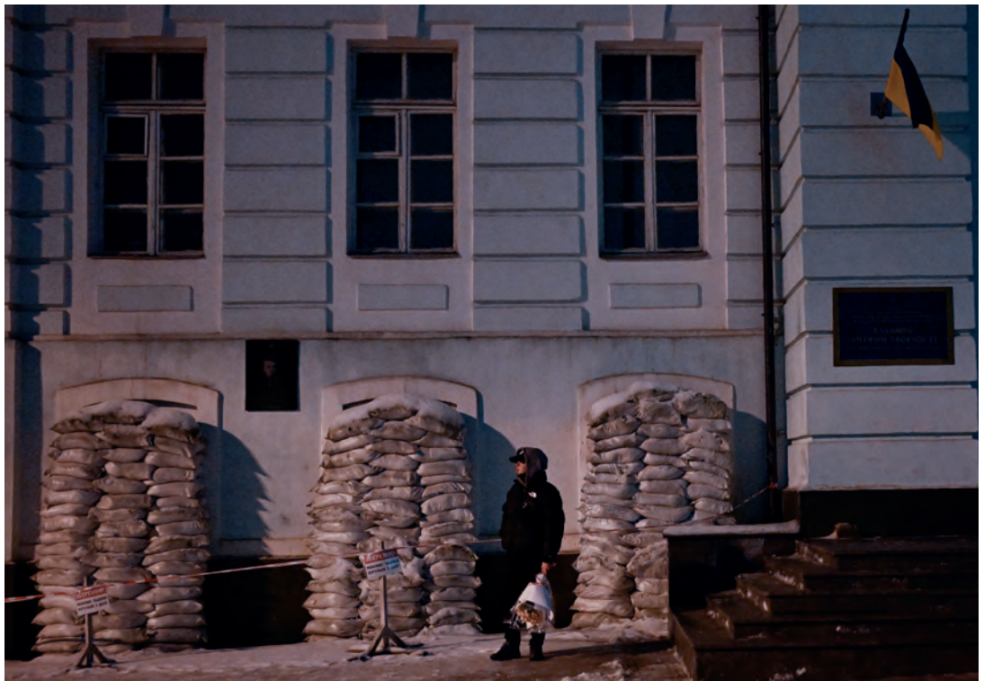
A man holding flowers stands next to a building with its windows protected by sandbags against possible damage caused by air strikes in Kyiv

"I personally asked President Putin not to fire into Kyiv and the various towns for a week,"