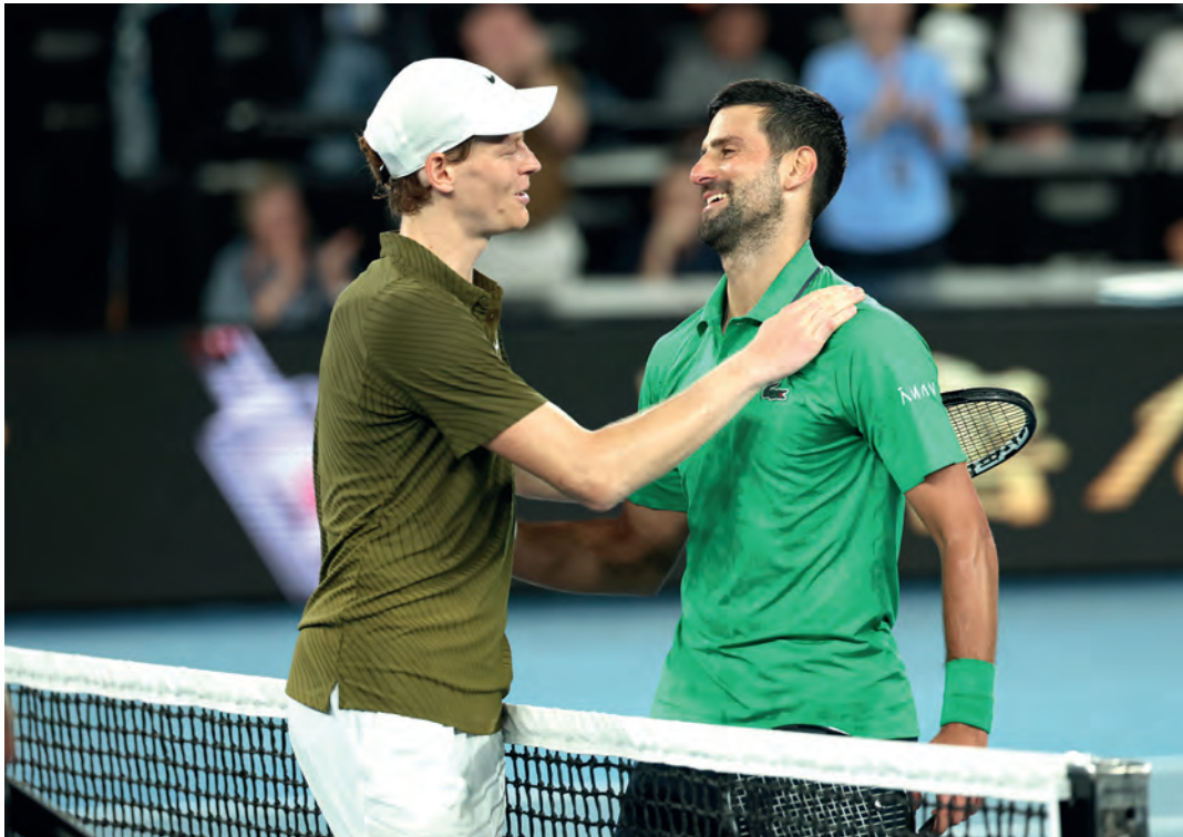
Serbia's Novak Djokovic (R) embraces Italy's Jannik Sinner after their match

The win propelled Djokovic into a 39th Grand Slam final and made him the oldest man in the