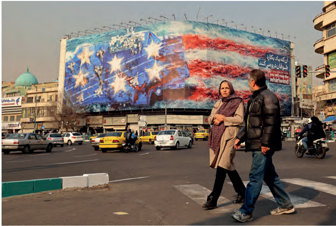
Commuters walk past an anti-US billboard installed on a building at the Enqelab Square in Tehran

But, he emphasised, “I want to state firmly that Iran’s defensive and missile capabilities will never be subject to negotiation”,