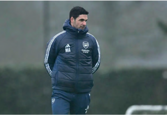
Mikel Arteta looks on during training

Arteta focuses on the positives despite Arsenal stumble