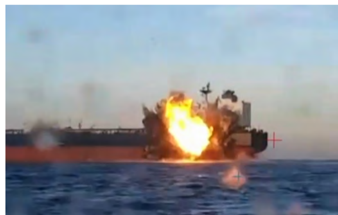
Video grab taken from images released by the Security service of Ukraine (SBU) shows smoke rising from a cargo ship on fire in the Black Sea off the Turkish coast

On Friday evening, Turkey's transport ministry said two empty oil tankers, the Virat and the Kairos, had reported explosions but sustained no casualties, saying they had been struck in Turkish waters but without saying what had