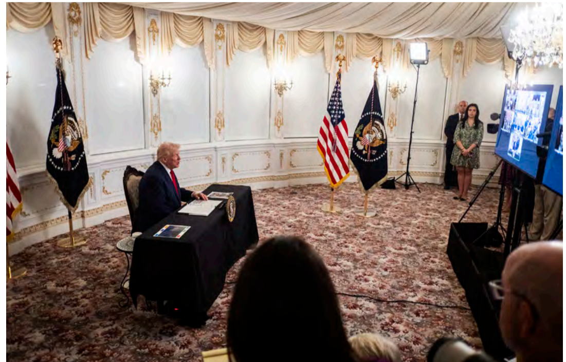
President Donald Trump participates in a call with U.S. service members from his Mar-a-Lago club in Florida

US forces have carried out strikes against more than 20 alleged Venezuelan drug-smug-