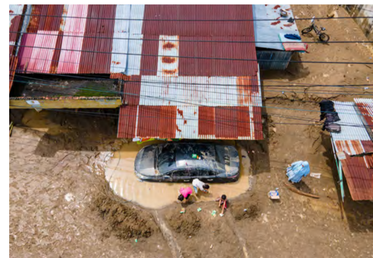
An aerial picture shows children playing near a car trapped in muds by flash floods in Meureudu, Pidie Jaya district Indonesia's Aceh province

Tens of thousands of people have been evacuated, although access to many parts of those three provinces remains cut off, National Disaster agency head