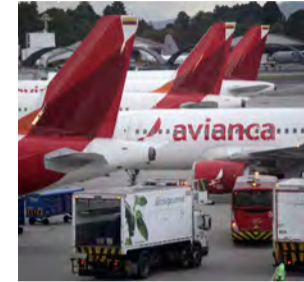
Avianca planes sit on the tarmac at El Dorado airport in Bogota | Washington

Fears of days of travel chaos across Europe and the world eased yesterday after plane manufacturer Airbus intervened rapidly to implement a software upgrade it had said was immediately needed on some 6,000 of its stalwart A320 planes.