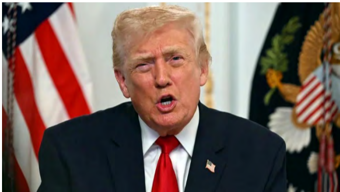
US President Donald Trump speaks to the press

US President Donald Trump made a major intervention into Honduran politics days before the country's presidential election, pardoning a convicted ex-leader and threatening to cut US support if his preferred candidate loses.