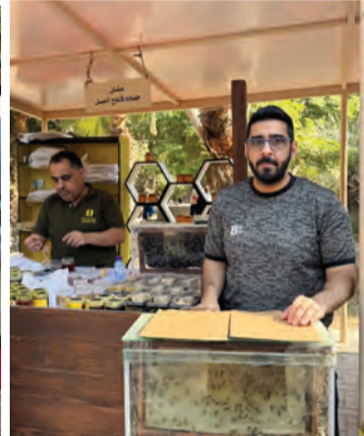
Bahraini farmers welcome families and visitors with newly harvested produce and lively displays

ditional cultivation practices, especially as demand for fresh, chemical-free produce continues to rise among residents.