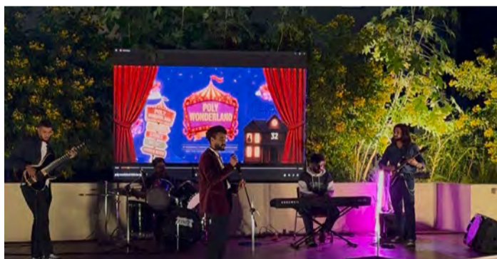
A night of music and activities

Attendees engaged in a wide variety of games and competitions, ranging from interactive challenges to skill-based activities.