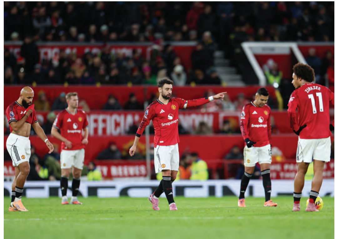
Manchester United players react to conceding a goal (file photo)

That defeat has added to the pressure on United ahead of Sunday's Premier League match away to a Crystal Palace side who started the weekend sixth in the table -- four places above Amorim's men.