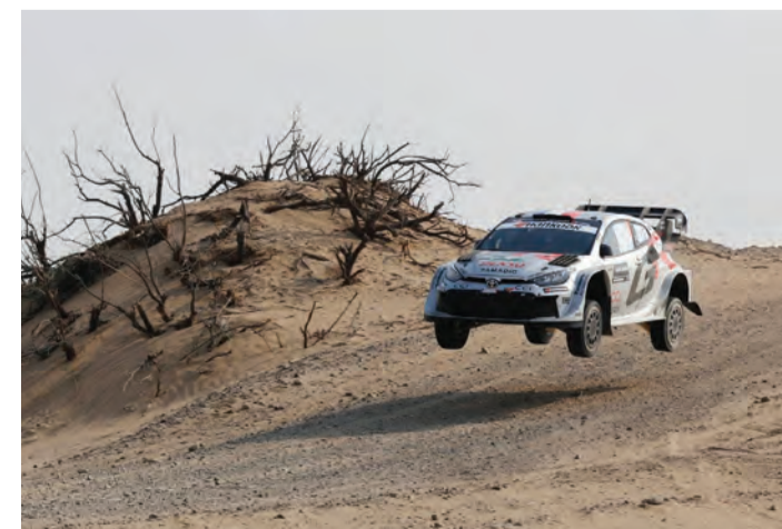
Action from the event

Ogier's exploit was all the more remarkable as he was competing as a 'part-time' driver this year, skipping three of the 14 rallies.