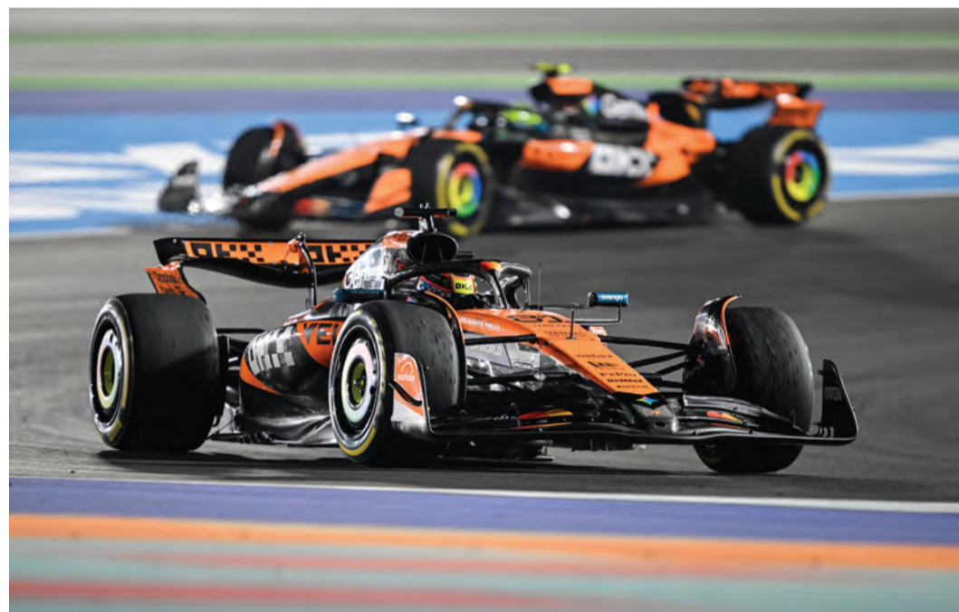
McLaren's Australian driver Oscar Piastrì and McLaren's British driver Lando Norris drive during the sprint race