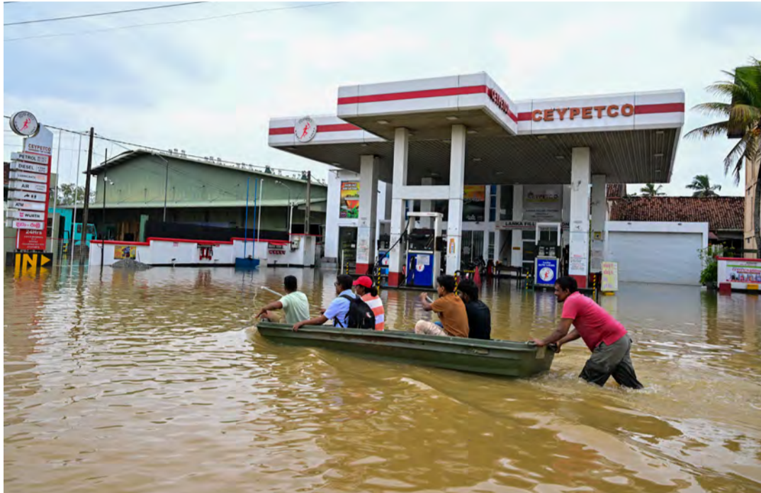
People ride a boat across a flooded street in Ambatale on the outskirts of Colombo

The military rescued 69 bus passengers yesterday, including a German tourist, who had been