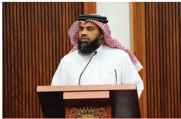
MP Bader Al Tamimi

They argue that, over such a long period, it is normal for a person's income to rise above BD1,200, even by a small margin, and that this rise then becomes a reason to refuse the application at the nomination stage.