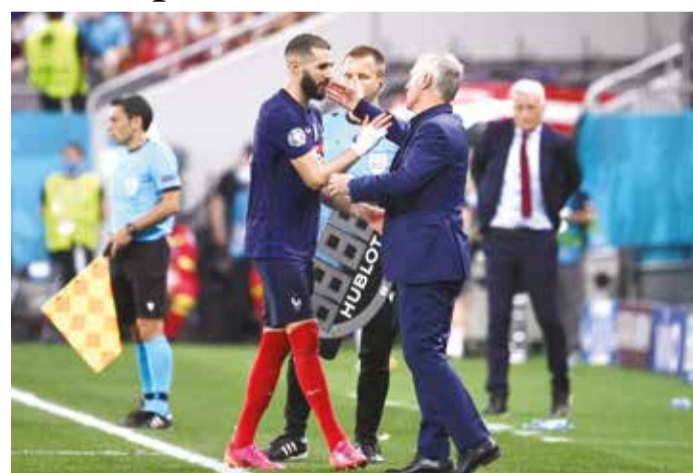
France's coach Didier Deschamps (L) greets Karim Benzema (R) after being substituted during a match (file photo)

there, but these things are not on my mind. I don't know who is saying what, where or how,” the France coach said at a press conference ahead of Wednesday's final group game against Tunisia.