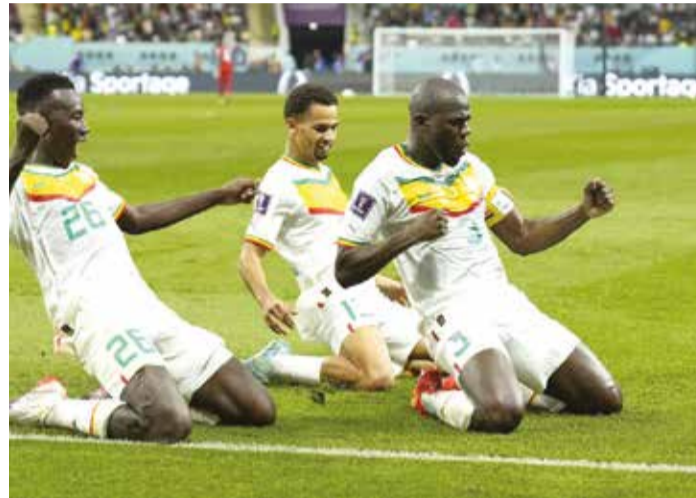
Senegal's Kalidou Koulibaly, right, celebrates with teammates scoring his side's second goal

Senegal opened the scoring through Ismaila Sarr's penalty late in the first half, but despite managing to keep Ecuador captain Enner Valencia quiet throughout, Brighton's Moises Caicedo levelled in the 67th minute before Koulibaly sent his team through and Ecuador