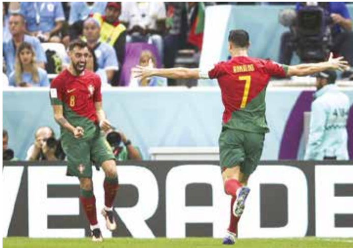
Cristiano Ronaldo and Bruno Fernandes celebrate after a goal celebrations and was then seen announced as the official scorer laughing when Fernandes was on the stadium's loudspeakers.

Portugal's captain appeared to be claiming the goal with his