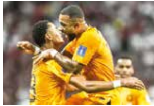
Cody Gakpo of the Netherlands, left, celebrates after scoring