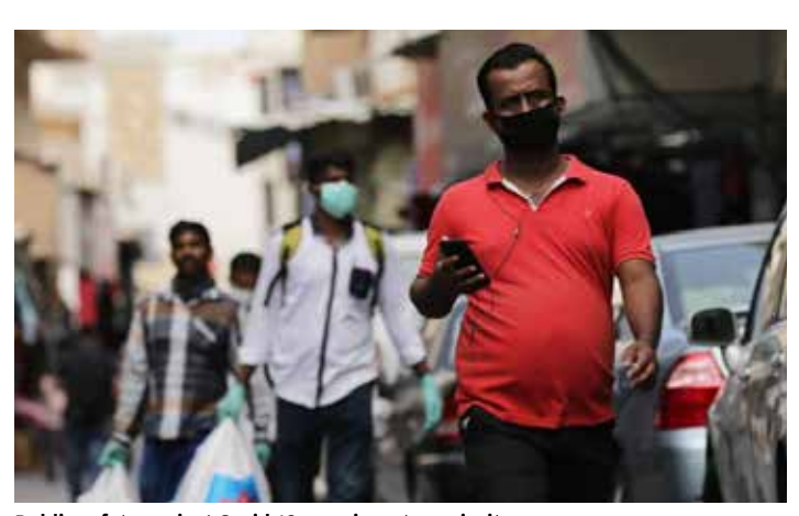
Public safety against Covid-19 remains a top priority

The newly developed bivalent vaccine was taken following a the vaccination's quality, safety tional cadres.