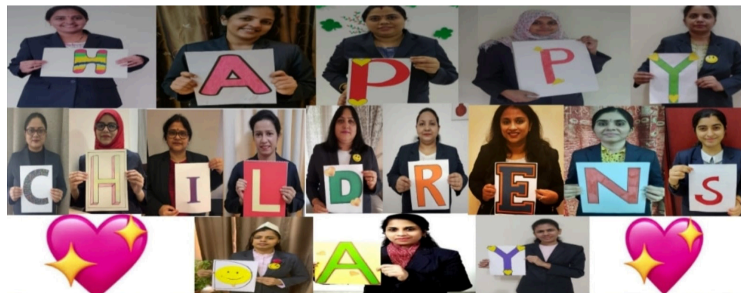
Children taking part in various activities

On this special occasion, the teachers pledged to continuously