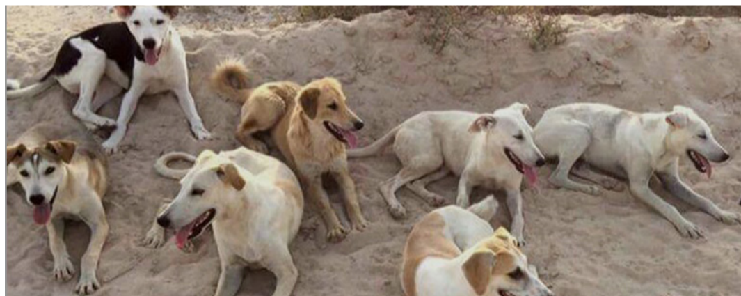
Stray dogs have taken up residence in different areas in the Kingdom, and they multiply!

The stray and abused dogs issue in the Kingdom of Bahrain is a complex one and there are no easy solutions. There are many causes for this problem. The most important