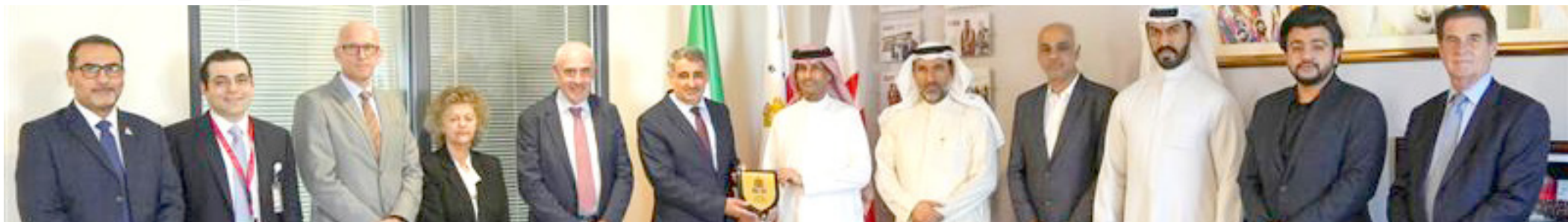
Bahrain Businessmen Association Visit to RCSI Medical University of Bahrain