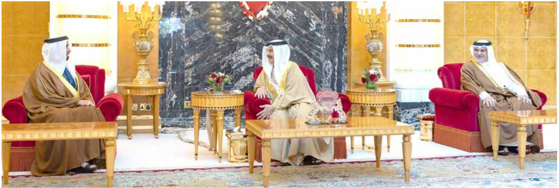
His Majesty King Hamad bin Isa Al Khalifa praised the successful conclusion of the third International Security Alliance joint exercise, hosted by the Kingdom of Bahrain, describing it as a key milestone for regional and global cooperation, security, and stability. The remarks came as HM the King, in the presence of His Royal Highness Prince Salman bin Hamad Al Khalifa, the Crown Prince and Prime Minister, received Lieutenant General His Highness Sheikh Saif bin Zayed Al Nahyan, Deputy Prime Minister and Minister of Interior of the United Arab Emirates, along with his accompanying delegation, at Sakhir Palace. (Detailed report on Page 2)