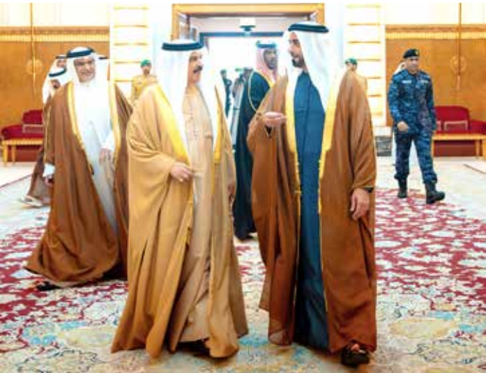
HM the King, in the presence of HRH Prince Salman, receives General His Highness Sheikh Saif bin Zayed Al Nahyan

His Majesty King Hamad bin Isa Al Khalifa highlighted the International Security Alliance’s important role in consolidating cooperation and exchanging expertise to promote security and stability regionally and globally. HM the King, in the presence of His Royal Highness Prince Salman bin Hamad Al Khalifa, the Crown Prince and Prime Minister, was speaking as he received at Sakhir Palace Lieutenant General His Highness Sheikh Saif bin Zayed Al Nahyan, Deputy Prime Minister and Minister of Interior of the UAE, and his accompanying delegation. The visit marked His Highness’s presence in the Kingdom to attend the conclusion of the third International Security Alliance joint exercise. Initiative HM King Hamad commended HH Sheikh Saif bin Zayed’s initiative to establish the International Security Alliance and his efforts in advancing the close ties between the Kingdom of Bahrain and the UAE.