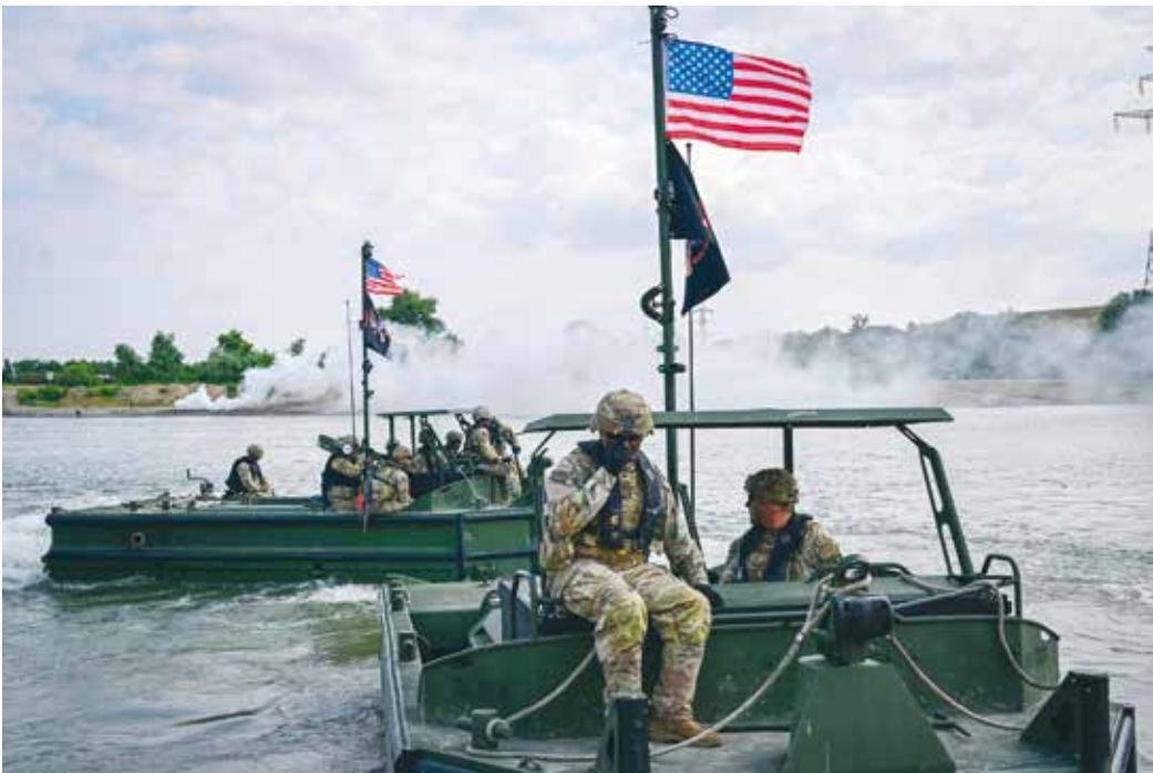
US soldiers operate pusher vessels to be used for assembly and operate a transportation barge across Danube river during SABER GUARDIAN 25 military exercise in Frecatei, eastern Romania