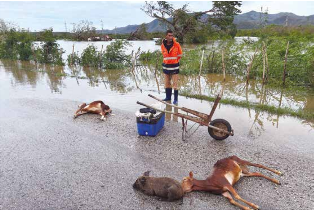
A farmer stands next to some of his drowned animals after Hurricane Melissa hit the town of San Miguel de Parada in Santiago de Cuba province