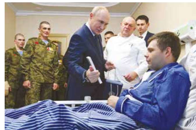
Russia's President Vladimir Putin (C) brings a medal as he visits servicemen who were wounded during the Russian military action in Ukraine, at a military hospital in Moscow

Russian leader said there was "no way to intercept" the drone torpedo