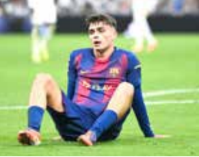
Pedri | Barcelona

Barcelona midfielder Pedri will be sidelined for several weeks with the torn hamstring leg injury he picked up in a 2-1 defeat at Real Madrid this weekend, his club announced.