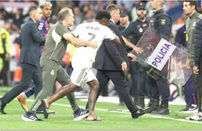
Real Madrid’s Vinicius Junior runs toward the dressing room at the end of the match against Barcelona

Brazilian forward Vinicius has issued a public apology to Real Madrid after his angered reaction to being substituted during a tense 2-1 win over arch-rival Barcelona at the weekend. Vinicius remonstrated with coach Xabi Alonso and marched off down the tunnel after he was hauled off in the 72nd minute and replaced with Rodrygo. Vinicius did not mention the Real Madrid coach in his apology. “Today I want to apologise to all Madrid fans for my reac-