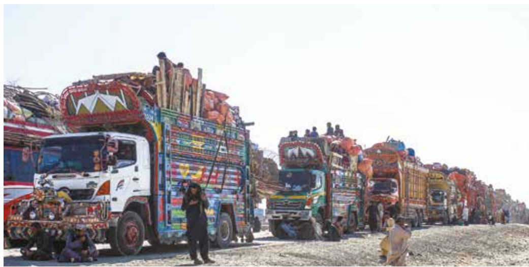
Afghan refugees along with their belongings on trucks await deportation to Afghanistan near the Pakistan-Afghanistan border in Chaman

Tarar said engaged with Afghanistan in the spirit of peace