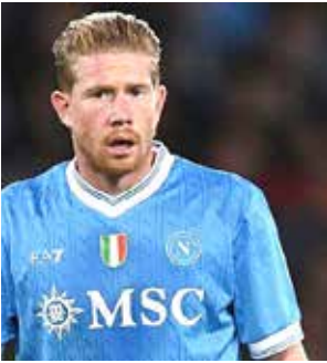
Kevin De Bruyne