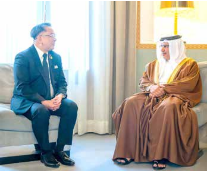
HRH Prince Salman with H.E. Ambassador Sumate Chulajata