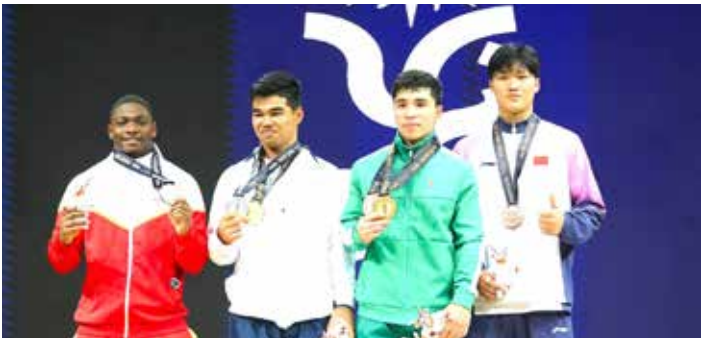
Yesterday's weightlifting medallists