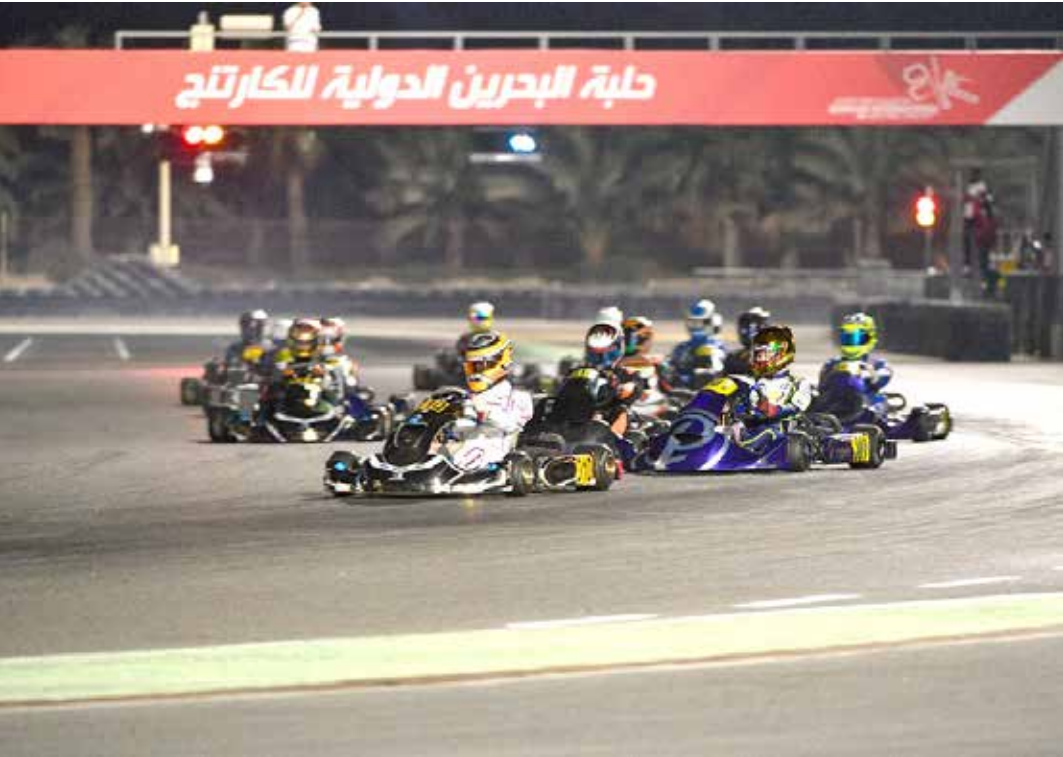
Action from the race

Action on Friday is scheduled to begin at 10.40am with free practices, to be followed by