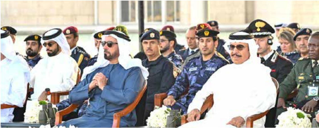
H.E. General Shaikh Rashid bin Abdullah Al Khalifa with distinguished guests at the closing ceremony

Hosted by Bahrain’s Interior Ministry, the three-day exercise concluded yesterday in the pres-