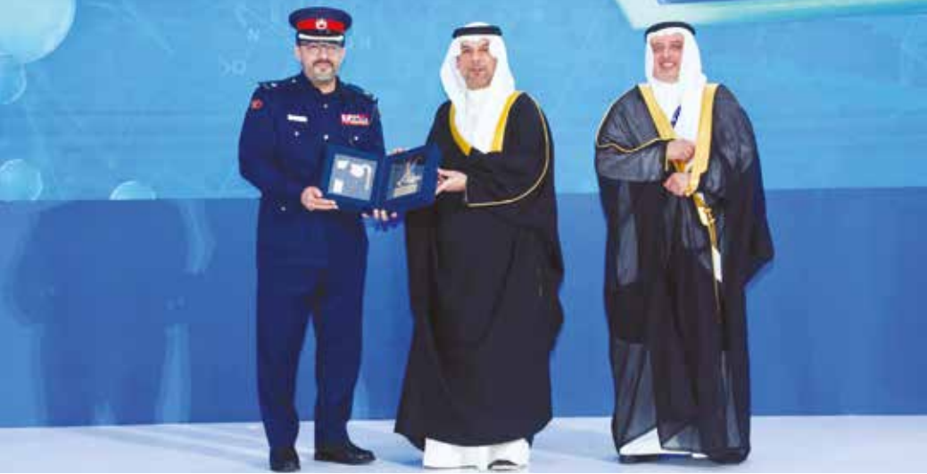
The National Civil Emergency Management Committee (NCEMC), represented by its Executive Office, was recognized as a Strategic Partner at the International Chemical Safety Conference, "ChemSafe 25." The ceremony was attended by H.E. Dr. Mohammed bin Mubarak bin Daina, Minister of Oil and Environment and Special Envoy for Climate Affairs. This recognition underscores NCEMC's pioneering role in promoting public-private sector partnership and expanding cooperation with major companies in chemical safety, reflecting Bahrain's commitment to elevating public safety and environmental sustainability standards in line with international best practices.