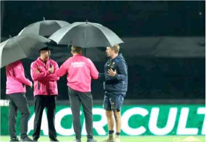
Umpires call off the match as rain interrupts play

Persistent rain forced the opening Twenty20 clash between Australia and India to be abandoned yesterday, leaving Suryakumar Yadav stranded on 39 and Shubman Gill on 37. After being sent in on a chilly Canberra night, the visitors raced to 97-1 off 9.4 overs before being forced off for a second time by the weather with no more play possible. India got off to a solid start with their newest T20 sensation Abhishek Sharma signalling his intent immediately, advancing down the wicket to Josh Hazlewood on his first ball. He clobbered four bounda-