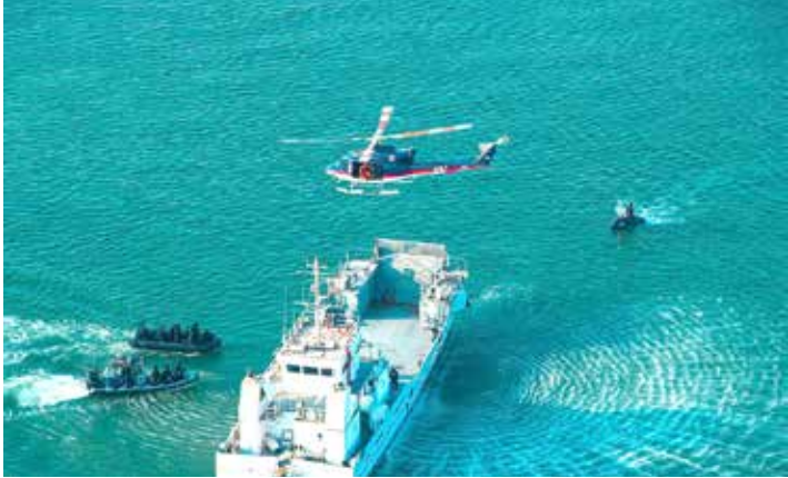
Participants in the joint exercise showcase skill, coordination, and teamwork

He also expressed his gratitude for the UAE’s organisational and technical support, noting its pivotal role in achieving the exercise’s objectives.