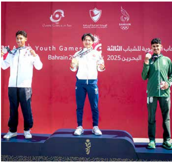
Hong Kong, Thailand, and Saudi Arabia stand on the podium