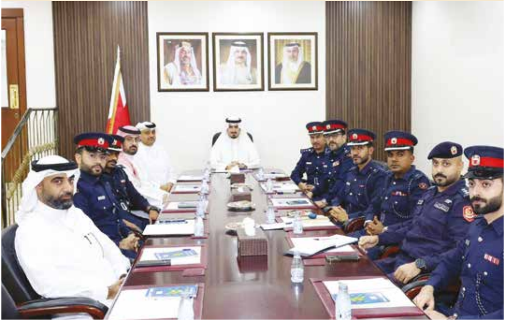
H.E. Sheikh Khalid bin Hamoud Al Khalifa, Capital Governor, chaired the Governorate's Security Committee meeting with representatives from the Ministry of Interior. The meeting focused on bolstering integrated efforts and continuous coordination among security and service agencies to improve field response and public safety. A key topic was the review of urgent rainy season preparations, including securing flood-prone areas and implementing community awareness plans, in coordination with the National Civil Emergency Management Committee (NCEMC).