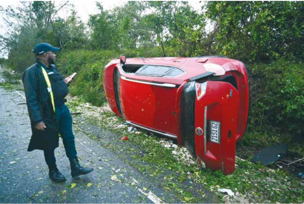
A police officer inspects a car damaged by a fallen tree after the passage of Hurricane Melissa in Manchester, Jamaica,