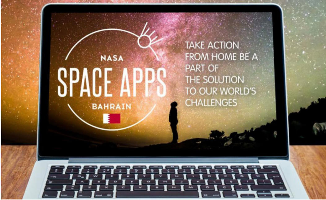
Online registration is available on the space app

The idea of the hackathon is based on motivating participants to invent new ways and ideas through which space data can be usefully presented,