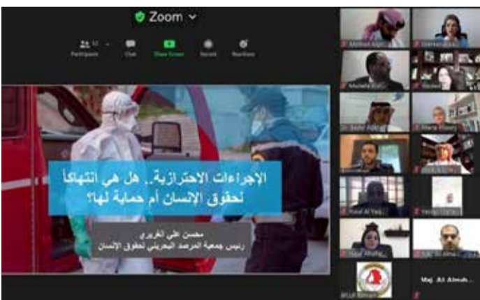
NIHR's virtual presentation

In its virtual presentation entitled "The Bahraini role in protecting expatriate workers' rights during the coronavirus pandemic", the institution discussed its role in protecting the expatriates' rights and the best ways of co-operation between official authorities and relevant civil society entities