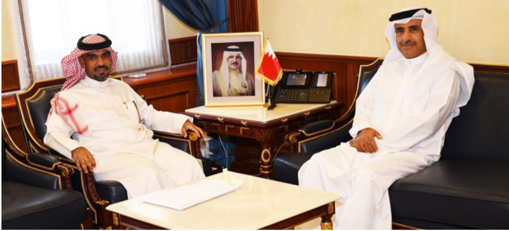
Housing Minister Bassim bin Yaqoob Al Hamar received Representative Abdullah Al Dossari to discuss topics related to the Northern Governorate. The meeting reviewed the ministry's plan to meet the housing waiting list requests, the progress of new cities housing projects and ways to enhance co-operation between the parliament and the ministry for housing programs. Al Dossari expressed his appreciation of the minister's efforts to provide housing units for citizens.