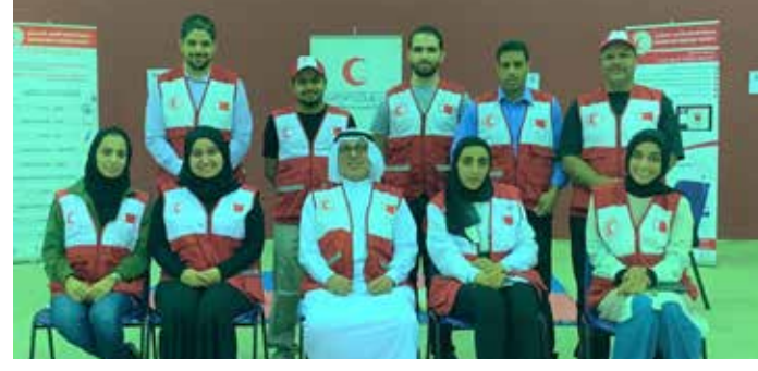
The society's first aid committee

In particular, the courses will discuss ways on how to tackle the deadly respiratory illness and how to respond to infected cases, and most importantly, the necessary precautionary measures to be adopted by in-