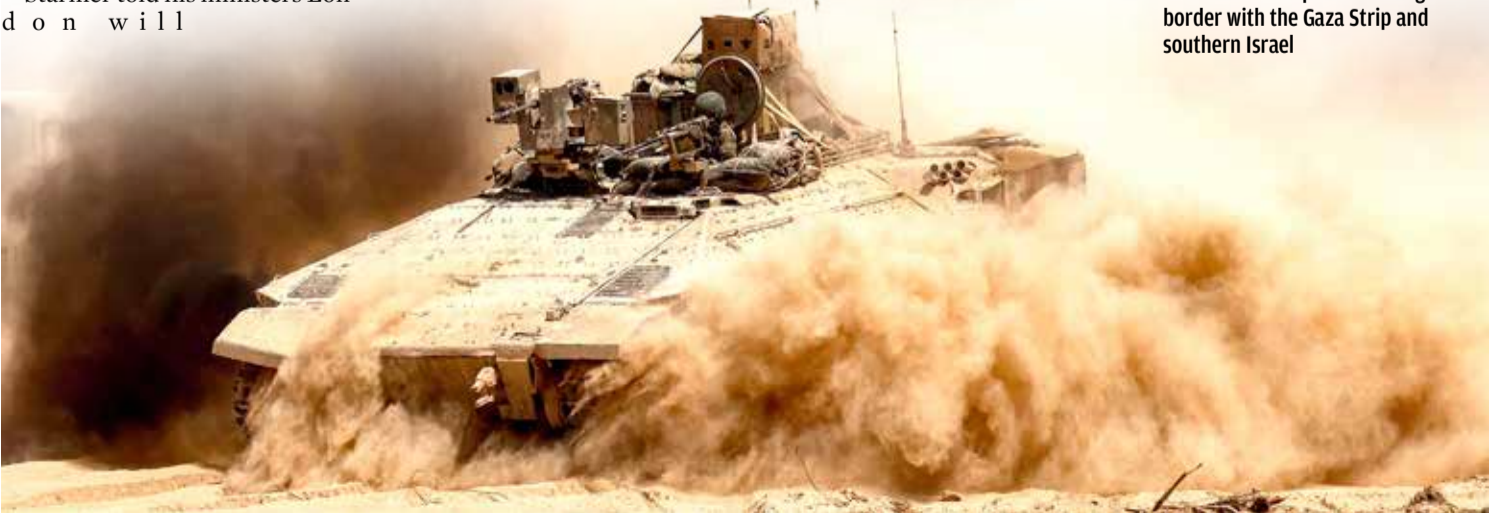
A Israeli army infantry fighting vehicle (IFV) leaves a cloud of dust as it moves at a position along the border with the Gaza Strip and southern Israel

The UK leader added that London "will make an assessment in September on how far the parties have met these steps", adding: "No one should have a veto over our decision."