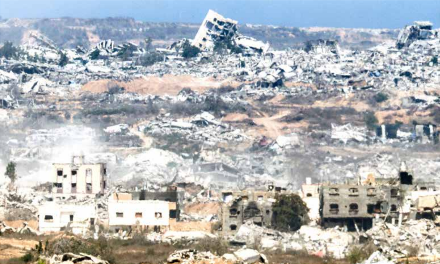
Destroyed buildings are pictured in the Gaza Strip as seen from a position along the border in southern Israel

Alcohol consumption is estimated to cause more than 21 percent of all cases of liver cancer by 2050, up more than two percentage points from 2022.