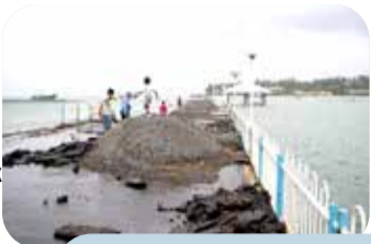
Magnitude 6.5 quake hits India's Nicobar Islands

◆ A magnitude 6.5 earthquake rocked India's Nicobar Islands region early yesterday but did not trigger a tsunami alert, the United States Geological Survey and Tsunami Warning System said. The quake struck at a depth of 10 kilometres (six miles) at 12 minutes past midnight local time (18:42 GMT Monday), 259 kilometers west-northwest of Sabang, in western Indonesia's Aceh province, the USGS said. Aceh was the area most devastated by the magnitude-9.1 earthquake and tsunami that killed more than 220,000 people in 15 countries in 2004.