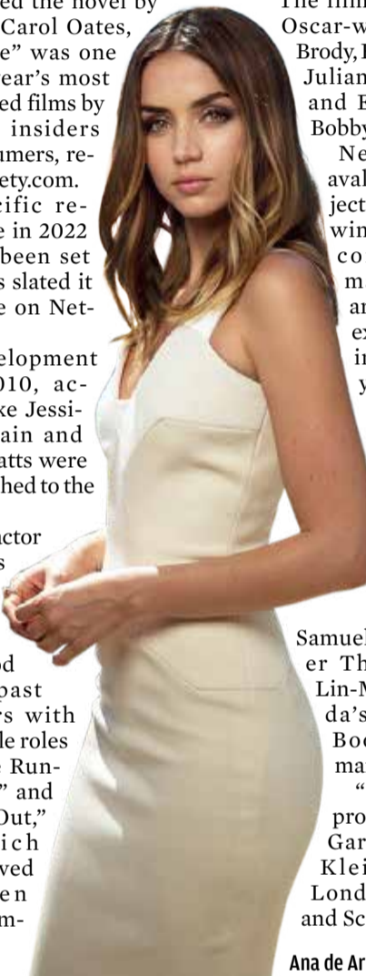
Ana de Armas