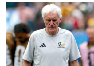
Hugo Broos | Johannesburg

Broos may change decision to quit as South Africa coach