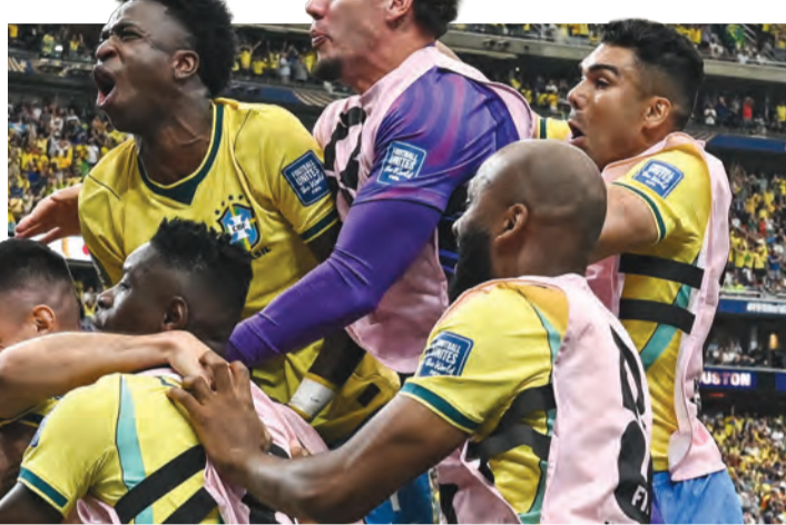
Brazil players celebrate their second goal

and held the Netherlands and Sweden to reach the last 32, had Brazil where they wanted them.