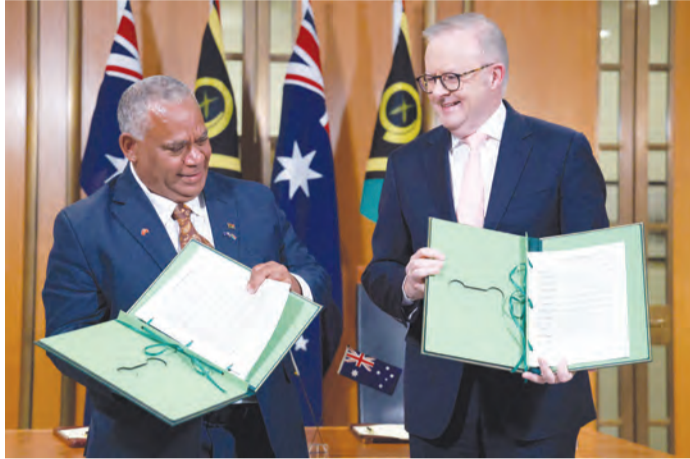
Australian Prime Minister Anthony Albanese (R) and Vanuatu's Prime Minister Jotham Napat display The Nakamal Agreement during a signing ceremony at Parliament House in Canberra