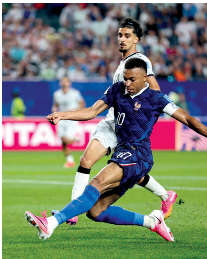
France's Kylian Mbappe shoots during a match (file photo)

At the other end of the draw on Tuesday, Sweden arrive as outsiders after scraping through as one of the best third-placed teams. Graham Potter's side took four points from their group, beating Tunisia, losing 5-1 to