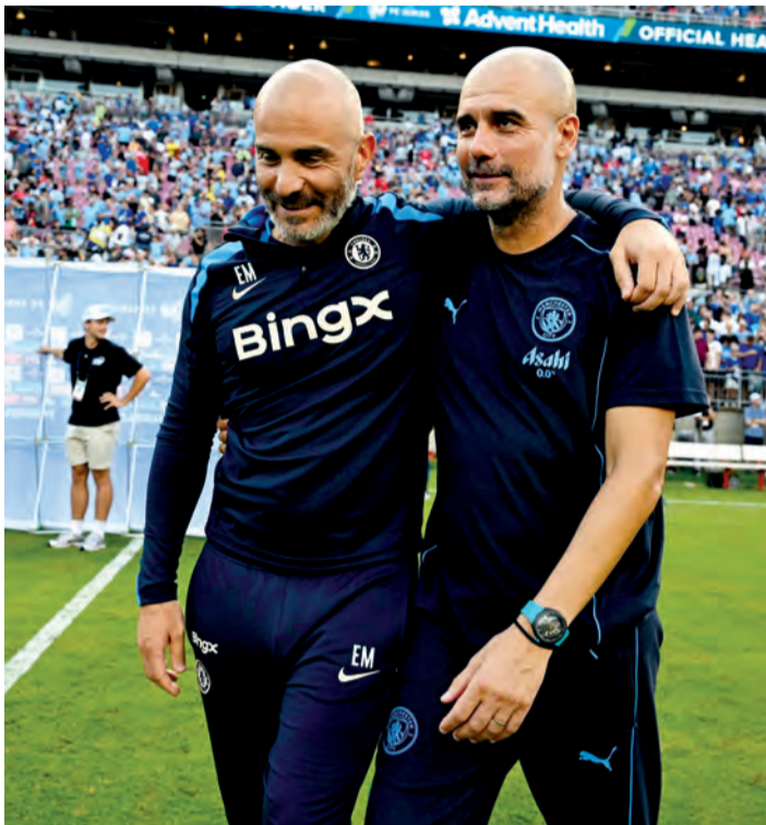
Enzo Maresca and Pep Guardiola react during a match (file photo)

"City is an incredibly well-run football club. Everything they do is innovative, planned and