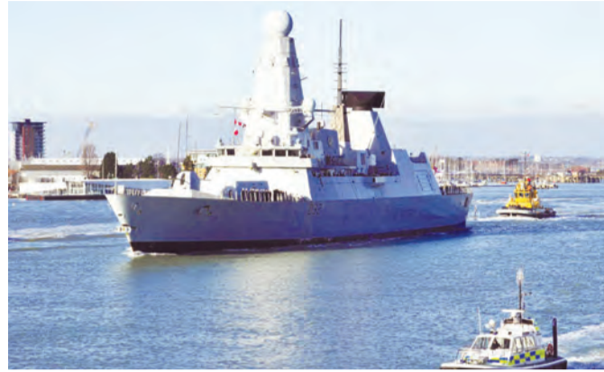
The new British Royal Navy destroyer HMS Daring, the first of the Royal Navy's new Type 45 destroyers, leaves the southern English harbour of Portsmouth