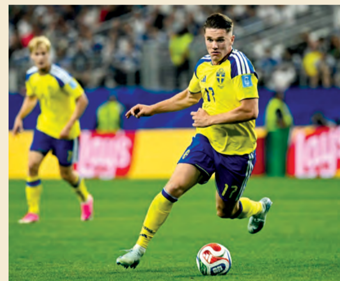
Sweden's forward Viktor Gyokeres controls the ball