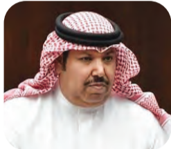
Waleed Al Doseri, MP

Bahraini MPs said parliament had helped protect human rights and public freedoms as they marked the International Day of Parliamentarism on June 30.