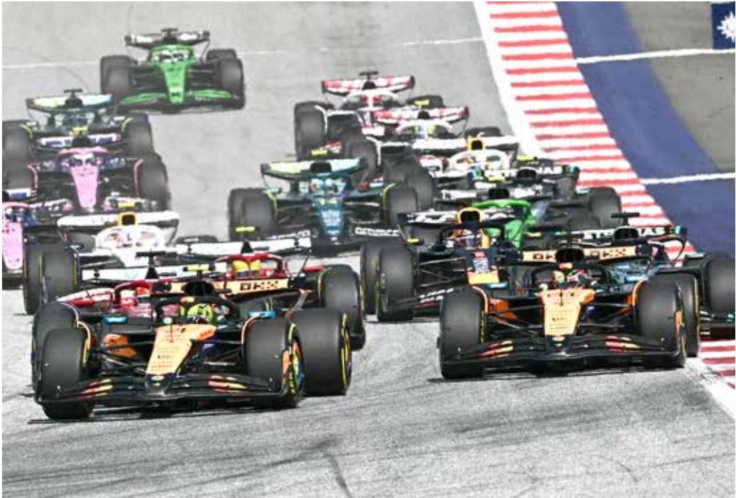
McLaren's British driver Lando Norris (front L) competes to win ahead of McLaren's Australian driver Oscar Piastri (front R)

Charles Leclerc was third ahead of his Ferrari team-mate seven-time champion Lewis Hamilton, their best result of the year, with George Russell