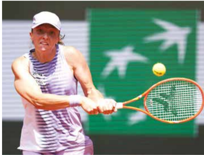
Poland's Iga Swiatek plays a backhand return to Poland's Magda Linette

She overcame a stumble as she tried to close it out, before sealing victory to set up an intriguing match-up with the in-form Marta Kostyuk.