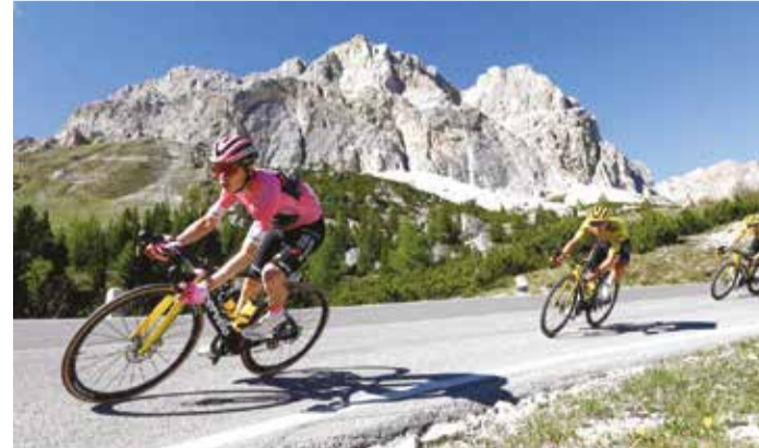
Jonas Vingegaard in action

He then made sure that he stayed close to nearest rival Fe-