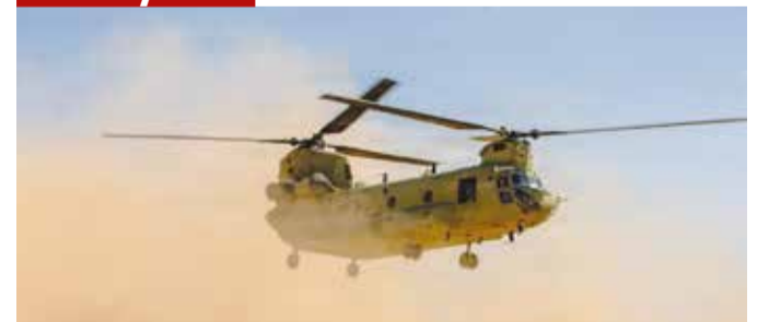
A U.S. Army CH-47 Chinook helicopter lifts off from an airfield in the Middle East for a scheduled flight. The Chinook is both the U.S. Army's fastest and heaviest lift helicopter.