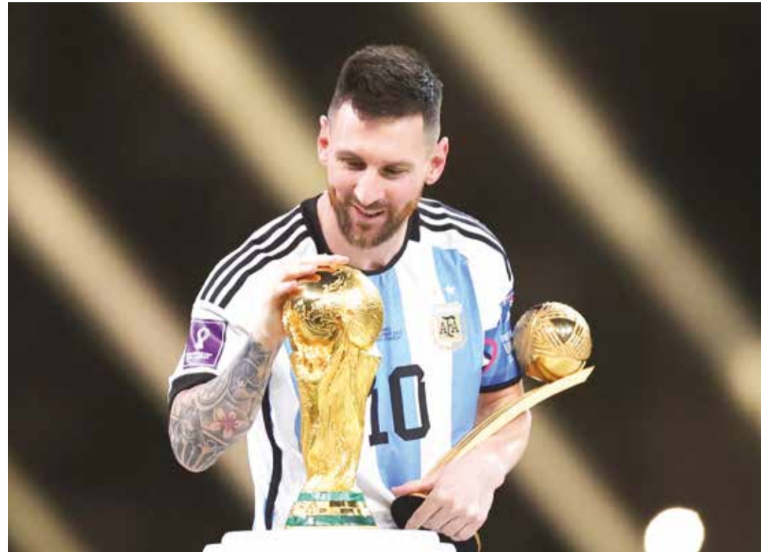
Lionel Messi of Argentina touches the World Cup trophy as he passes it after winning the golden ball award during the awards ceremony after the FIFA World Cup 2022 final

Messi has been at the heart of an injury scare in recent days, with his club side Inter Miami this week saying medical tests diagnosed him