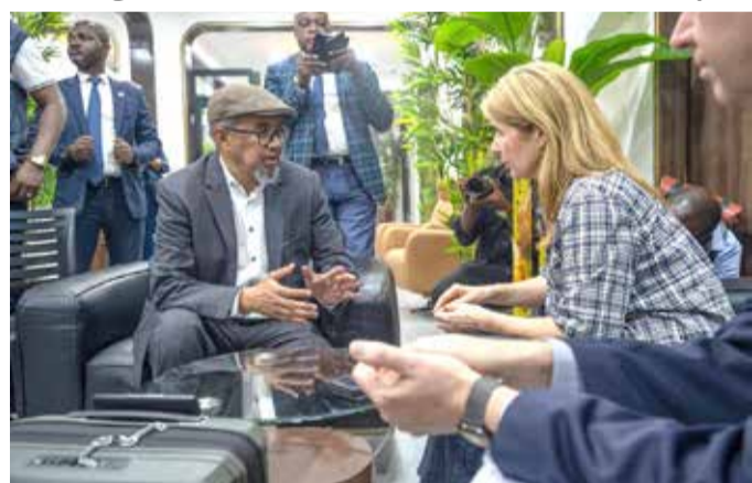
Dr. Tedros Adhanom Ghebreyesus (L), the Director-General of the World Health Organization (WHO), speaks with officials upon his arrival in Kinshasa