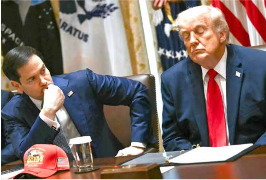
US Secretary of State Marco Rubio and US President Donald Trump listens during a cabinet meeting

"I will be meeting now, in the Situation Room, to make a final