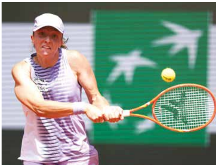
Poland's Iga Swiatek plays a backhand return to Poland's Magda Linette

She overcame a stumble as she tried to close it out, before sealing victory to set up an intriguing match-up with the in-form Marta Kostyuk.