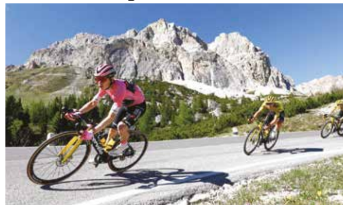
Jonas Vingegaard in action

He then made sure that he stayed close to nearest rival Fe-