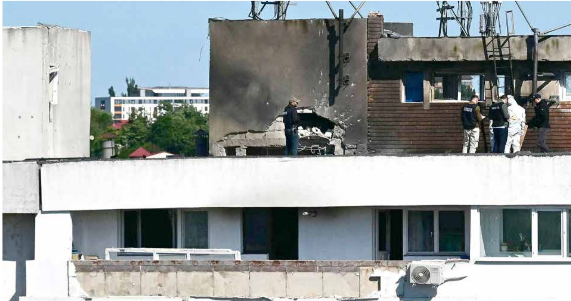
Police and forensic investigators stand on the rooftop as they examine the location of impact (C) over a damaged apartment

The upper floor of the two-storey building, which had 12 cubicles housing 135 bunk beds, was badly damaged, according to police.