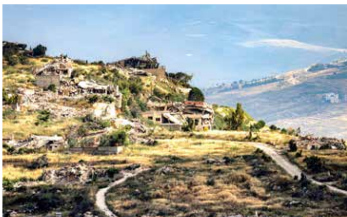
Destroyed buildings are pictured in the village of Odaisseh in southern Lebanon fighting between Israel and the Iran-backed Hezbollah group was supposed to have taken effect on April 17, but has never been observed.

of violating it and justify their attacks by the other's alleged breaches.