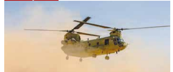
A U.S. Army CH-47 Chinook helicopter lifts off from an airfield in the Middle East for a scheduled flight. The Chinook is both the U.S. Army's fastest and heaviest lift helicopter.