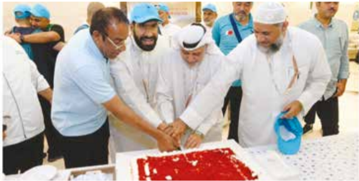
Bahraini pilgrims celebrate the conclusion of their Hajj rituals

Pilgrims began the ritual by throwing pebbles at the small Jamarah, followed by the middle Jamarah, before concluding at Jamarat Al Aqabah, in an atmosphere filled with spirituality and devotion.