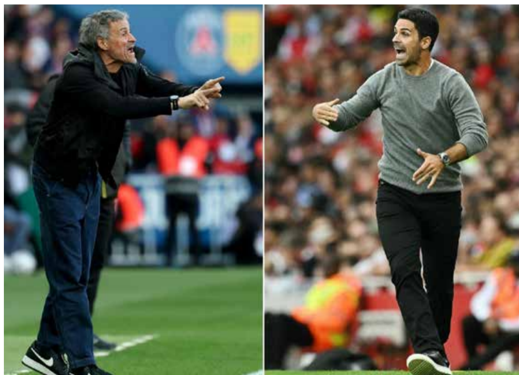
Combination of pictures shows Paris Saint-Germain's Spanish headcoach Luis Enrique (L) giving instructions to his players and Arsenal's Spanish manager Mikel Arteta reacting from the sideline

By contrast Arsenal's team has been slow-cooked over near-