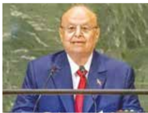
Abdrabbuh Mansur Hadi