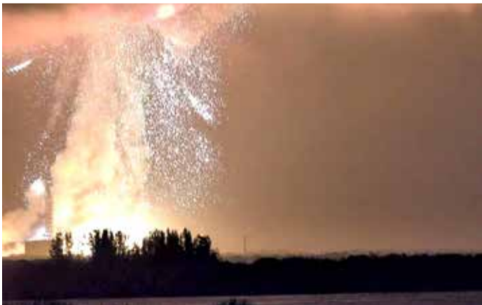
A video grab shows Blue Origin's New Glenn rocket exploding in a massive fireball

"Very rough day, but we'll rebuild whatever needs rebuild-