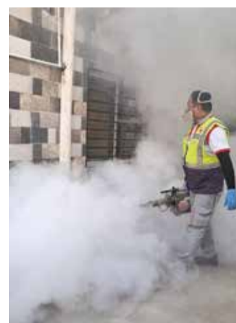
An urgent action to eliminate mosquito breeding grounds

The Ministry of Health said it continues preventive efforts in coordination with municipal authorities through field surveillance and targeted control of mosquito hotspots, particularly during periods of higher humidity and rainfall that increase breeding activity.