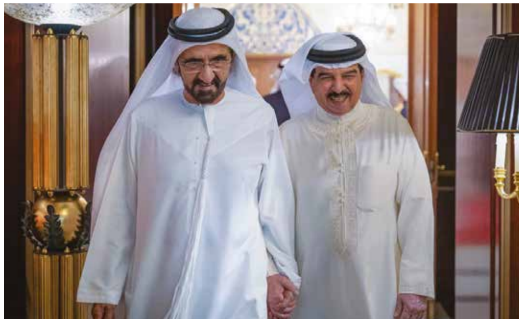
HM the King with Dubai Ruler Shaikh Mohammed bin Rashid Al Maktoum

HM the King also recalled the UAE's longstanding supportive role, emphasising that the strong relationship between the two countries is rooted in a legacy established by previous generations and will continue into the future.