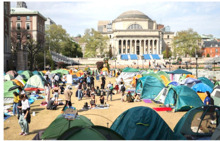
Pro-Palestinian encampment at the Columbia University