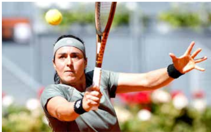
Tunisia’s Ons Jabeur returns a ball to Latvia’s Jelena Ostapenko

But Jabeur, the 2022 Madrid champion, later took a swipe at tournament organisers, telling reporters she believes tennis still has a way to go to achieve gender equality, despite it being the leader in women’s sport.