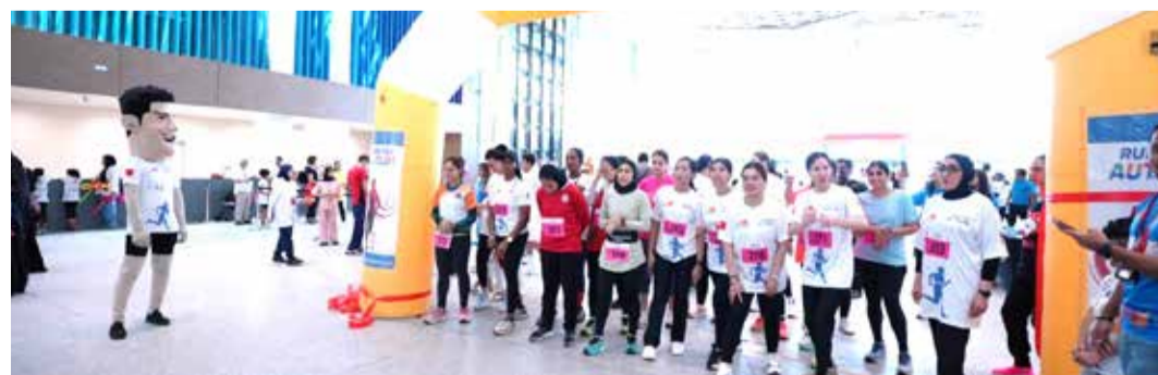
Participants at the charity event

Spanning over 105,000 square metres of total indoor space, the sporting event at EWB has been set to be a memorable and im-