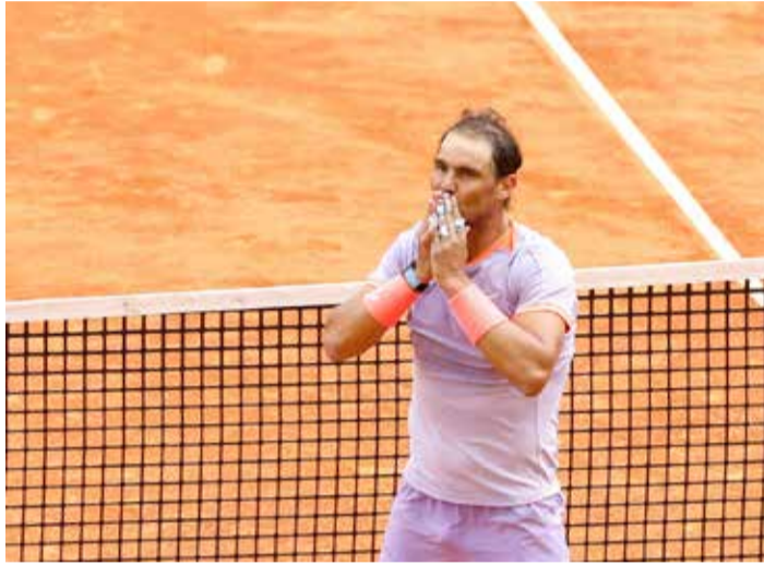
Rafael Nadal salutes the Madrid crowd after beating Pedro Cachin

clash with the 30th-seeded Jiri Lehecka on Tuesday.