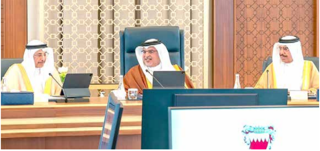
The Cabinet, chaired by His Royal Highness Prince Salman bin Hamad Al Khalifa, the Crown Prince and Prime Minister, yesterday at Gudaibiya Palace, commended local media and journalists, recognising their crucial role in promoting national development and expressing gratitude for their noble contributions to the comprehensive development goals. The King joins the international community in celebrating World Press Freedom Day, which is observed annually on May 3rd.