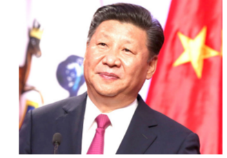
Xi Jinping AFP | Beijing

Chinese President Xi Jinping is due to make a state visit to France on May 6 and 7, Paris announced yesterday, with war in Ukraine and the Middle East expected to be high on the agenda. The visit to France marks the Chinese leader's first European tour since the coronavirus pandemic. "This visit takes place on the occasion of the 60th anniversary of diplomatic relations between the two countries and follows on from the president's visit to Beijing and Guangzhou in April 2023", President Emmanuel Macron's office said in a statement. Xi is expected to visit Paris as well as the department of Hautes-Pyrenees in southwestern France. The Chinese leader will stop in Hungary on May 8-10, the Central European country's government announced last week.