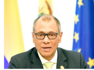
Jorge Glas | Quito

Ecuador yesterday took Mexico to the International Court of Justice (ICJ) for granting asylum to graft-accused former vice president Jorge Glas, who Quito captured in a controversial embassy raid. The South American country filed a case yesterday with the court in The Hague "for Mexico's violations of a series of international obligations" for granting Glas asylum at its embassy in Quito, the foreign ministry said in a statement. Ecuadoran security forces stormed the Mexican embassy on April 5 to arrest Glas, who is wanted on corruption charges dating from his time in office from 2013 to 2017. The rare incursion on diplomatic territory sparked an international outcry and led Mexico to break ties with Ecuador, pulling its diplo-