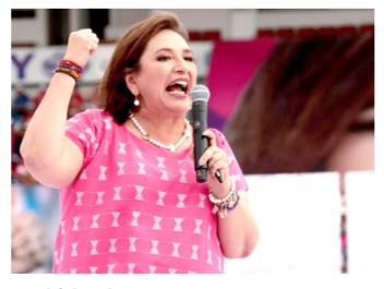
Xochitl Galvez ordinary Mexicans to the forces of poverty and extortion by criminal gangs. There must be "no more hugs for delinquents," said Galvez, 61 -- a reference to left-wing

Mexico's main opposition presidential candidate Xochitl Galvez launched a full-throated attack against frontrunner Claudia Sheinbaum during Sunday's debate as she attempted to reverse her trailing polling numbers. Labeling her opponent a "narco-candidate", center-right former senator Galvez sought to paint the ruling party's candidate as an out-of-touch bureaucrat who has abandoned