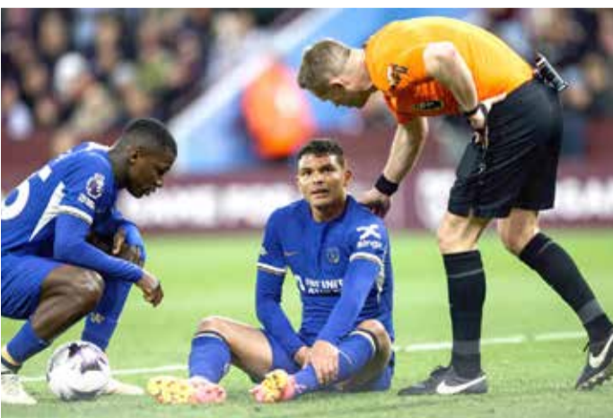
Chelsea's Thiago Silva (C) holds his ankle as he sits injured following a foul

"Chelsea means a lot to me. I came here with the intention