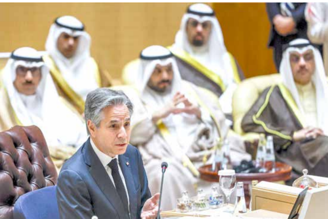
US Secretary of State Antony Blinken attends a Joint Ministerial Meeting of the GCC-US Strategic Partnership in Riyadh.

US Secretary of State Antony Blinken told a World Economic Forum special meeting in Ri-