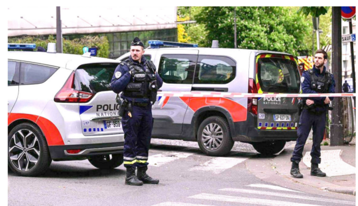
French police officers take part in a security perimeter near the consulate of Iran in Paris (file photo)