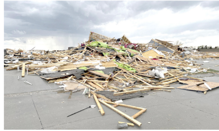
Debris from a destroyed home northwest of Omaha after a storm tore through the area

An exceptional number of tornadoes have ravaged parts of Oklahoma and nearby Great Plains states, leaving at least five dead, authorities and local media said. After 78 tornadoes were reported Friday, mostly in Nebraska and Iowa, a separate weather system Saturday brought 35 tornado reports from northern Texas and Oklahoma to Missouri, the National Weather Service (NWS) said. The storms dumped up to seven inches (18 centimeters) of rain in some places within hours, and meteorologists warned of a continuing danger of extreme weather Sunday, including flash flooding, hail and more tornadoes. A postal truck sat precariously