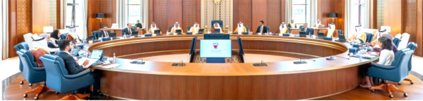
HRH the Crown Prince and Prime Minister chairs the weekly Cabinet meeting at Gudaibiya Palace

Chaired yesterday by His Royal Highness Prince Salman bin Hamad Al Khalifa, the Crown Prince and Prime Minister, the Cabinet affirmed the importance of His Majesty King Hamad bin