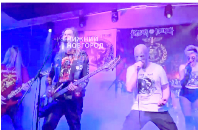
Members of the band during the concert AFP | Moscow

Three members of a well-known Russian metal band were arrested in the middle of a concert and charged with displaying "Nazi symbols", authorities said. The members of Korrozija Metalla, aged 19, 42 and 57, have been accused of "propaganda or public display of Nazi accessories or symbols", said regional police in the western city of Nizhny Novgorod following the arrests late Saturday. "Police officers with the support of the national guard arrested three members of a music band in one of Nizhny Novgorod's clubs," police added in a statement. The offence is usually punishable by a fine or a short