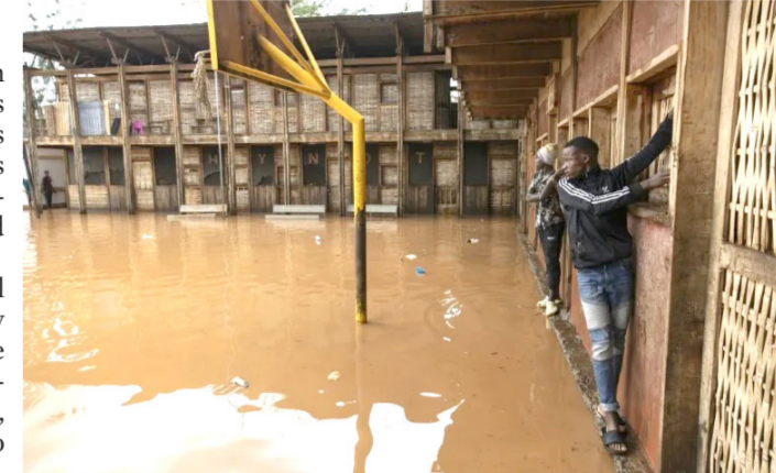
Residents of Mathare slum use the wall to cross a flooded school field

At least 45 people died when a makeshift dam burst its banks near a town in Kenya's Rift Valley in the early hours of yesterday, police said, as torrential rains and floods battered the country. The disaster raises the total death toll over the March-May wet season in Kenya to more than 120 as heavier than usual rainfall pounds East Africa, compounded by the El Nino weather pattern. Residents said the accident occurred in the dead of night near Mai Mahiu, in Nakuru county, sending water gushing down a hill and engulfing everything in its path. The deluge cut off a road, uprooted trees, washed away homes and sent vehicles flying. "We heard what sounded like an earthquake and roars like a moving train," said Margaret Wangechi, a 52-year-old teacher. A senior officer at Nakuru County police headquarters told AFP by phone that 45 bodies had been recovered so far, while Nakuru governor Susan Kihika said 110 people were being treated in hospital. Rescuers were digging through the debris, using hoses and in some cases just their bare hands in a desperate search for survivors. "We collected some of the bodies held by trees and we don't know how many are under the mud," Stephen Njihia Njoroge, a local resident in-