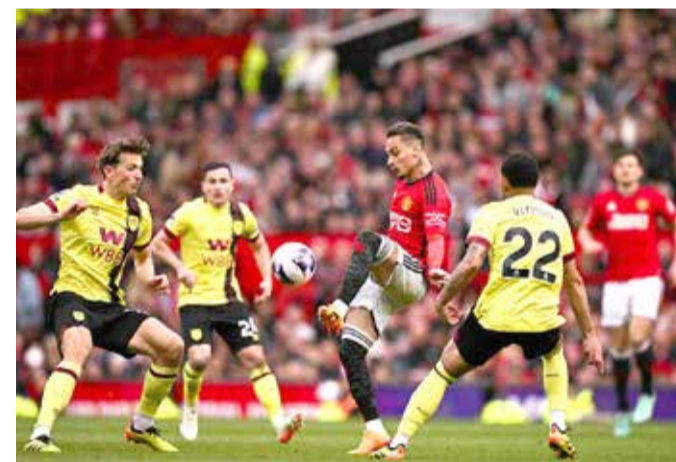
Manchester United's Antony (C) controls the ball during a match (file photo) AFP | London

Manchester United winger Antony says criticism of his spluttering form this season is fuelling his desire to prove his worth at Old Trafford.