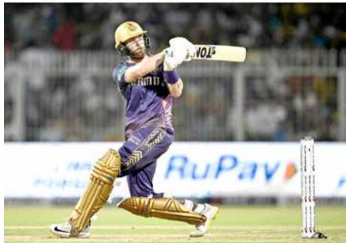
Phil Salt plays a shot

The in-form Salt, an England wicketkeeper-batsman, led the chase with an opening stand of