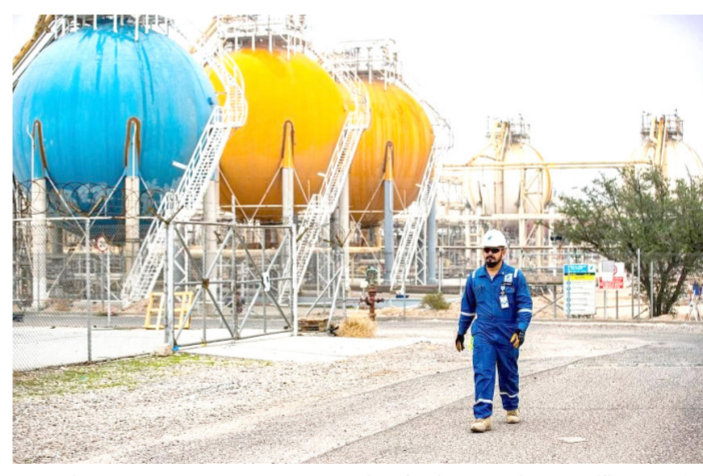
An engineer walks past tanks at the gas liquefaction plant in Basra (file photo)

Emirati-owned Dana Gas has suspended operations at a gas complex in Iraq's autonomous Kurdistan region after a drone strike that killed four people, it said yesterday. The Khor Mor complex owned by the United Arab Emirates firm has been hit several times in recent years, but Friday's attack was the first deadly incident. Four workers died and eight others were wounded when the drone struck a condensate storage tank, Dana Gas said in a statement to the Abu Dhabi Securities Exchange. "Although there was very mi-