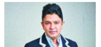
Bhushan Kumar Mumbai

T-series honcho Bhushan Kumar has pledged to donate Rs 11 crore to Prime Minister Narendra Modi's initiative PM CARES Fund and Rs 1 crore to the Chief Ministers Relief Fund, Maharashtra to lend support to the ongoing battle against the coronavirus pandemic.