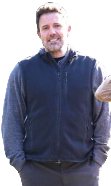
Ben Affleck and Ana de Armas

The actress wore red wine-coloured velvet jacket, fitted jeans and white sneakers. As for the actor, he also kept things chic but low-key with a charcoal coloured coat, denim pants, grey sneakers and a baseball cap.