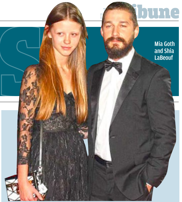
Mia Goth and Shia LaBeouf