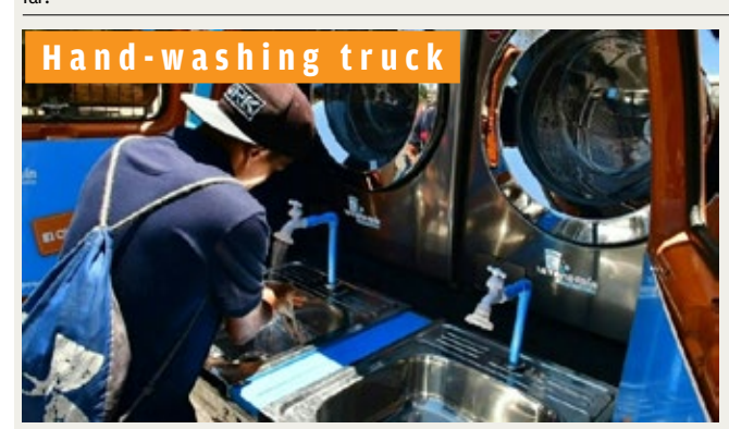
An NGO in Costa Rica transformed a van into a hand washing station, as part of an effort in conjunction with the local government to limit the spread of COVID-19 and promote sanitary measures.