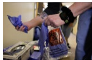
An epidemiologist holds gloves