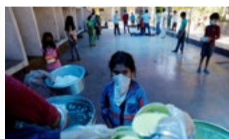
A child wearing a mask waits to receive free food being distributed by Delhi government in a school

The government announced a $22.6 billion economic stim-