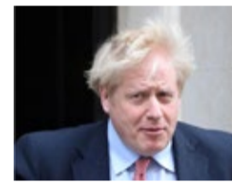
Britain's Prime Minister Boris Johnson

get worse before they get better," Johnson writes. "At this moment of national emergency, I urge you, please, to stay at home, protect the NHS and save lives."