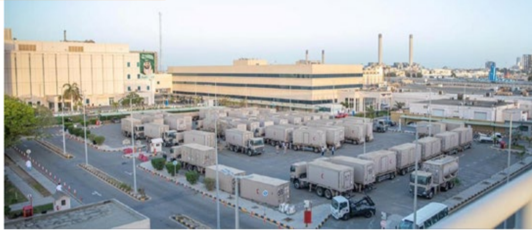
Medical vehicles to be used as field hospital, are seen at the parking of the King Fahad Medical City, amid fear of the outbreak of coronavirus (COVID-19), in Jeddah, Saudi Arabia