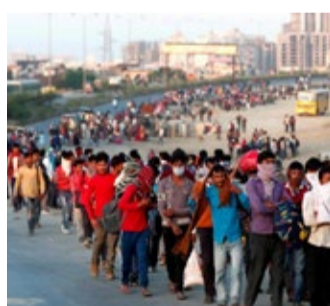
Migrant workers walk towards a bus station in Ghaziabad

ulus plan on Thursday to provide direct cash transfers and food handouts to India's poor.