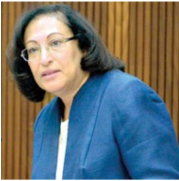
Minister Al Saleh

Complex (SMC) receives the complaint and addresses the concerned authority to resolve it in an optimal way and as quickly as possible," said Minister Al Saleh in her reply. "The Office also implements solutions to deal with patients'