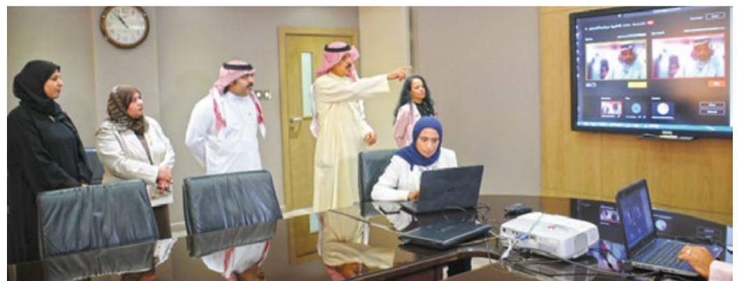
Minister Al Nuaimi, standing second from right, with other officials at the launch