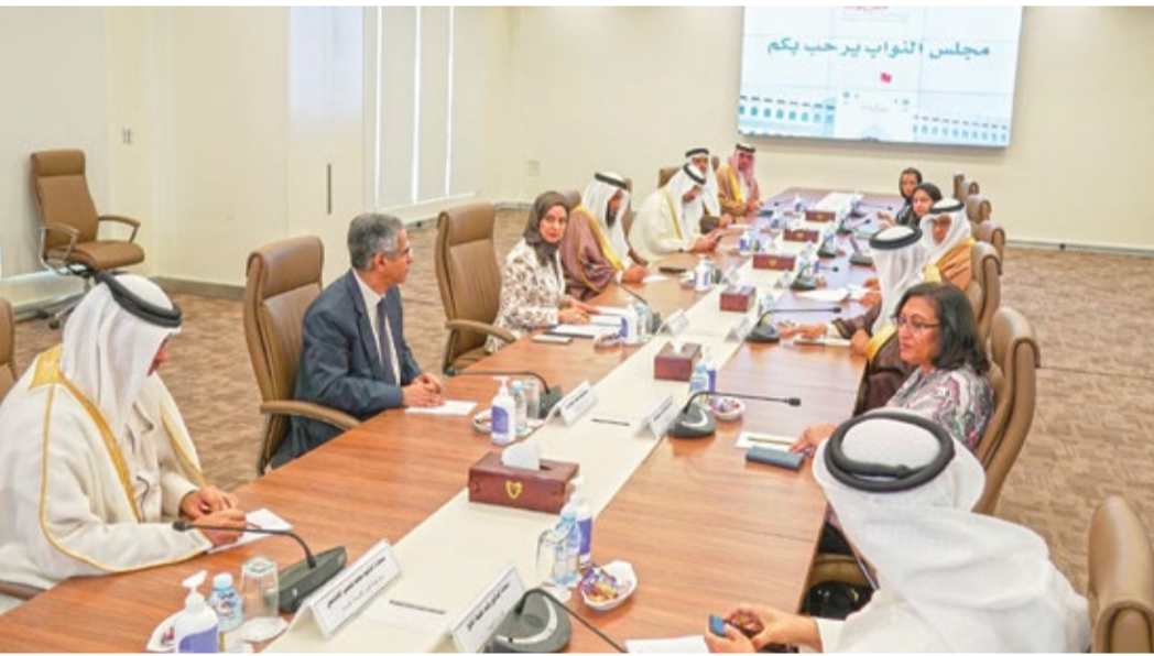
Officials at the meeting

Top government officials spoke out yesterday against the "irresponsible" measures taken by Qatari authorities towards Bahraini travellers, as the Kingdom steps up its repatriation of citizens stranded abroad due to the outbreak of