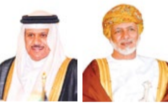
Minister Al Zayani Abdullah

They discussed cooperation between both countries in fac-