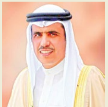
Minister Al Romaihi

The Information Minister pointed out that the discontent of many Qatari nation-