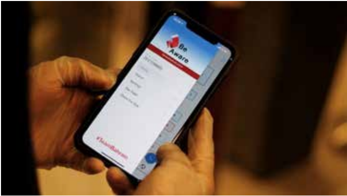
BeAware Bahrain is a mobile application against the COVID-19

targeting the online banking and financial transaction network in the Kingdom.