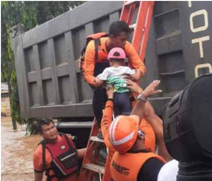
A rescue worker holds a child while helping people affected by floods, in Plaridel, Misamis Occidental Province, Philippines