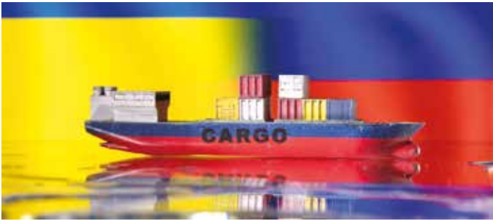
A cargo ship boat model is pictured in front of Ukraine's and Russian's flags

Ship insurers said they are cancelling war risk cover across Russia, Ukraine and Belarus, following an exit from the region by reinsurers in the face of steep losses. Reinsurers, who insure the insurers, typically renew their 12-month contracts with insurance clients on Jan. 1, giving them the first opportunity to scale back exposure since the war in Ukraine started, after being hit this year by losses related to the conflict and from Hurricane Ian in Florida. P&I (protection and indemnity) clubs American, North, UK and West are no longer able to offer war risk cover for liabilities in the region from Jan. 1, they said in recent notices on their websites. The clubs are among the biggest P&I insurers who cover around 90% of the