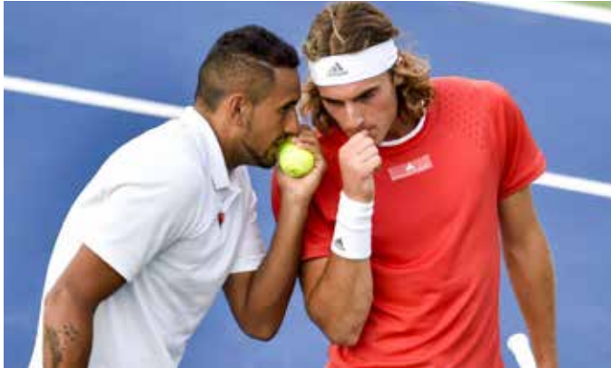
Nick Kyrgios and Stefanos Tsitsipas discuss during a match (file photo)