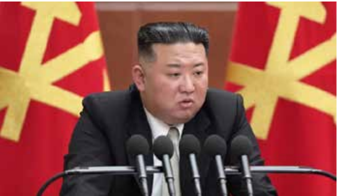
North Korean leader Kim Jong Un attends the sixth enlarged meeting of the eighth Central Committee of the Workers’ Party in Pyongyang, North Korea