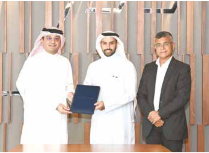
Officials after the announcement