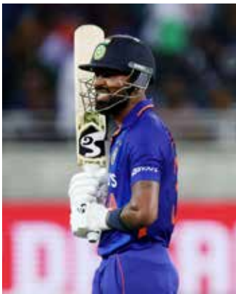
India’s Hardik Pandya reacts during a match (file photo)

India will host Sri Lanka for three T20Is and three ODIs from Jan. 3, with Pandya reprising his role as T20 captain for a second straight series, after leading India to victory over New Zealand