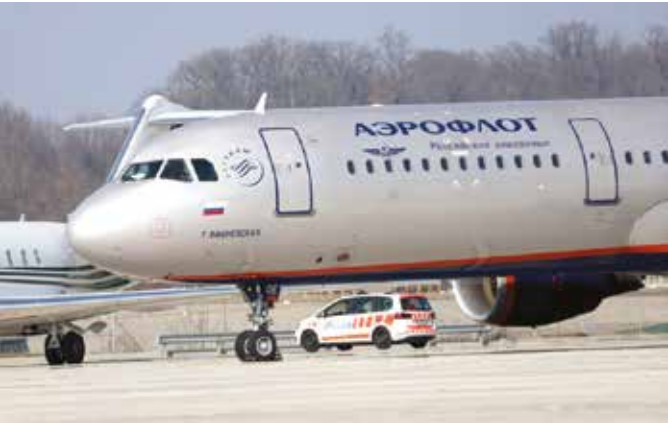
A police vehicle drives behind an Airbus A321-211 aircraft of Russian airline Aeroflot with registration VP-BOE on a long term parking at Cointrin airport in Geneva, Switzerland