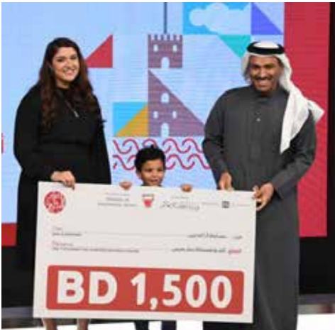
One of the competition winners

Dr Al Noaimi honoured the two golden sponsors of the competition, the National Bank of Bahrain