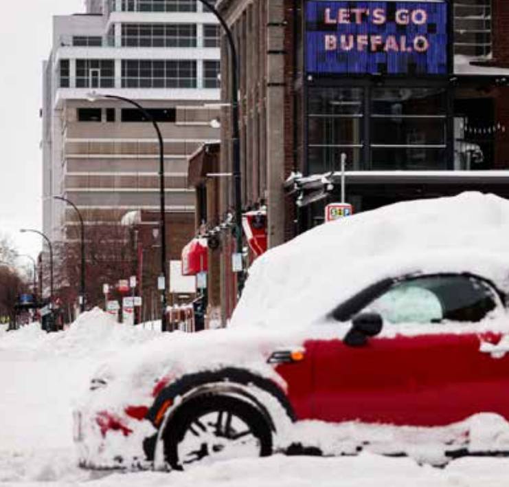
A “let’s go Buffalo” sign is seen behind an abandoned car on the road following a winter weary road crews and residents of western New York state struggled on Tuesday to dig snow still falling and forecasts for rapid warming and rains that could cause flooding. The region in and around Buffalo, New York, downwind of Lake Erie and Lake Ontario, is hit by a freeze and massive winter storm that extended over most of the United States last week far south as the Mexican border.

“We are urgently seeking further information from the Iranian authorities on the reports of those British-Iranian dual nationals” BRITISH PRIME MINISTER RISHI SUNAK’S SPOKESPERSON T nationals.” The reported arrests follow unrest triggered by the Sept. 16 death in detention of Mahsa Amini, a 22-year-old Kurdish Iranian who was arrested for wearing “inappropriate attire” under Iran’s strict Islamic dress code for women. The protests have posed one of the biggest challenges to the Shi’ite Muslim-ruled Islamic Republic since the 1979 revolution.