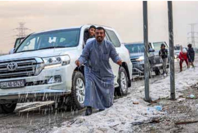
Pictures and videos of southern roads partially blanketed in wintry white spread online to celebrate the rare weather event

Kuwait, one of the hottest Kcountries on Earth, has been hit by a rare hail storm that delighted children and their parents, with images of the winter white shared widely on social media yesterday. “We have not seen so much hail during the winter season in 15 years,” Muhammad Karam, a former director of Kuwait’s me- teorological department, said. Pictures and videos of south- ern roads partially blanketed in hail and ice spread online to celebrate the rare weather event. Children donned scarves and raincoats as they scooped up hail in the Umm al-Haiman dis- trict, about 50 kilometres (30 miles) south of Kuwait City. Kuwait’s meteorological de- partment said precipitation since Tuesday had reached up to 63 millimetres but that the weather was clearing up. Karam said he expects the phenomenon to reoccur as cli- mate change disrupts weather patterns. The oil-rich Gulf na-