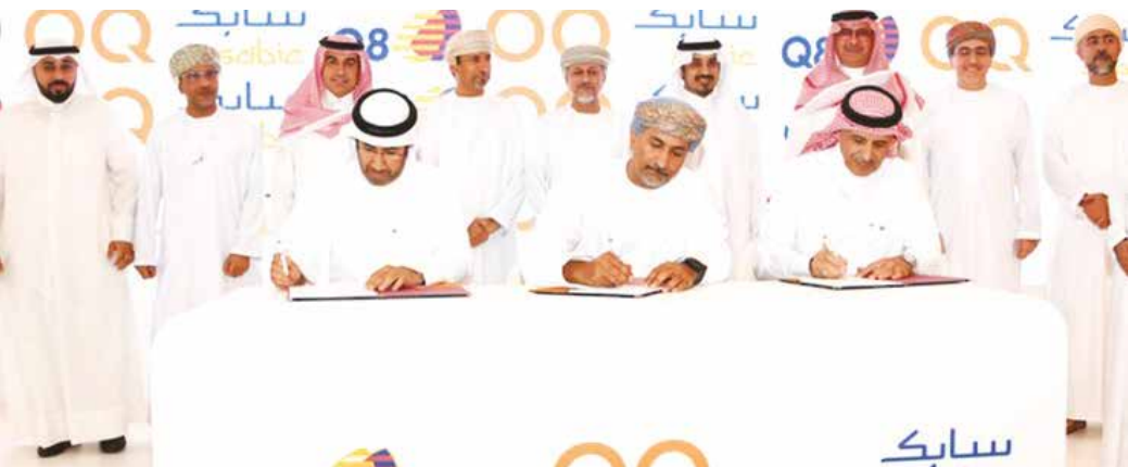
The deal signing

Omani OQ, Saudi SABIC and Kuwait Petroleum International (KPI) have signed a Project Development Agreement of a jointly owned petrochemical complex in the Special Economic Zone at Duqm (SEZAD), the Sultanate of Oman. The three companies aim to establish a petrochemical complex consisting of a steam cracker and derivative units and a natural gas liquid (NGL)