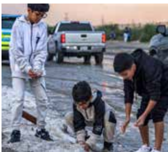
Children toss handfuls of hail after a winter storm

tion endures blistering summer heat, and scientists predict it could become unlivable in fu- ture because of climate change. In 2016, summer tempera- tures peaked at 54 degrees Cel- sius (129 degrees Fahrenheit). Parts of Kuwait could get 4.5 degrees Celsius hotter from 2071 to 2100 compared with the historical average, the En- vironment Public Authority has warned.