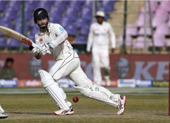
New Zealand’s Kane Williamson plays a shot

“It has started to take turn from the (bowlers’) footmarks and it’s obviously not going to get any easier to bat on. Hopefully from the position we are in, we get as many wickets as possible and put Pakistan under pressure