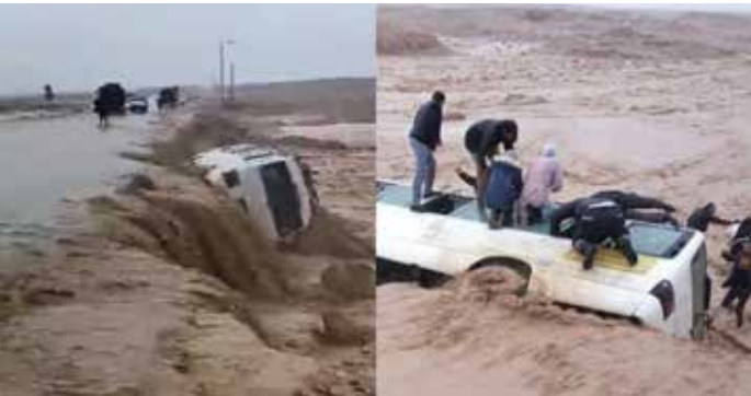
Screen grabs from a video circulating online shows rescuers in action on a bus caught in the flash flood

In Jordan’s Petra thousands of visitors had to be evacuated from a famed archaeological site as heavy rains triggered flooding at the UNESCO World Heritage Site. Amman Net reported that the evacuations were done to ensure the safety of the visitors. Reportedly due to the heavy rains water from surrounding mountains poured down into the city located in the south of the kingdom. As per estimates circulating on social media websites close to 1,700 have been evacuated. Official sources as per Jordan News said that an inci- dent involving a bus that was