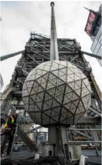
A worker stands next to the Waterford Crystal triangles featuring this year’s “Gift of Love” design on the Times Square New Year’s Eve Ball on the roof of One Times Square in Manhattan, New York City, US