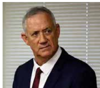
Outgoing Israel Defense Minister

Israel is becoming increasingly concerned that Russia's growing dependence on Iran's military potential in Ukraine