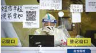
China late Monday scrapped quarantine for inbound travellers from January 8 onwards

Beijing's sudden pivot away from containing Covid-19 has caused jitters around the world, with the United States saying it may restrict travel from China following its decision to end mandatory quarantine for overseas arrivals.