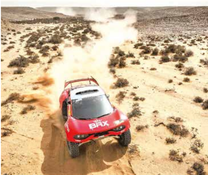
Sebastien Loeb in action