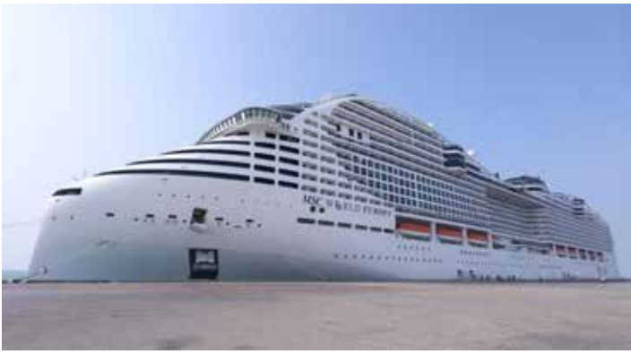
The “MSC World Europa” is one of the most modern cruise fleets in the world

It boasts onboard experience as well as a diverse range of facilities such as Balinese spas, adult-only pools, and 4D cinemas. Its fleet ships can carry between 1984 and 6300 passengers at a time.