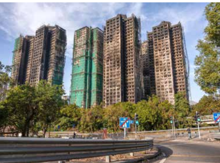
A general view shows the aftermath of a major fire that swept through several apartment blocks at the Wang Fuk Court residential estate in Hong Kong

Flames moved quickly through the Wang Fuk Court housing estate in Tai Po district on Wednesday afternoon, spreading through seven of the eight high-rises and transforming the densely packed complex into an inferno.