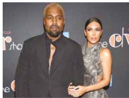
Kanye West and Kim Kardashian

Speaking on Thursday's episode of 'The Kardashians', she said: "Kanye tends to not care about his stuff and gives it all away. Kanye knows that I'm so protective of his stuff for the kids. even now when he was at the height of not speaking to me and being angry with me, he won a few Grammys and I still reached out, and was like, 'I know you just won a few Grammys. I gotta add them to the