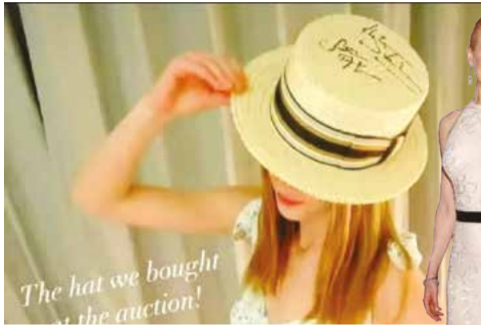
A photo of the hat shared by Nicole Kidman returned to her seat.

After successfully winning Hugh's piece of costume, Nicole walked up to the stage to collect the item and modelled it as she