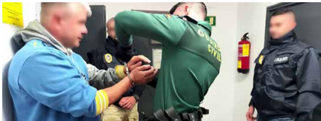
Police arrested 49 suspects, including accused drug lords.

"The scale of cocaine importation into Europe under the suspects' control and command was massive and over 30 tonnes