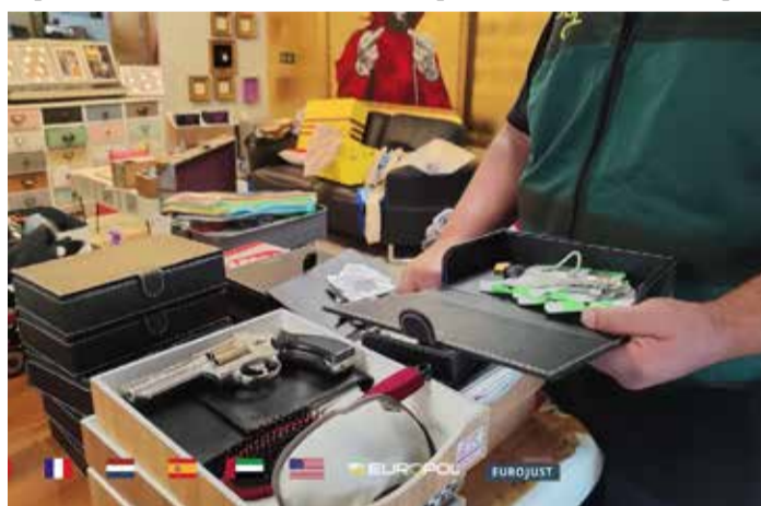
The cartel was also involved in money laundering, according to Europol, which coordinated the operation

"One of the Dutch suspects is an extremely big fish," a Europol source said on condition