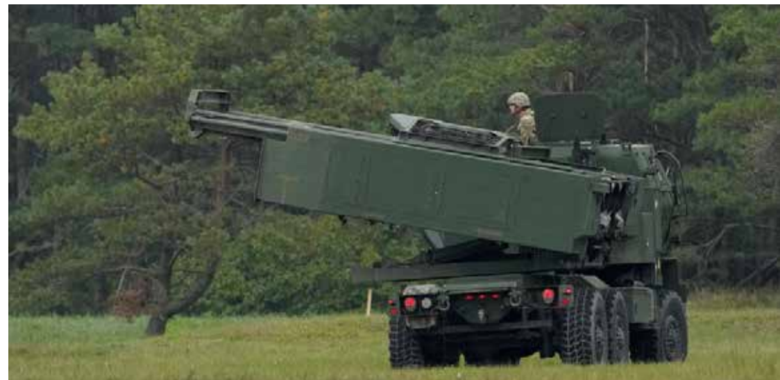
A M142 High Mobility Artillery Rocket System (HIMARS) takes part in a military exercise near Liepaja, Latvia

US and allied military inventories are shrinking, and Ukraine faces an increasing need for more sophisticated weapons as the war drags on. Boeing's proposed system, dubbed Ground-Launched Small Diameter Bomb (GLSDB), is one of about a half-dozen plans for getting new munitions into production for Ukraine and America's Eastern European al-