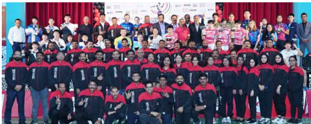
Organisers and winners of the tournament pose for a group photo