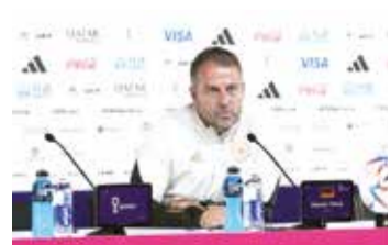
Germany's head coach Hansi Flick attends a news conference

FIFA said it opened a case against the German soccer fed-