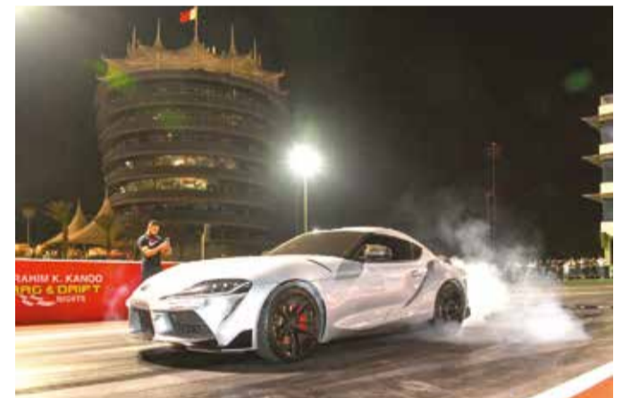
A car in action at BIC