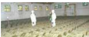
A 2000 file photo shows two Russian soldiers at a chemical weapons storage site