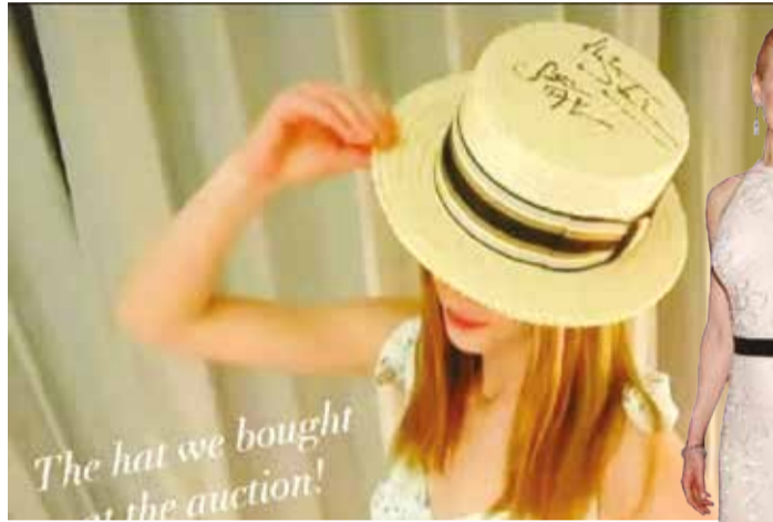
A photo of the hat shared by Nicole Kidman returned to her seat.

After successfully winning Hugh's piece of costume, Nicole walked up to the stage to collect the item and modelled it as she