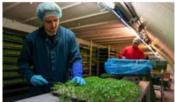
An employee harvests herbs and micro-greens that are grown in a disused World War Two bunker using hydroponic technology and LED lighting, powered by renewable energy, in London, Britain

emissions by air or from a long journey.