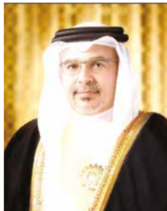
HRH Prince Salman

Fikra has produced an array of creative ideas which have contributed to furthering excellence across government services benefiting the Kingdom's citizens in line with Bahrain Economic Vision 2030.