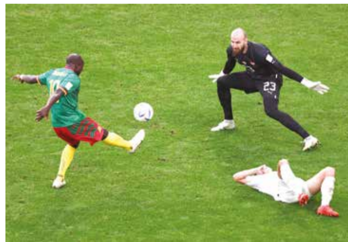
Cameroon's Vincent Aboubakar scores their second goal

Had they lost, Cameroon would have been relying on the Swiss beating Brazil in order to not be eliminated with a game to spare, but instead the west Africans still have a chance of getting out of the group stage for the first time since 1990.