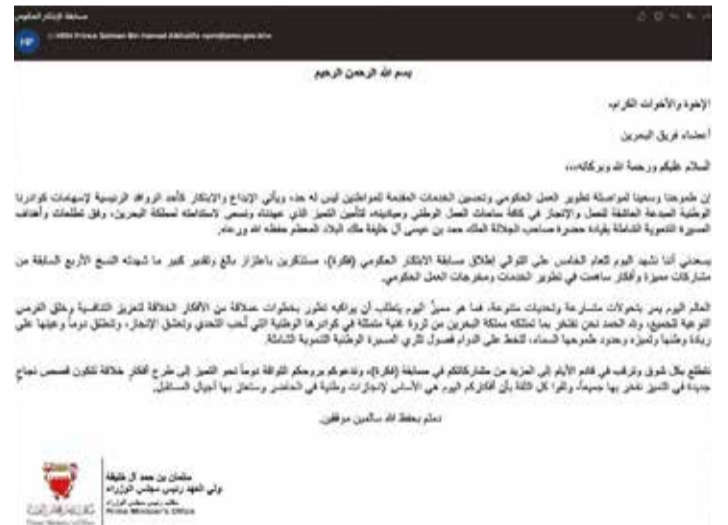
HRH Prince Salman's email

On Sunday, the Prime Minister's Office (PMO) started receiving submissions for the fifth