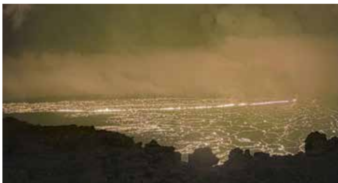
The summit caldera of Hawaii's Mauna Loa volcano

The lava is contained within the summit and does not threaten Hawaiians living downslope for now, the US Geological Ser-