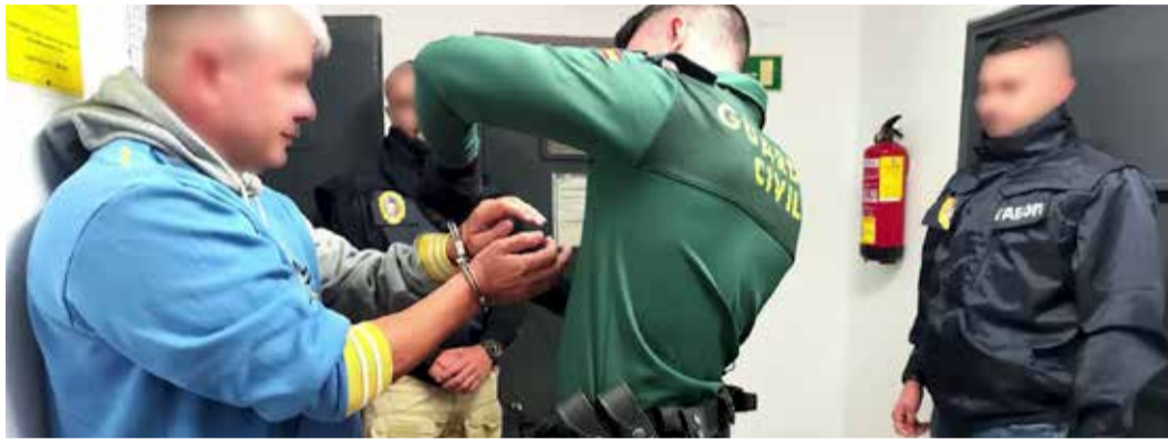
Police arrested 49 suspects, including accused drug lords.

"The scale of cocaine importation into Europe under the suspects' control and command was massive and over 30 tonnes