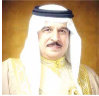
HM the King

He lauded HM King Hamad's kind gesture that had a positive