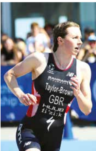
Georgia Taylor-Brown in action

The Olympic silver and gold medalist and 2020 world champion from Great Britain raced shoulder-to-shoulder with Flora Duffy, with whom she was in a dead heat for the top spot in the world rankings and the world title. After emerging from the 1.5-kilometre swim in 5th place, she stayed in the lead group on the 40-kilometre bike ride steering clear of bike crashes behind them whittling down the podium contenders to the three athletes who would eventually be on it. The 10-kilometre run decided not only who would win the race but also the series, with Taylor-Brown crossing the finish line one minute down to earn the runner-up position.