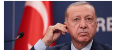
President Tayyip Erdogan with mortar shelling.

The escalation comes after a deadly bomb attack in Istanbul two weeks ago that Ankara blamed on the YPG militia. The YPG has denied involvement in the bombing and has responded at times to the cross-border attacks