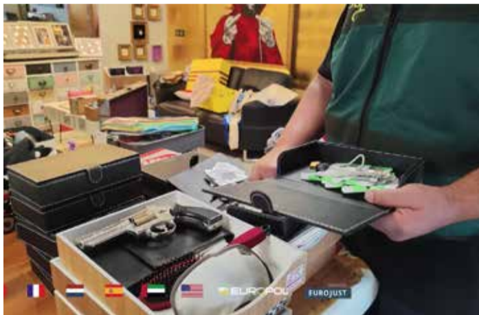
The cartel was also involved in money laundering, according to Europol, which coordinated the operation

"One of the Dutch suspects is an extremely big fish," a Europol source said on condition