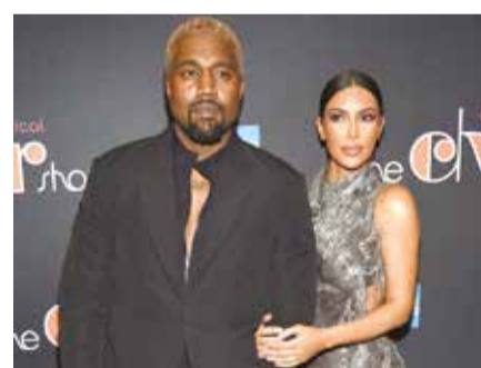
Kanye West and Kim Kardashian

Speaking on Thursday's episode of 'The Kardashians', she said: "Kanye tends to not care about his stuff and gives it all away. Kanye knows that I'm so protective of his stuff for the kids. even now when he was at the height of not speaking to me and being angry with me, he won a few Grammys and I still reached out, and was like, 'I know you just won a few Grammys. I gotta add them to the