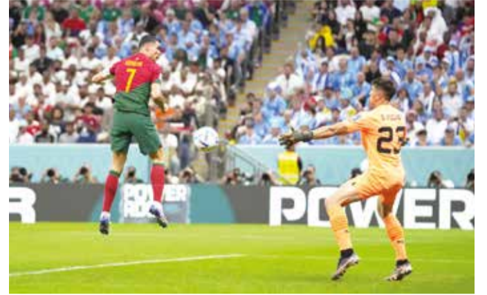
Portugal's Cristiano Ronaldo scores the opening goal