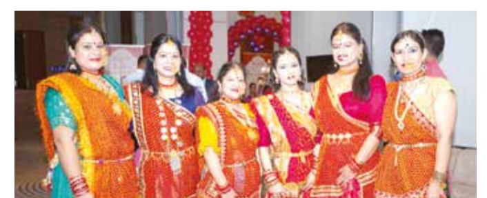
Uttarakhand Society of Bahrain members with Indian Embassy officials and guests at the event