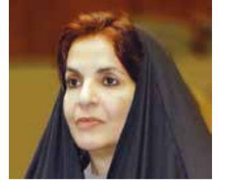
HRH Princess Sabeeka