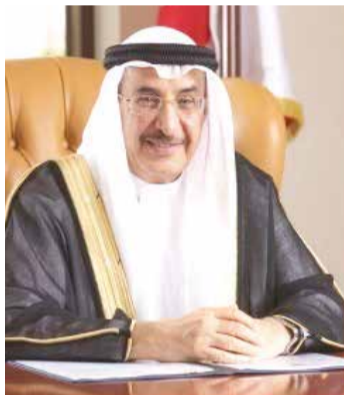
Deputy Prime Minister

The Cabinet congratulated the members of the Shura Coun-