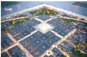
An artist's impression of the new airport