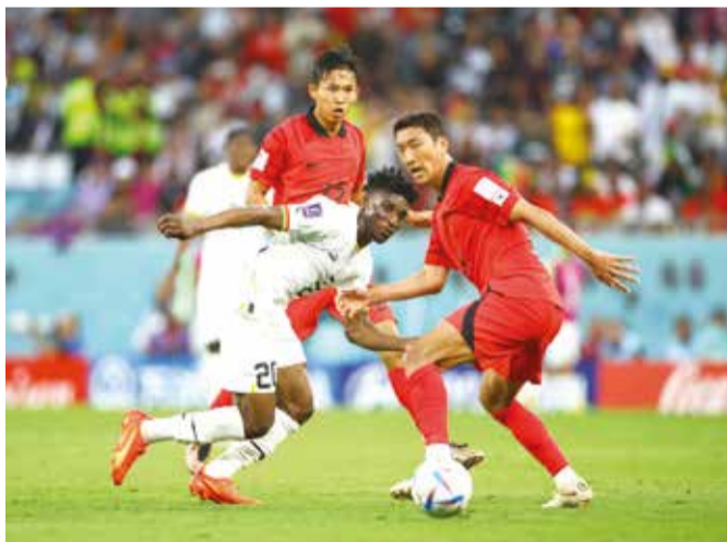
Ghana's Mohammed Kudus in action with South Korea's Jeong Woo-yeong and Jung Woo-young