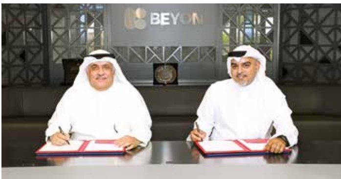
The deal signing

B atelco by Beyon and the Bahrain Chamber of Commerce & Industry have signed a Memorandum of Understanding (MoU) to strengthen collaboration in support of small and medium enterprises (SMEs) and enable their success within the Kingdom's rapidly evolving economy. The agreement underscores the shared commitment of both organisations to enhance the competitiveness of SMEs, recognising their contribution as