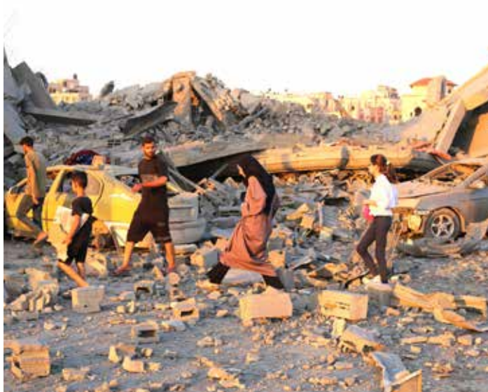
Palestinians walk past the rubble and a destroyed vehicle in the Al-Bureij camp in the central Gaza Strip after a house was targeted by an Israeli strike

The unprecedented attack on Qatari soil followed Washington's intervention into a days-