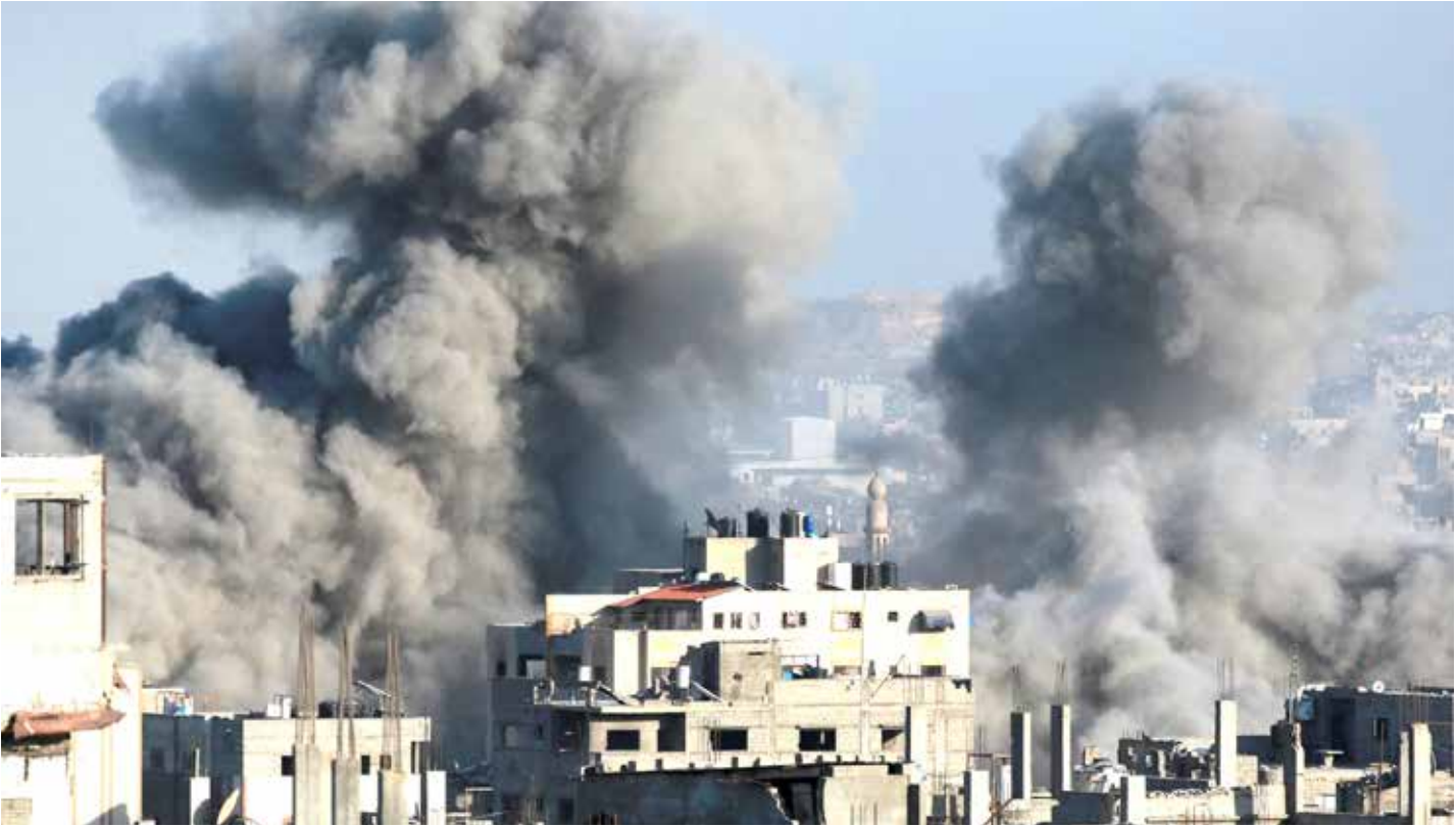
Smoke billows after an Israeli strike on Jabalia in the northern Gaza Strip.