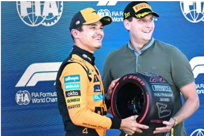
Pole position winner McLaren's British driver Lando Norris (L) poses with the pole position award

Lando Norris delivered a superb final flying lap in his McLaren yesterday to end Max Verstappen's run of domination in qualifying at the Red Bull Ring by claiming pole position for the Austrian Grand Prix. The 25-year-old Briton clocked an outstanding lap in one minute and 3.971 seconds to outpace nearest rival Charles Leclerc of Ferrari by 0.521 seconds, with McLaren team-mate and championship leader Oscar Piastri third. Norris, who is 22 points behind Piastri in the drivers' title race, erased any hangover from his collision with Piastri in Canada two weeks ago with a thrilling demonstration of his speed and talent. "It was a good lap, that's for sure," said Norris. "I guess that just little bit by little bit, I was able to get more time. Q1 was good, but I knew there were a few places I could get more time and I did what I planned to do." Verstappen had taken pole position at the Red Bull-owned circuit in the Styrian Alps for the last five F1 races before Norris succeeded and seized his first pole in Austria, his third of the season and 12th of his career.