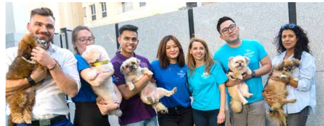
Dog lovers at the Hilton Bahrain event

Building on that momentum, Raise the Woof! introduces the concept of "pet-working" — yes, networking with a "p" — an event designed not only for pet owners to socialize but also for their furry companions to do the same.