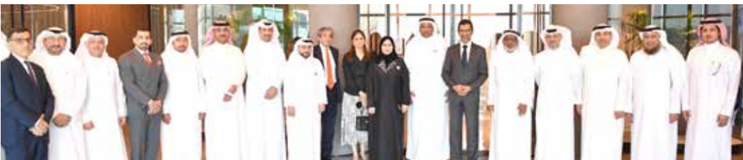
H.E. Eng. Wael bin Nasser Al Mubarak with ministry officials and private sector developers

Bahrain is reinforcing its commitment to collaborative urban development through closer cooperation between govern-