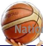
National team to face eight opponents in Chinese Taipei