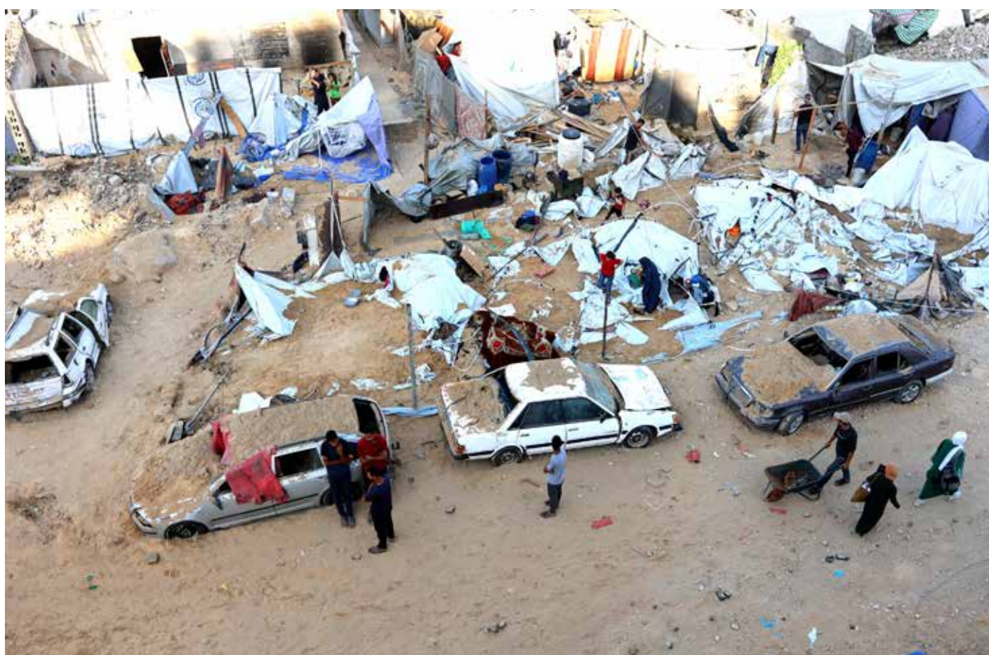
Palestinians look at the sand covering their tents and vehicles after the Israeli army targeted the tents of displaced people in the northern Al-Rimal neighborhood of Gaza City

Qatar urges Israel, Hamas to work towards truce