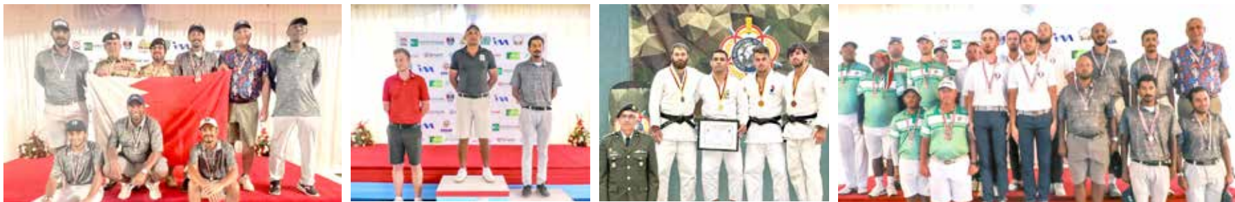
Bahraini military athletes are shining on the global stage, making the Kingdom proud