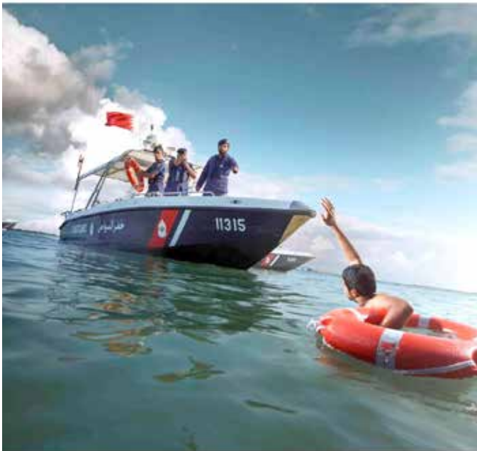
A Coast Guard patrol rescued a man swept away by sea currents near Khalifa bin Salman Port. He was found to be in good health.

The United Nations considers these figures to be reliable.