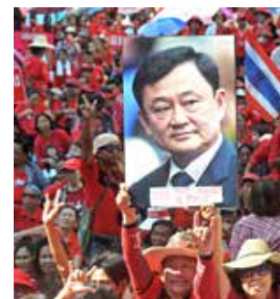
"Red Shirt" supporters hold a picture of fugitive former premier Thaksin Shinawatra

The crowd was mostly senior-aged and led by veteran activists of the "Yellow Shirt" movement, which helped oust Paetongtarn's father Thaksin in the 2000s.