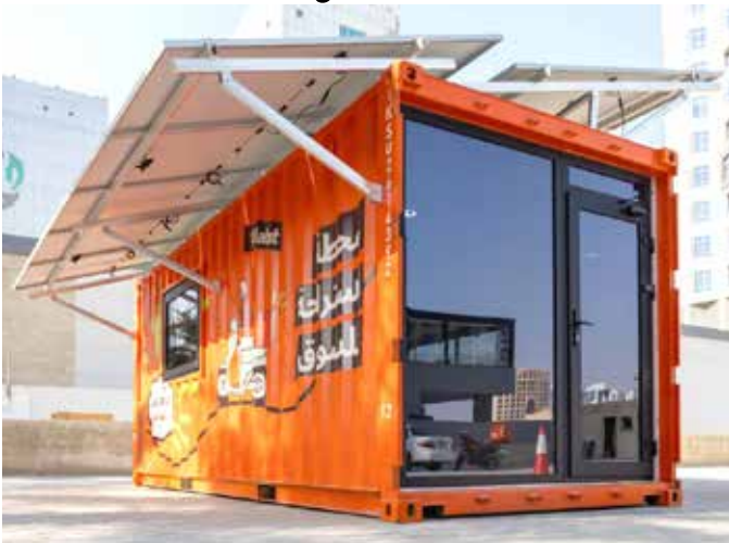
One of the rest stations

As part of a pioneering initiative to enhance the safe working environment for those working in the delivery sector, the Ministry of Labour has announced the launch of 12 air-conditioned and fully equipped rest stations for all delivery drivers from various companies and establishments, in cooperation with Talabat Bahrain, during the summer season. These stations offer com-