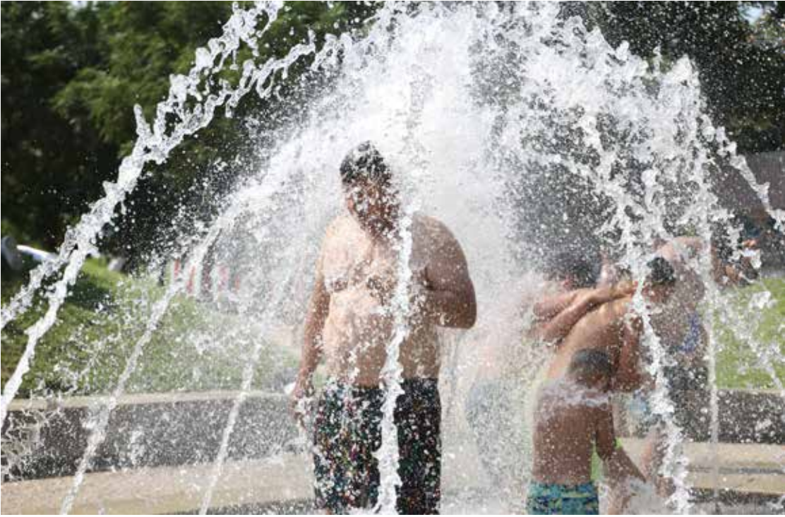
People cool off underneath water fountains in the Madrid Rio recreation area during the first heatwave of the summer in Madrid