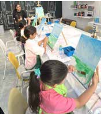
Fun and learning activities for the Kingdom's young aspiring artists