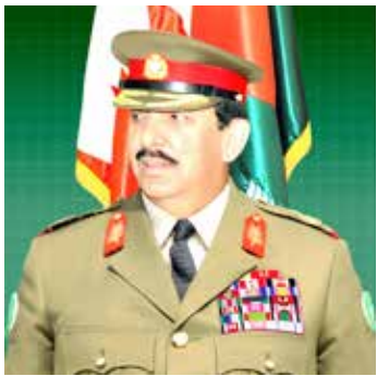
Field Marshal Shaikh Khalifa bin Ahmed Al Khalifa

The Bahrain Defence Force (BDF) has invested significantly in sports development, enabling its athletes to represent the nation with distinction in events such as athletics, golf and judo