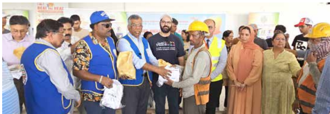
ICRF Bahrain and generous volunteers distribute food and drinks to expat workers

ICRF Bahrain distributed water, juice, laban, orange, apple and banana at the worksite of Mohammed Jalal Contracting Company.