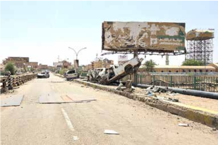
The wreckage of cars lie on the remains of the Shambat Bridge, which connects Omdurman and Bahri

Assistance to Sudan will be terminated “except for urgent humanitarian assistance and food or other agricultural commodities or products,” it said. However, certain measures will