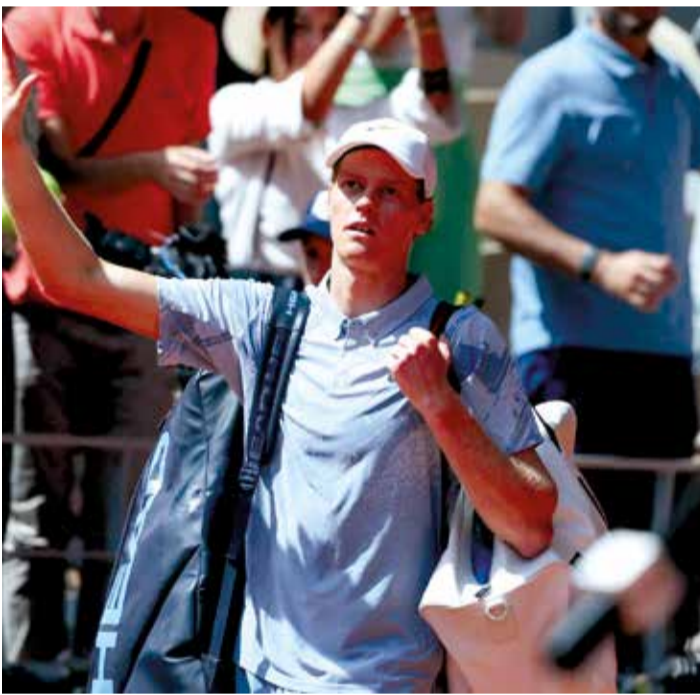
Italy's Jannik Sinner acknowledges the crowd as he reacts to his men's singles match defeat to Argentina's Juan Manuel Cerundolo

Czech Jakub Mensik collapsed on court with cramps after his win on Wednesday,