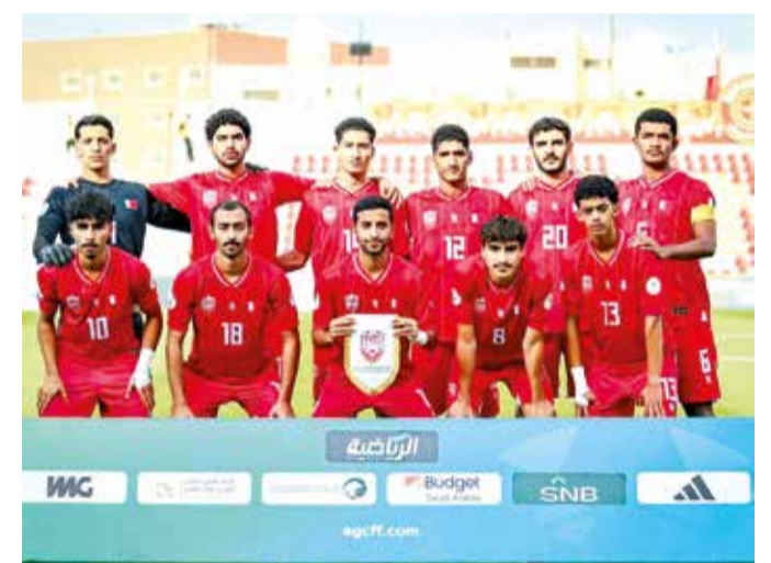
Bahrain's U-20 national football team line up before a match