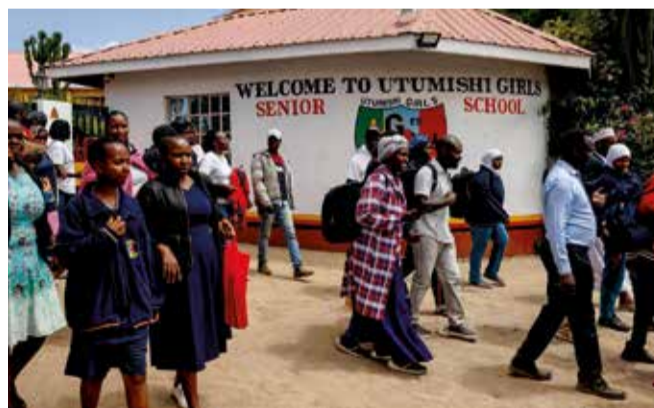
Parents and guardians walk outside the Utumishi Girls Academy following the deadly fire in Gilgil, north of the capital Nairobi

“Our hearts and prayers are with the families who have