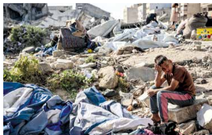
A Palestinian boy sits at the site of an overnight Israeli military strike on structures and tents housing displaced families, killing ten Palestinians, in Gaza City