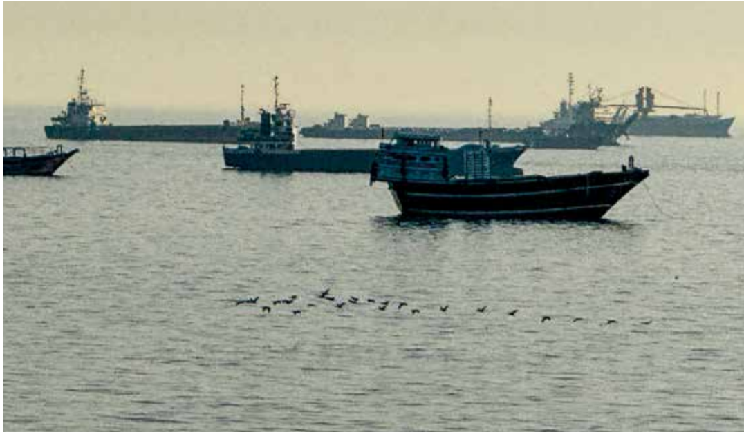
Vessels are seen anchored in the Strait of Hormuz, off the port city of Khasab on Oman's northern Musandam Peninsula

Iranian forces fired at four ships attempting to cross the Strait of Hormuz without authorisation, according to state