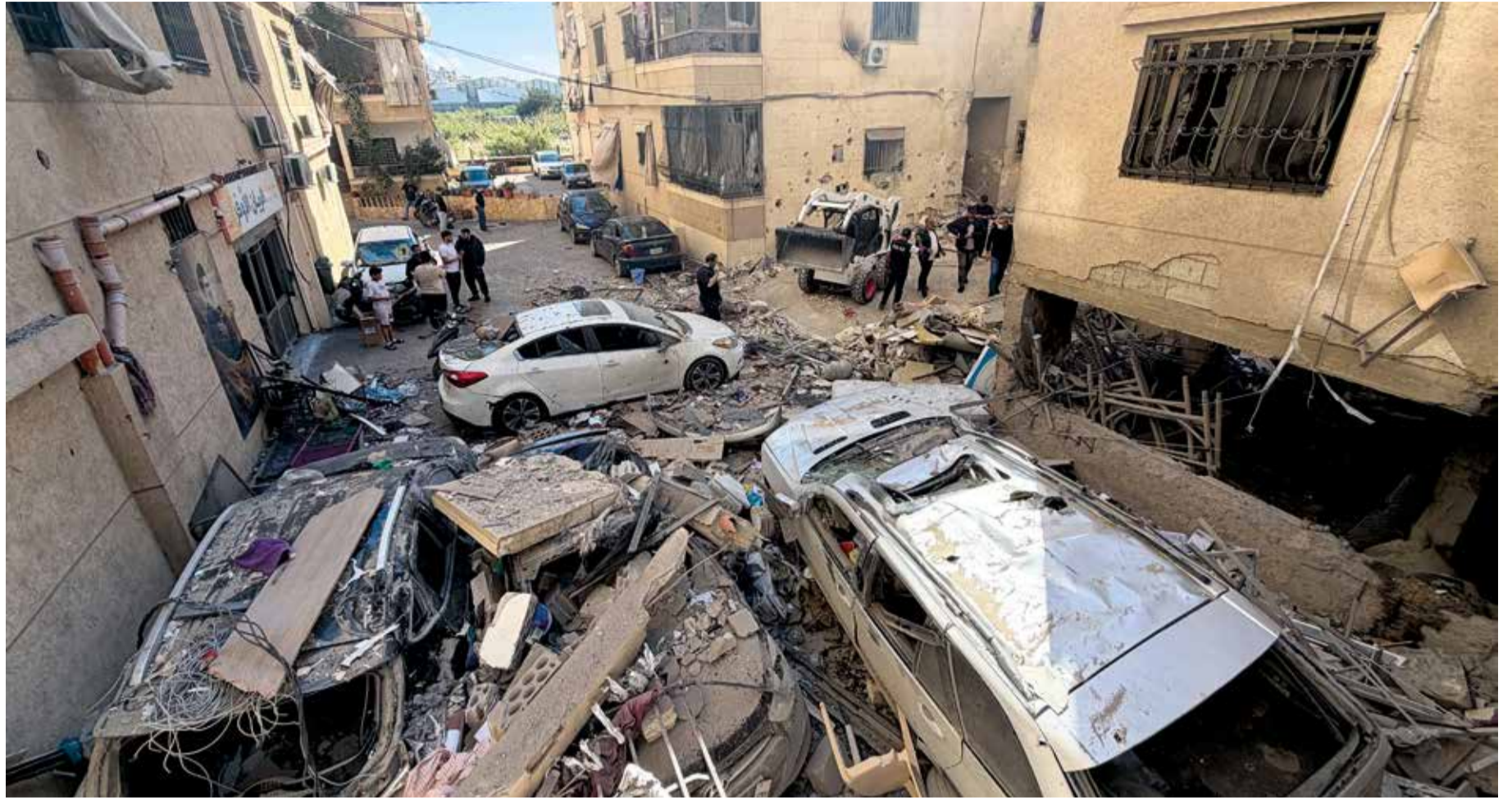
Rescue workers and local residents inspect the damage to a building following an Israeli air strike in the Choueifat area, south of Beirut

The presidency's statement praised his "wise leadership," saying he "led the Yemeni state through one of the most complex phases the country has ever experienced, amid war, coup, and unprecedented humanitarian and economic crises."