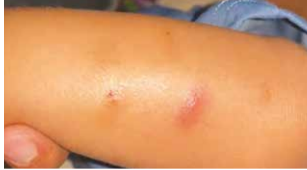
A resident shares a photo showing mosquito bites on his baby amid concerns over mosquito breeding in the area.

Daily Tribune, Engineer Mohammed Aman from the Supreme Council for the Environment said during a recent "Hayaakom" session organised by the Northern Municipal Council that "citizens are the eyes of environmental protection," calling for stronger sanitation practices and cooperation to address root causes.