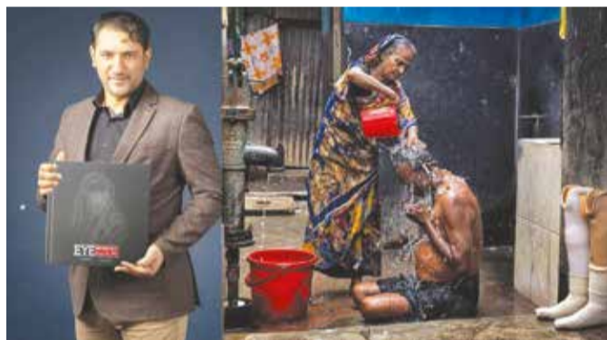
Recent award winning photo from the slums of Dhaka, Bangladesh