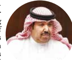
Waleed Al Dosari, MP