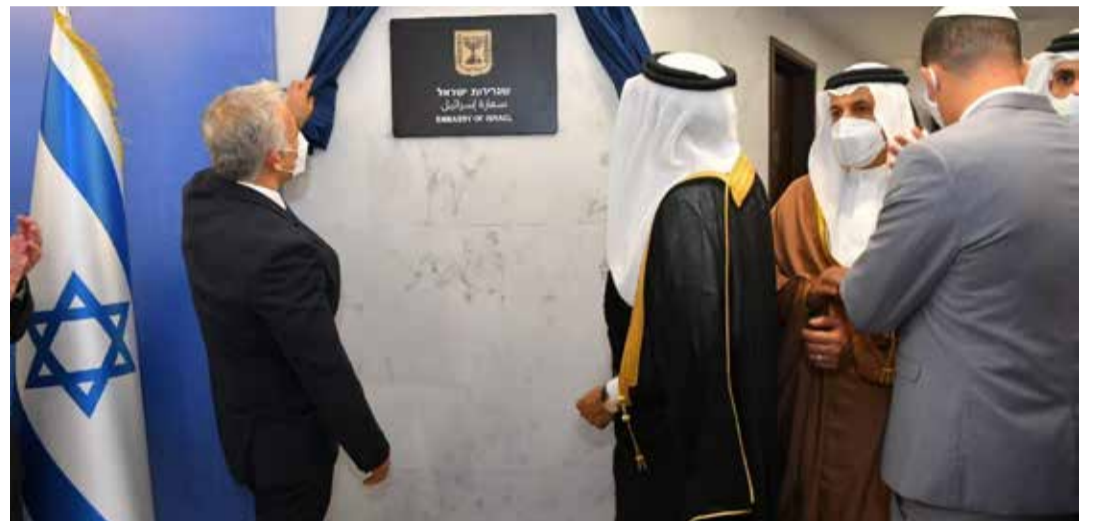
The opening of Israel Embassy in the Kingdom

industries in Israel are on the way to the Kingdom to forge partnerships as well as start operations here.