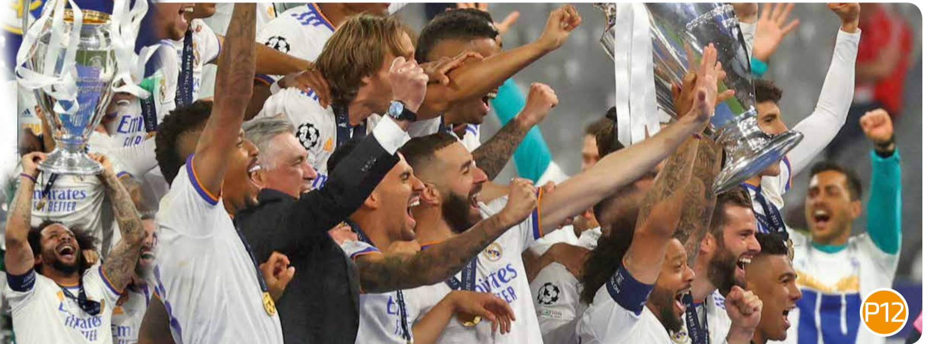
Real Madrid secured a record-extending 14th European Cup when they beat Liverpool 1-0 in a Champions League final delayed for more than half an hour after police tried to stop people trying to force their way into the Stade de France yesterday.