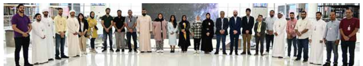
BAC officials and AGU students during a group photo opportunity