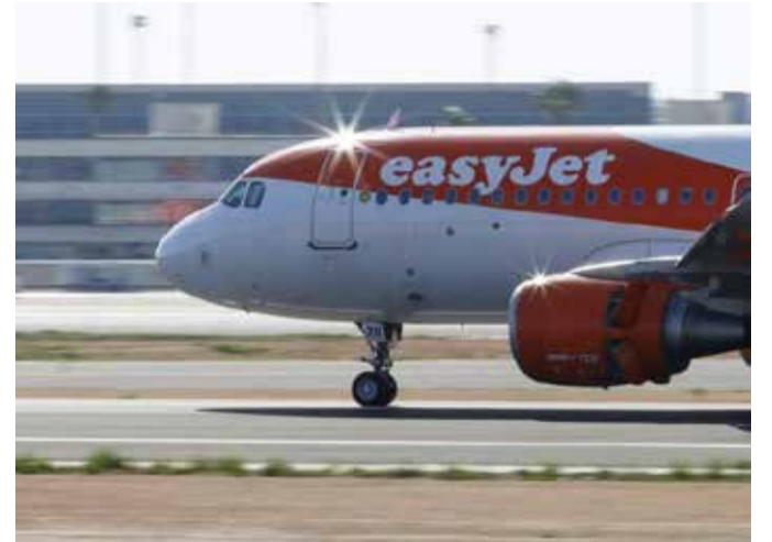
An EasyJet airliner lands at Son Sant Joan airport in Palma de Mallorca, ahead of Easter celebrations, Spain