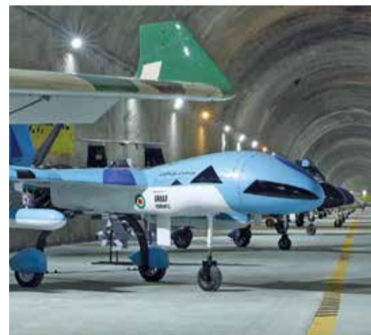
Drones are seen at an underground site at an undisclosed location in Iran

ted with Qaem-9 missiles, an Iranian-made version of air-to-surface U.S. Hellfire.