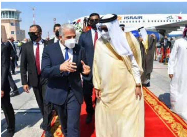
Foreign Minister Dr Abdullahatif Al Zayani receives Israeli Foreign Minister Yair Lapid

The envoy said an Israeli fintech firm is almost set to start its operations in the Kingdom and representatives of various