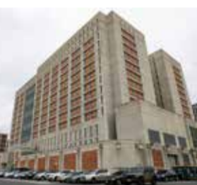
Metropolitan Detention Center (MDC), which is operated by the Federal Bureau of Prisons, is located in Brooklyn, New York