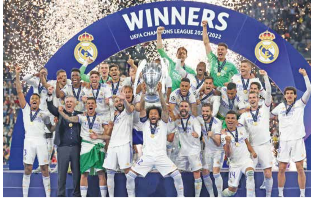
Real Madrid team members celebrate with the Champions League trophy

In a battle of European heavyweights, Jurgen Klopp's side had more opportunities but lacked sharpness when it mattered as Carlo Ancelotti became