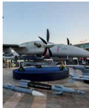
A Bayraktar Akinci unmanned combat aerial vehicle is exhibited at Teknofest aerospace and technology festival in Baku, Azerbaijan