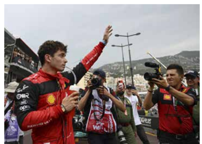
Ferrari driver Charles Leclerc of Monaco celebrates after setting the pole position

The session was red-flagged to a halt when Perez crashed,