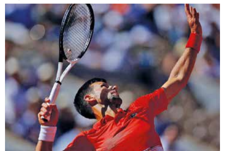
Novak Djokovic in action during a match

Scott Morrison, the Prime Minister at the time, has lost elections since and Australia's