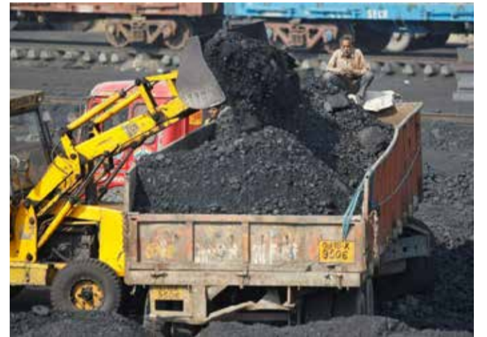
Worker sits on a truck being loaded with coal at a railway coal yard on the outskirts of the western Indian city of Ahmedabad