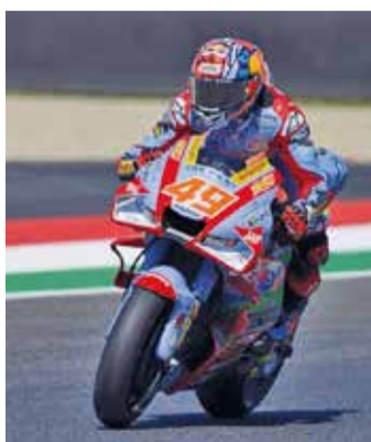
Gresini Racing Ducati's Italian rider Fabio Di Giannantonio rides during a qualifying session

The 23-year-old Italian had made his way into the second run after topping the times in the first qualifying session and his team celebrated wildly as he crossed the line after time had elapsed to snatch pole at