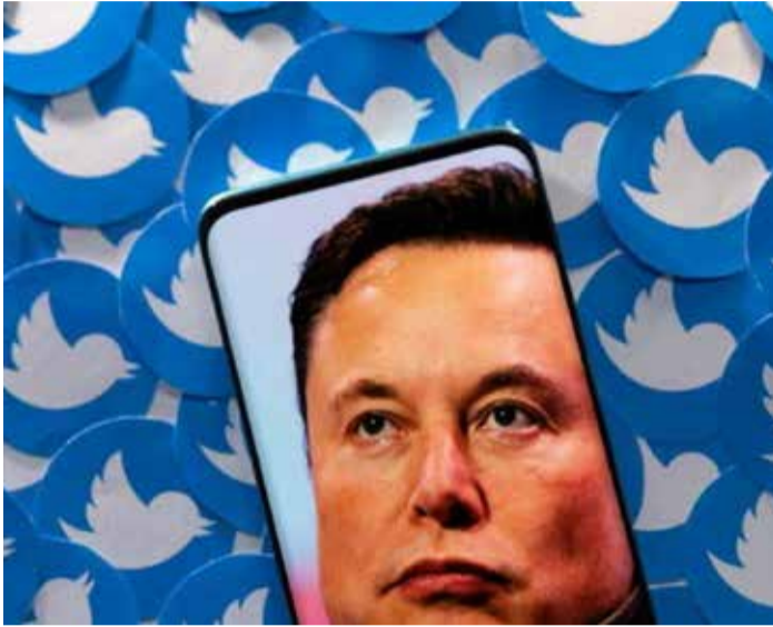
An image of Elon Musk is seen on smartphone placed on printed Twitter logos

Specifically, the SEC asked Musk to explain why he opted to initially file a "13G" disclosure form, which is meant for investors who plan to hold their shares passively instead of a "13D" form, which is for activist