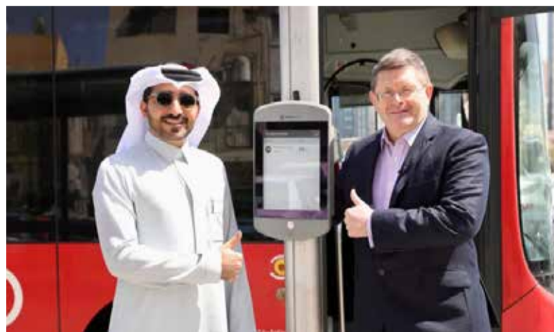
Replacing paper timetables, the new bus stop displays utilise solar-powered electric paper to provide live accurate bus arrival and departure times.

This project is part of a national strategy to modernise public transport and transform mobility for all