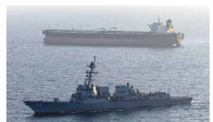
Guided-missile destroyer USS Rafael Peralta (DDG 115) enforces the U.S. blockade of Iranian ports against M/T Stream after it attempted to sail to an Iranian port, April 26.

Jordan has repeatedly warned against unilateral actions in the occupied territories, calling for renewed international efforts to revive a viable peace process.