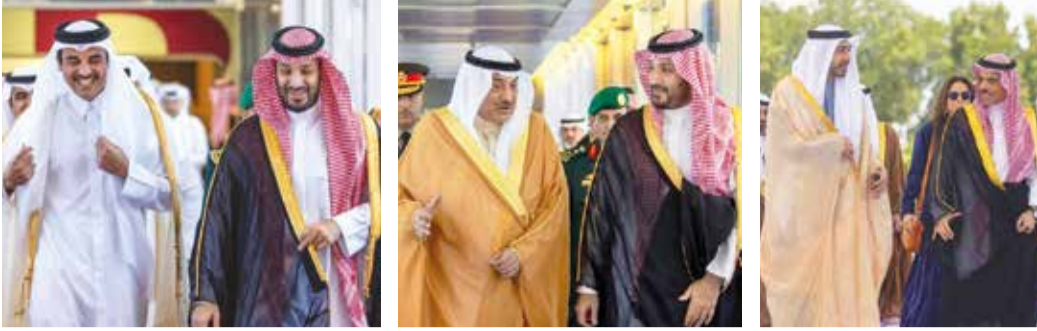
Leaders from Qatar, Kuwait and the UAE arrive at the summit.

Saudi Crown Prince Mohammed bin Salman chaired a Gulf Cooperation Council (GCC) consultative summit in Jeddah, bringing together Gulf leaders for the first time since the Iran war outbreak two months ago.