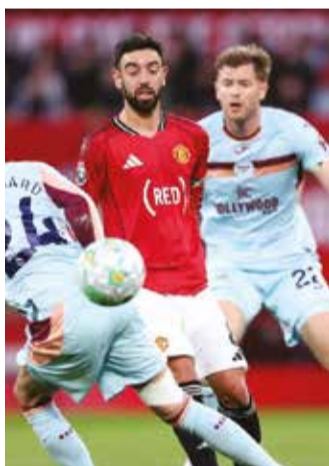
Fernandes in action during Manchester United's latest outing

forward before slipping a precise pass into Benjamin Šeško, who beat Nathan Collins with a sharp feint before finishing clinically to seal the win. The move further highlighted Fernandes' all-round influence, combining progression, vision, and final delivery.