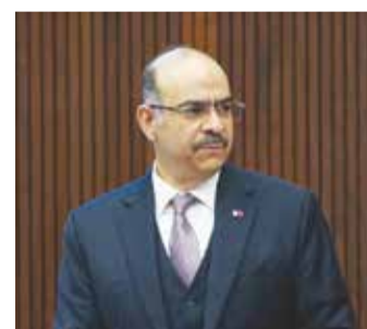
Yousuf Khalaf, Minister of Labour