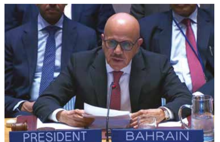
H.E. Dr. Abdullatif bin Rashid Al Zayani speaks at the UN Security Council

While broader regional issues, including maritime security and tensions involving Iran, were