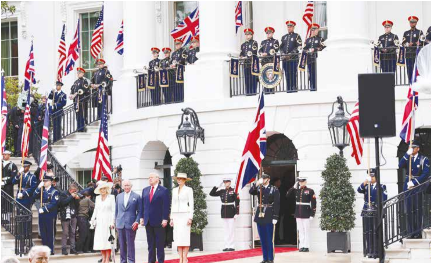
US President Donald Trump and First Lady Melania Trump welcome Britain's King Charles III and Queen Camilla during an arrival ceremony on the South Lawn of the White House in Washington, DC.

"In the centuries since we won our independence, Americans have had no closer friends than the British," said Trump, referring to the fact that the royal visit marks