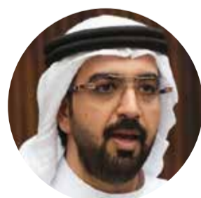
“The total number of disconnections across all categories is high enough to require a full policy review” HASSAN EBRAHIM, MP

BETTER YOU KNOW Electricity generation, transmission, and distribution cost BD550.8 million in 2024, with the government covering about 32% of the total.