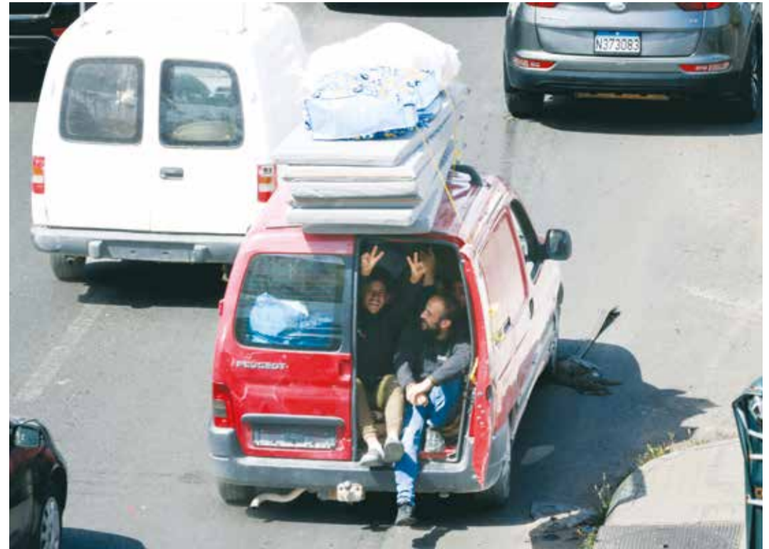
A woman flashes the V-sign as she rides in the back of a van laden with mattresses, as civilians flee their homes and head north toward the Lebanese capital, hours after a military escalation that included Israeli airstrikes targeting the south

"Out of concern for your safety, you are required to evacuate your homes immediately and move... towards the Sidon District," the military's Arabic-language spokesman Avichay Adraee wrote on X.