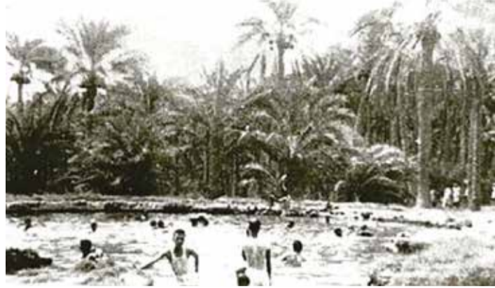
Old and new photos of the site

The project aims to transform the site into a heritage