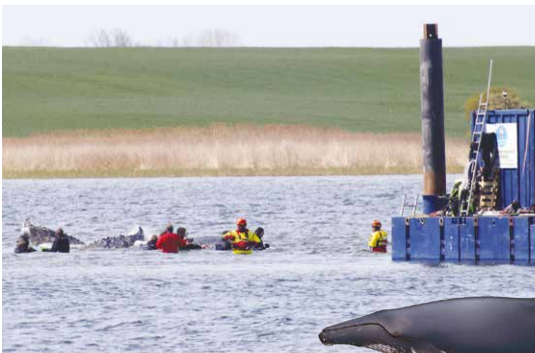
People are seen close to a stranded humpback whale, guiding the animal to a special barge intended to bring it to the North Sea, in the Wismarer Bucht bay of the Baltic Sea off the island of Poel, northern Germany, close to the village of Faehrdorf-Hof

After some distance, the whale, with rescuers swimming alongside it, sped up and then swam into the barge, sparking