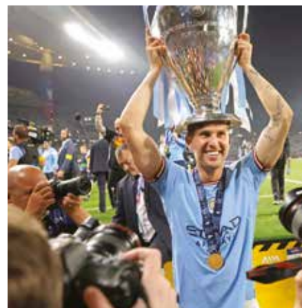
John Stones lifts the Champions League trophy for Manchester City in 2023

Known for his composure on the ball, Signed as Guardiola's second recruit and once the world's second most expensive defender, Stones endured early criticism and injury setbacks before becoming a key figure in City's dominant era.