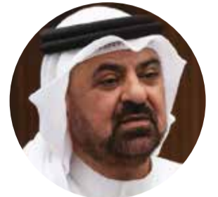
Mohammed Al Ma'arfi, MP

sovereign issue directly tied to state stability and security, noting that existing law already provides grounds for revocation in cases involving threats to national security.