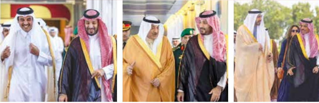
Leaders from Qatar, Kuwait and the UAE arrive at the summit.

Saudi Crown Prince Mohammed bin Salman chaired a Gulf Cooperation Council (GCC) consultative summit in Jeddah, bringing together Gulf leaders for the first time since the Iran war outbreak two months ago.