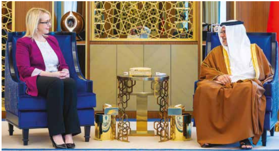
HRH Prince Salman receives the US Ambassador to Bahrain, H.E. Stephanie L. Hallett.

He stressed Bahrain's interest in further strengthening bilateral cooperation, building on existing agreements and memoranda of understanding, including the recent Comprehensive