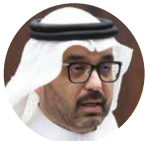
Ahmed Al Salloom, MP