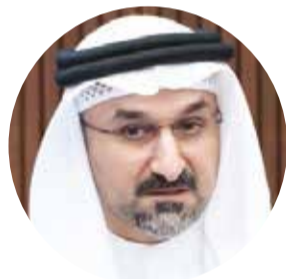
H.E. Abdulla Fakhro, Minister of Industry and Commerce

stock companies and extend the period to 90 working days for partners to decide the future of a business following major structural changes such as death, insolvency, or withdrawal.