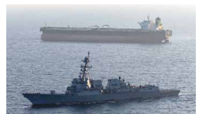
Guided-missile destroyer USS Rafael Peralta (DDG 115) enforces the U.S. blockade of Iranian ports against M/T Stream after it attempted to sail to an Iranian port, April 26.

Jordan has repeatedly warned against unilateral actions in the occupied territories, calling for renewed international efforts to revive a viable peace process.