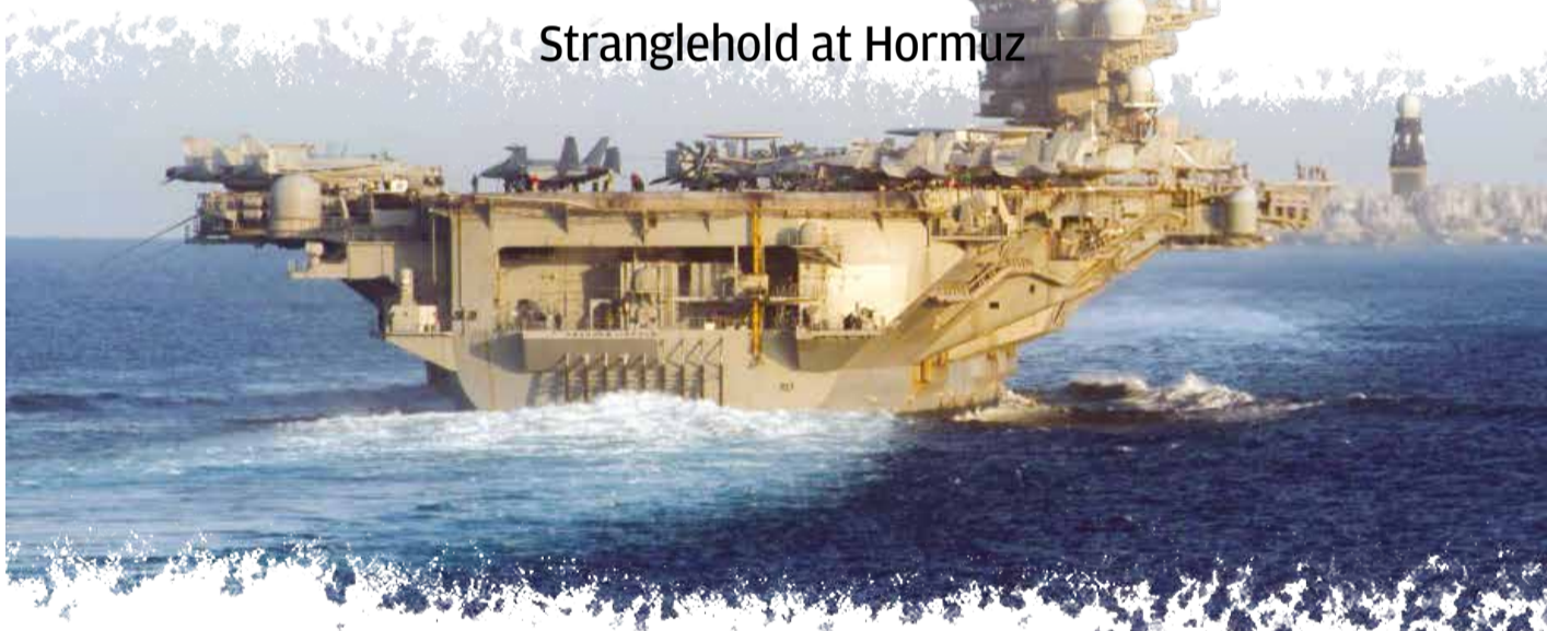
The aircraft carrier USS Abraham Lincoln (L), the air-defense destroyer HMS Defender and the guided-missile destroyer USS Farragut transit the Strait of Hormuz

Trump had signaled at Monday's meeting that he was reluctant to take Hormuz off the table