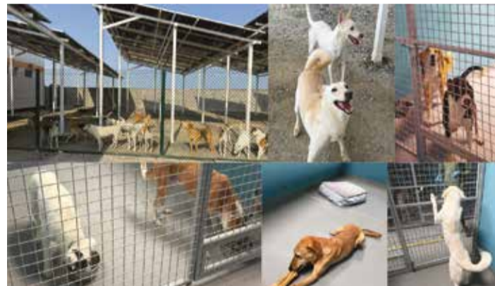
From our recent visit to BARC's new animal shelter.

Behind every rescue is a detailed process, the BARC team told TDT. Each animal undergoes medical checks, vaccinations and treatment before joining shared spaces. Even healthy animals need preventive care,