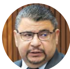
“Overdue electricity and water bills have reached BD84.01 million” H.E. YASSER HUMAIDAN, MINISTER OF ELECTRICITY AND WATER AFFAIRS

MP Ebrahim called for faster rollout of energy-saving initiatives and renewable energy programmes, particularly ahead of peak summer demand.