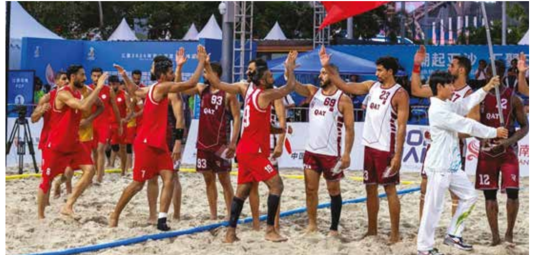
Bahrain and Qatar beach handball teams during pre-match introduction

The second period saw a more composed and aggressive Bahrain side emerge. Askani and Mahdi Ali led the response, repeatedly converting spin shots