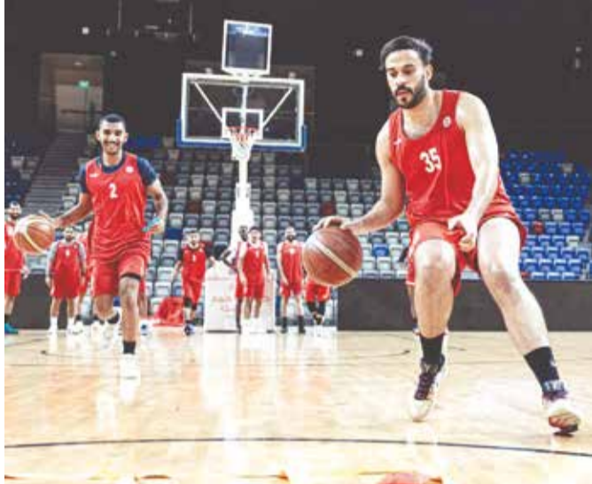
Bahrain's men's national basketball team during training drills