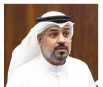
Mahmoud Fardan, MP

Mahmoud Fardan said the ministry was asked to explain the gap but responded that a full scientific and technical analysis of its data systems was required.