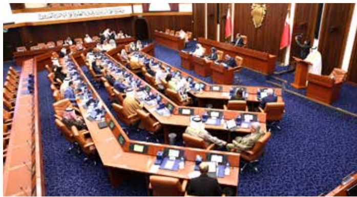
The Shura Council session in progress