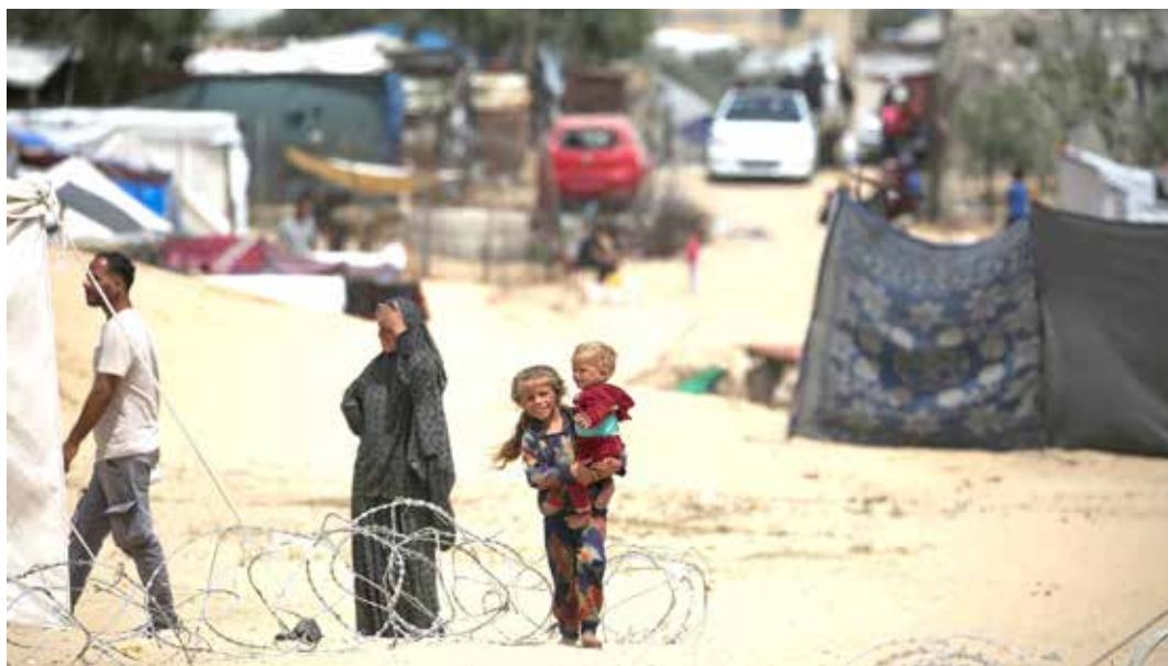
Children walk in a camp for displaced people in Rafah in the southern Gaza Strip by the border with Egypt, amid the ongoing conflict between Israel and the Palestinians.

US Secretary of State Antony Blinken, Palestinian leaders and high-ranking officials from other countries trying to broker a ceasefire between Israel and