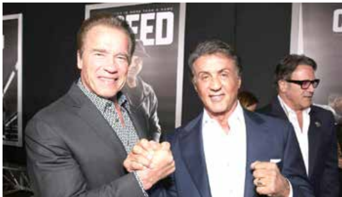
Arnold Schwarzenegger and Sylvester Stallone

Arnold Schwarzenegger and Sylvester Stallone battled over the level of fat and body counts in their films. The 'Predator' actor, 76, and his former rival Sly, 77, warred over everything from their earnings to their muscles and the size of the weapons they wielded in their films at the peak of their action movie pomp in the 1980s. In an upcoming joint TV interview titled 'TMZ Presents: Arnold and Sly: Rivals, Friends, Icons', the ageing muscle-bound Hollywood veterans admit they are still