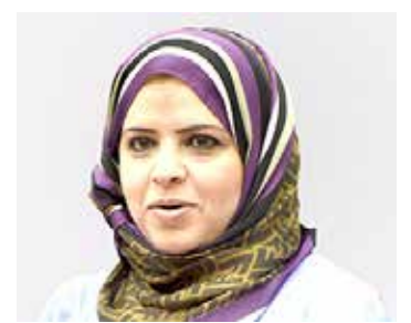
MP Dalal Al-Zayed