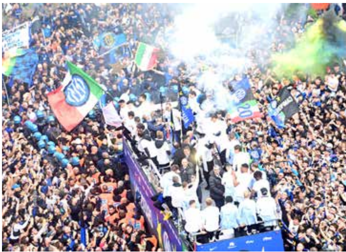
Inter Milan players and staff parade on a bus to celebrate the scudetto

Most of those fans were denied the chance to see Inter win