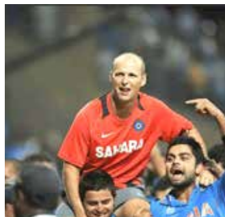
Indian cricketers hoist coach Gary Kirsten (C) onto their shoulders after victory in the Cricket World Cup 2011 final

state of the team and charting a path towards our desired goals is paramount," said Kirsten.