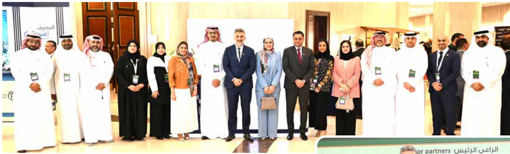
In pictures, officials during the event

Musk later said on X, which he also owns, that he was honored to meet with Li, adding the pair "have known each other now for many years".