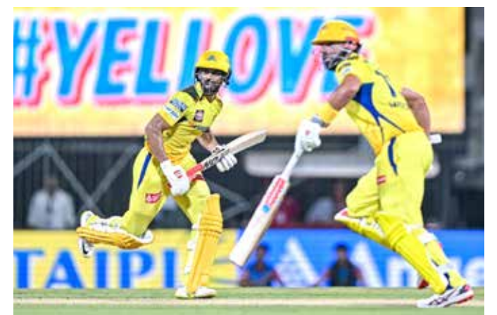
Ruturaj Gaikwad and Daryl Mitchell of Chennai Super Kings run between the wickets