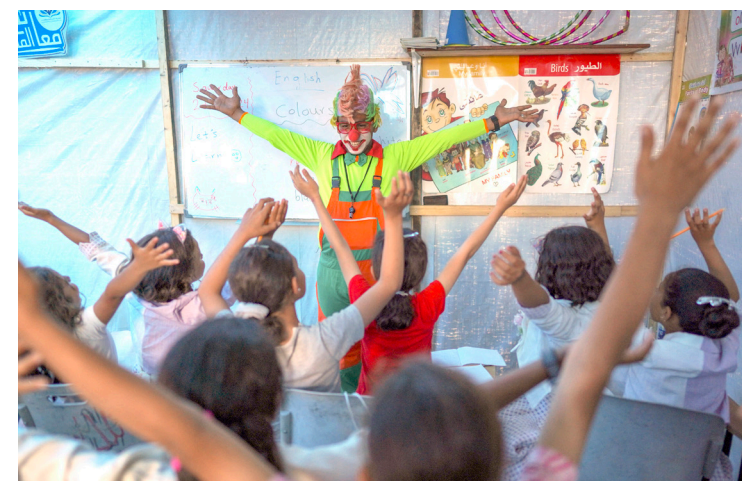
A man dressed as a clown entertains children at a makeshift school in a camp for displaced Palestinians in Deir El-Balah, in the central Gaza strip

(The views and opinions expressed in this article are those of the author and do not necessarily reflect the official policy or position of the Daily Tribune)