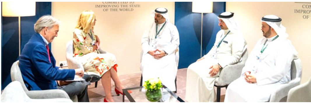
H.E. Shaikh Salman holds talks with Sigrid Kaag

The Minister of Finance and National Economy, His Excellency Shaikh Salman bin Khalifa Al Khalifa, affirmed the commitment of Bahrain to supporting peace and security efforts, as well as upholding the values of coexistence and human fraternity in the region and the world in line with the vision of His Majesty King Hamad bin Isa Al Khalifa of