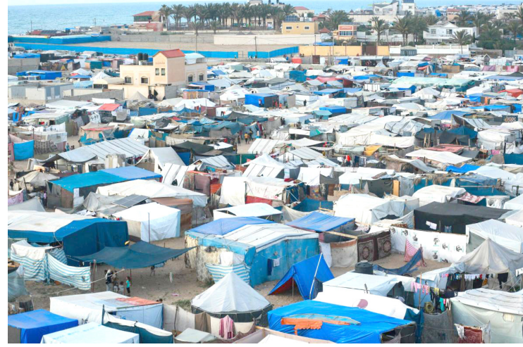
A camp for displaced Palestinians in Deir El-Balah, in the central Gaza Strip

Egypt, Qatar and the United States have been trying to mediate a new truce ever since a one-week halt to the fighting in November saw 80 Israeli hostages