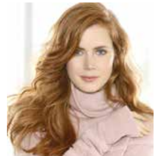
Amy Adams Celebretainment | Los Angeles