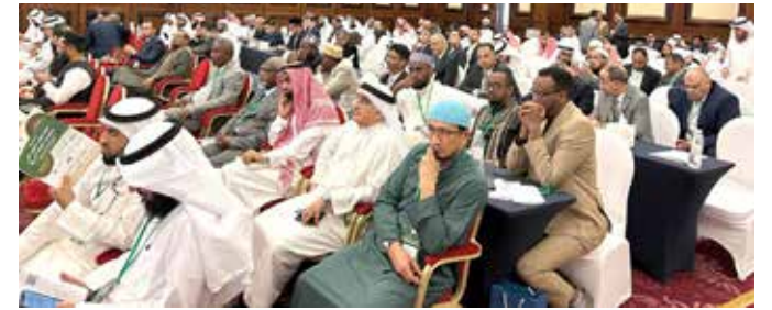
Attendees at the event