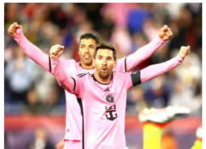
Lionel Messi and Luis Suarez of Inter Miami celebrate after a goal