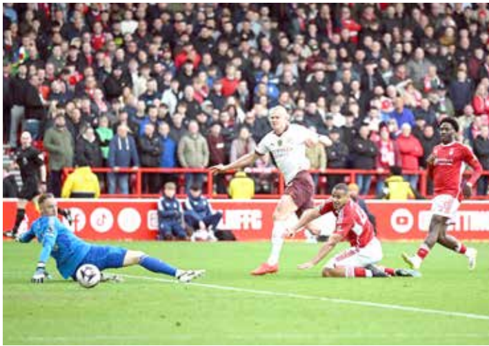
Erling Haaland of Manchester City scores his team's second goal past Matz Sels of Nottingham Forest

City remain firm favourites to land yet another league title with four games remaining -- one more than Arsenal.