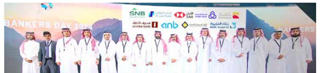
Officials during a photocall

NEOM yesterday announced it has secured a new revolving credit facility (RCF) worth SAR 10 billion. It represents another milestone for NEOM as it progresses with the development of major projects and will be used to support NEOM's short-term financing requirements. The RCF, which follows a Murabaha structure, reflects a continuation of NEOM's strategy to diversify its sources of