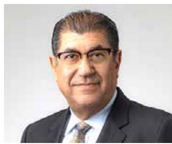
MP Jamal Fakhro