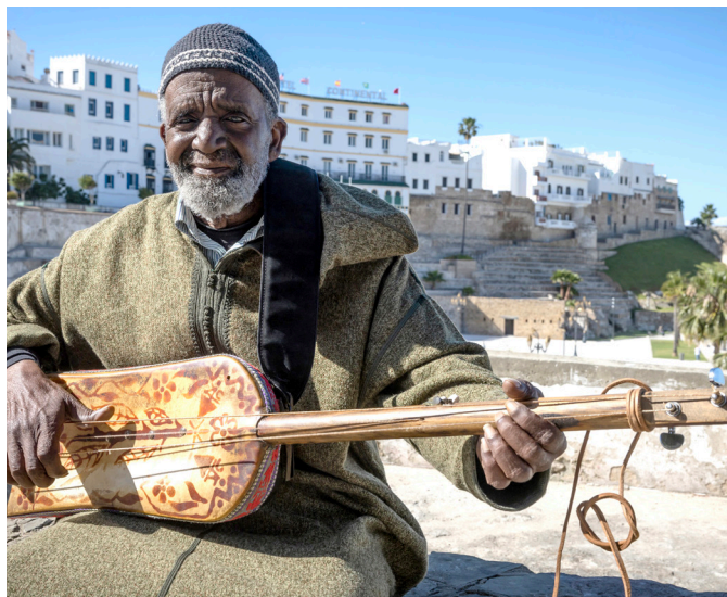
Abdellah El Gour, a 77-year-old Moroccan legend of gnawa music, poses for a picture in the old city of Tangiers